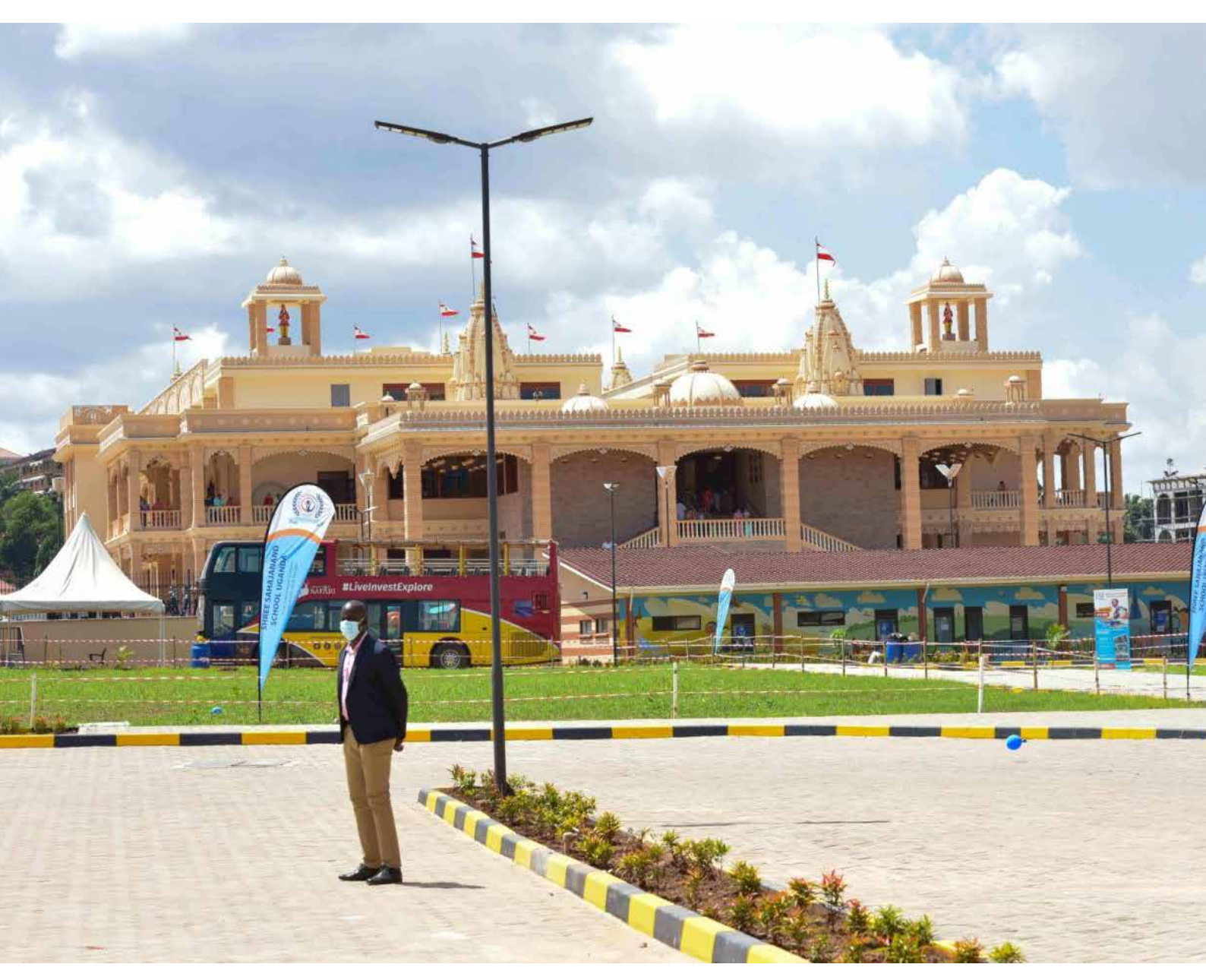
The newly built Indian Shree Kutchi Leva Patel Community Temple in Bukoto, Kampala

The commissioned school which opens in February, 2023 will follow the National Curriculum which was built by proprietors of Tororo Cement in partnership with the Indian Shree Kutchi Leva Patel Community (SKLPS) as part of their corporate social