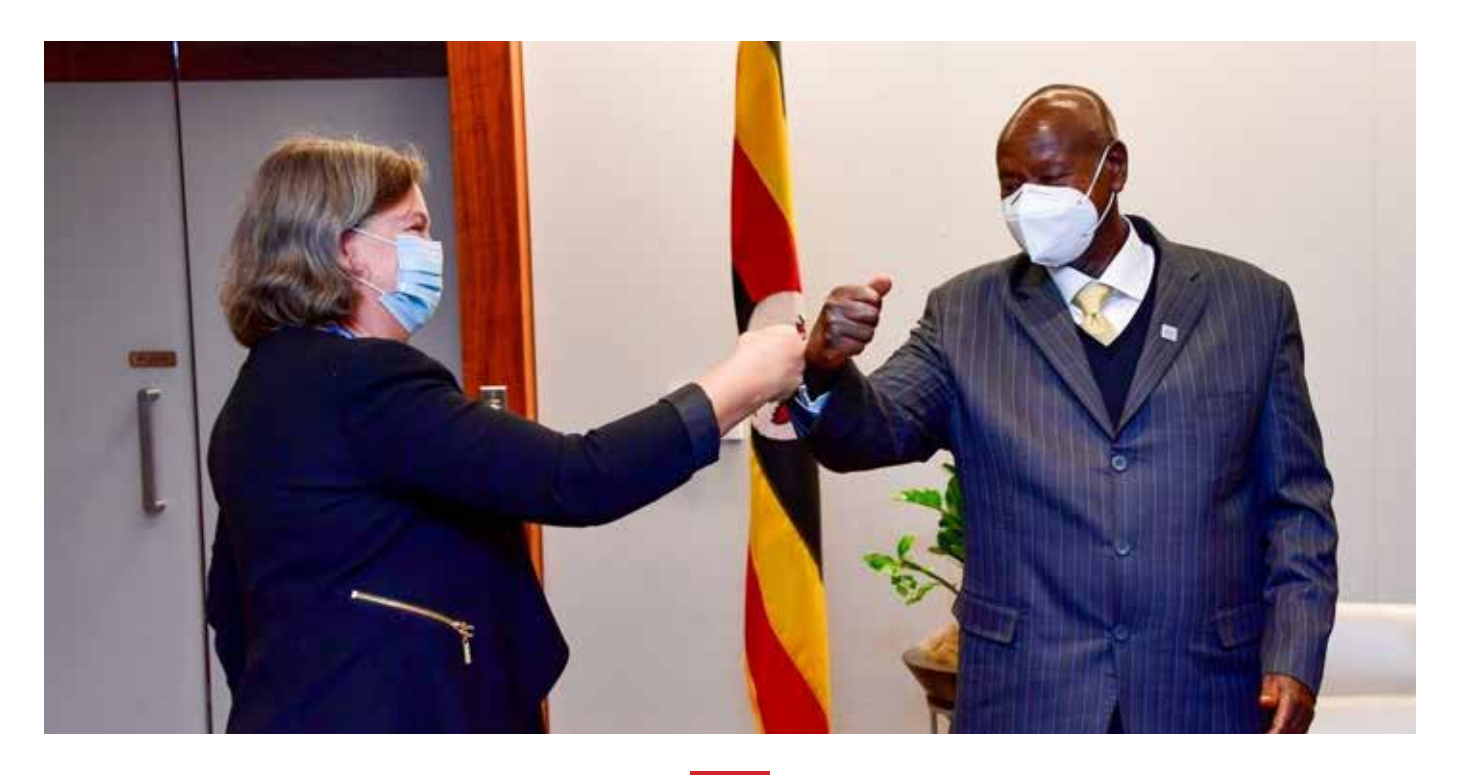
President Museveni and Undersecretary Victoria Nuland exchange pleasantries during the meeting in Washington DC

The Summit focused on increasing bilateral trade and investment in critical areas especially health, energy, agribusiness and ICT among other areas.