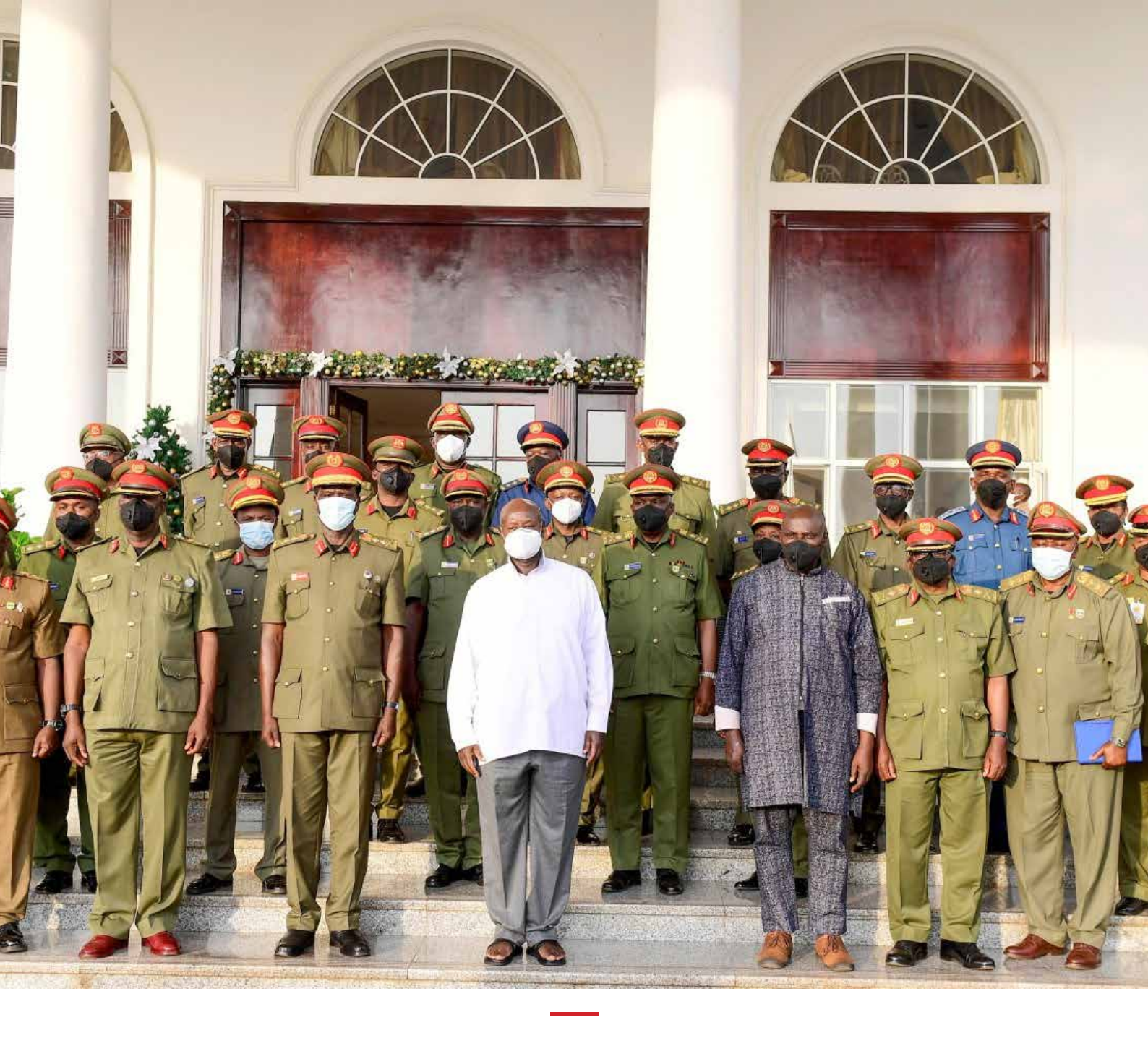
President Museveni poses for a photo with the NDC delegation during the meeting at State House, Entebbe

to maintain the roads that have been constructed including murram ones.