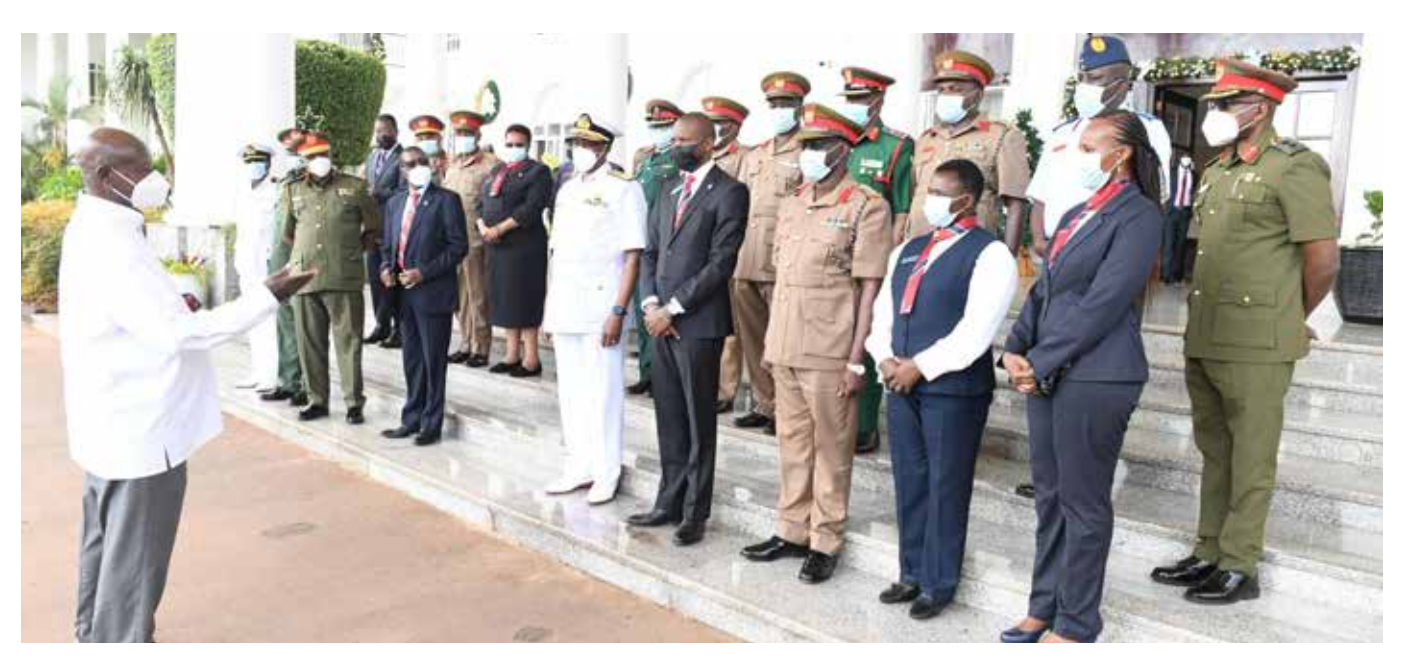
President Museveni gestures to the officers from National Defence College of Kenya during the meeting at State House, Entebbe

The President told the visiting delegation that another channel of transforming society is through education, adding that in Uganda the Government adopted the universal primary and secondary school education program to enable