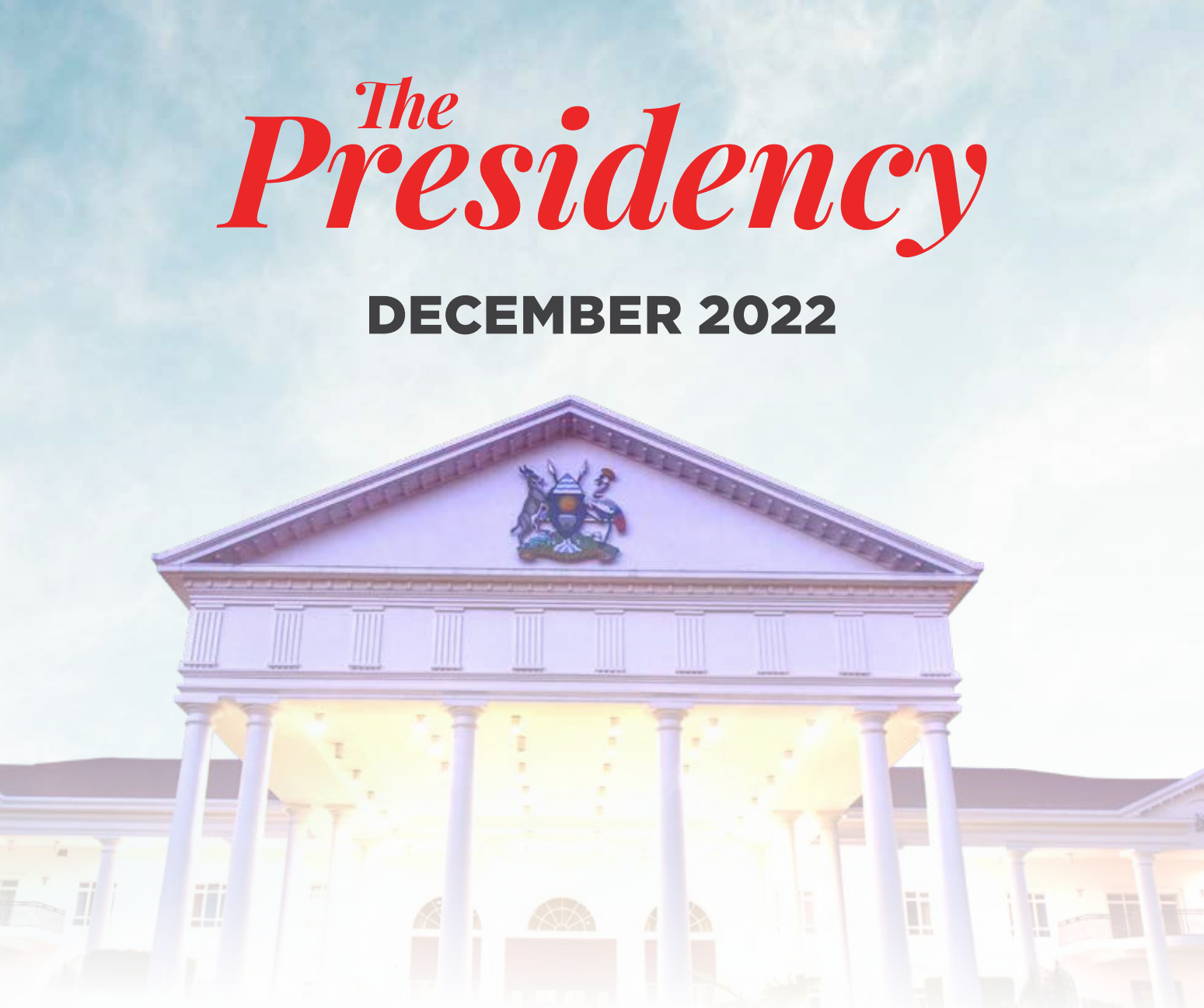
Your Monthly Round-Up of State House News