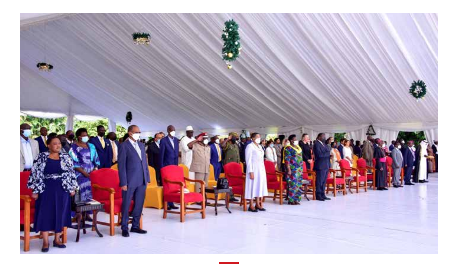
Part of the congregation during the thanksgiving at service at State House, Entebbe

On the issue of the current cost of living in Uganda, Gen. Museveni explained to the congregation that its coming from the problem of petroleum which is caused by the