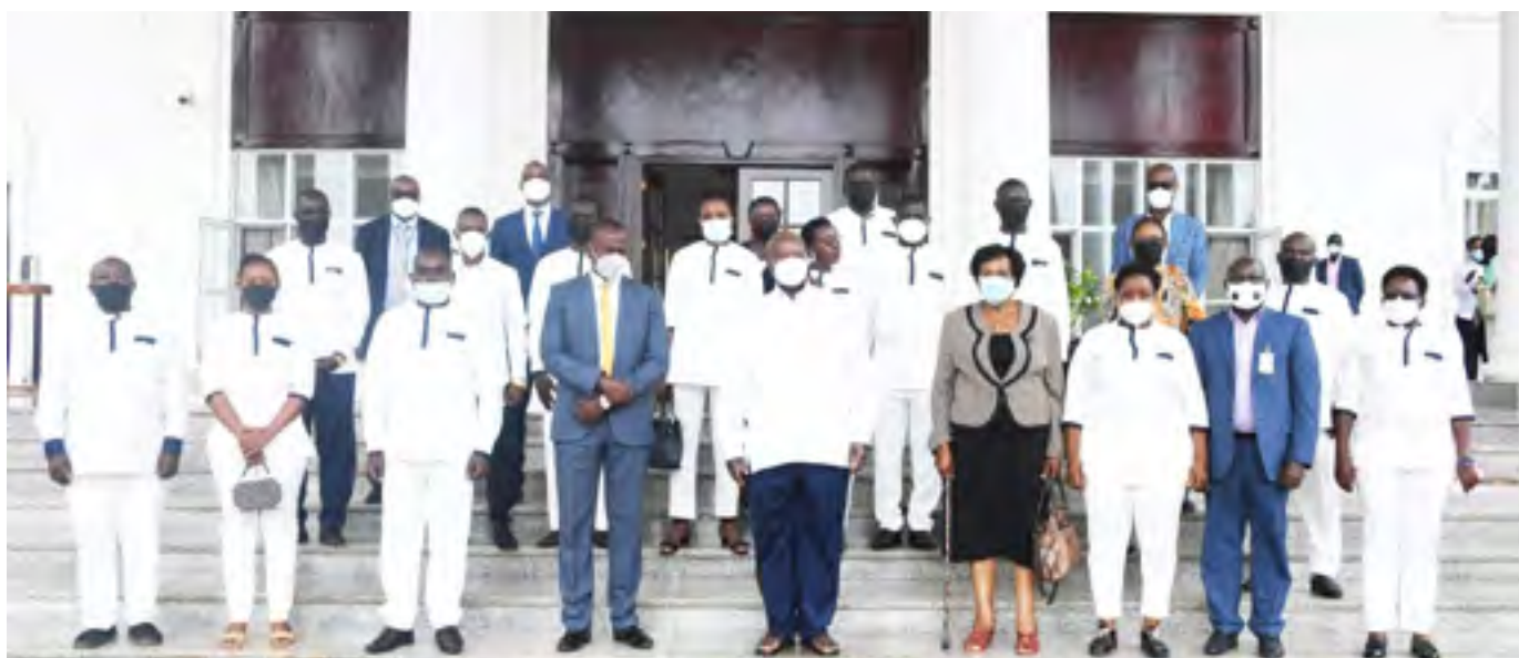
President Museveni poses for a photo with the delegation organising the beatification ceremony after a meeting at State House, Entebbe