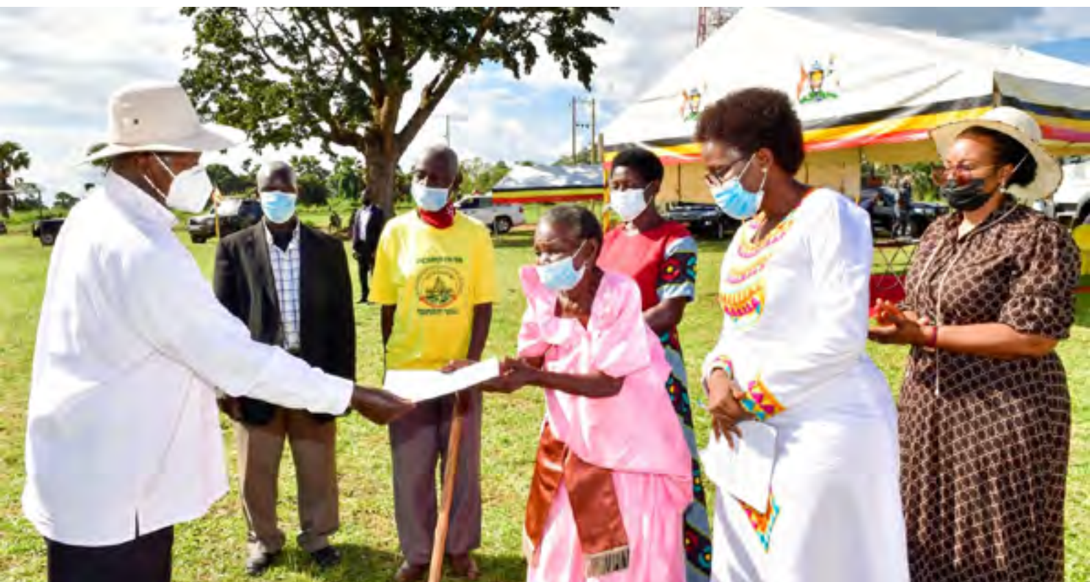
President Museveni hands a certificate of land registration to an elderly lady at Ibuje Primary School in Apac District