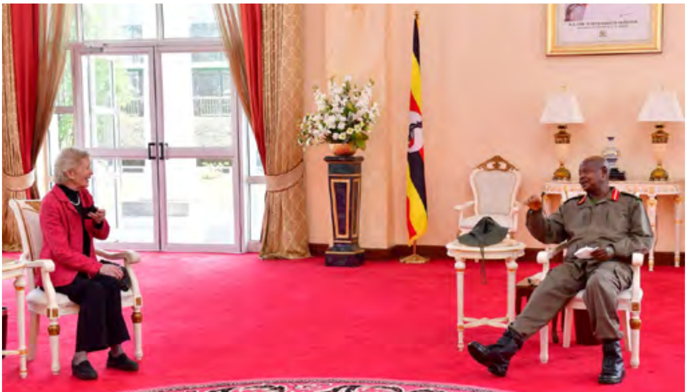
President Museveni meeting H.E. Mary Robinson at State House, Entebbe

He informed her that his government has embarked on efforts to restore the environment, especially keeping all water catchment areas intact to avoid effects that come with long drought seasons.