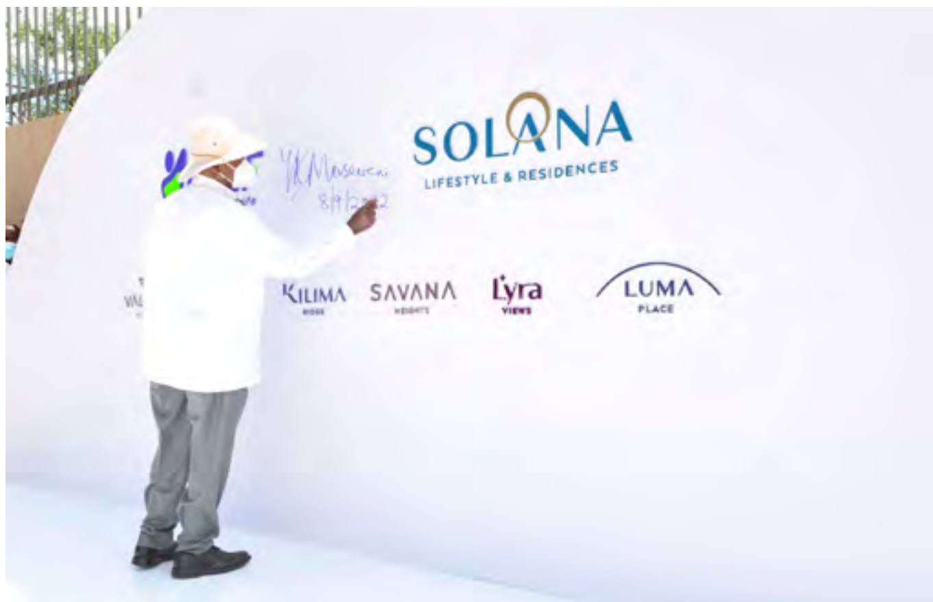
President commissions the NSSF Solana Lifestyle and Residences Housing Project at Lubowa, Wakiso District