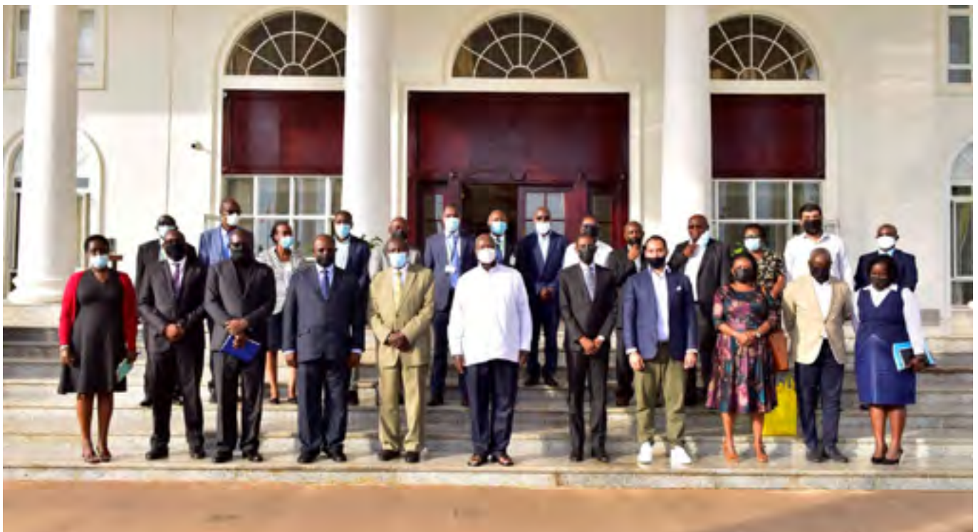
President Museveni posing for a photo with coffee stakeholders after a meeting at State House, Entebbe

“Before we came to power; we wrote a 10-point program. Point No.5 was about building an economy, which