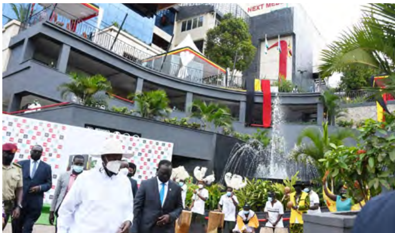
President Museveni is received by the CEO of Next Media services and other officials during the ceremony at Naguru, Kampala

He made mention of his initiative of adding value to coffee so that Uganda can earn more which was misunderstood and therefore received negative publicity from the media.