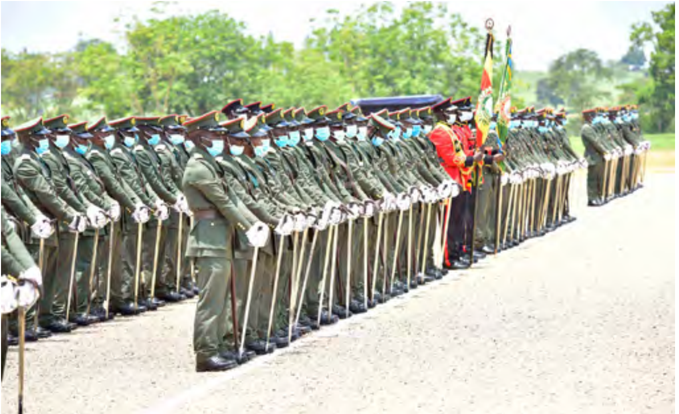
UPDF officers mounting a parade during the pass out ceremony at Uganda Military Academy, Kabamba, Mubende District

the Government to pay officers from the rank of Brigadier upwards well. He added that officers from the rank of Major to Colonel would be given a 50% increment. He revealed that the privates would soon earn between Shs1 million and Shs1.5 million. Gen. Museveni said he was pleased to commission the cadets into service in the UPDF. He was impressed with the Bachelors Degree of Defence Studies. He commended the Makerere lecturers for the job well done.