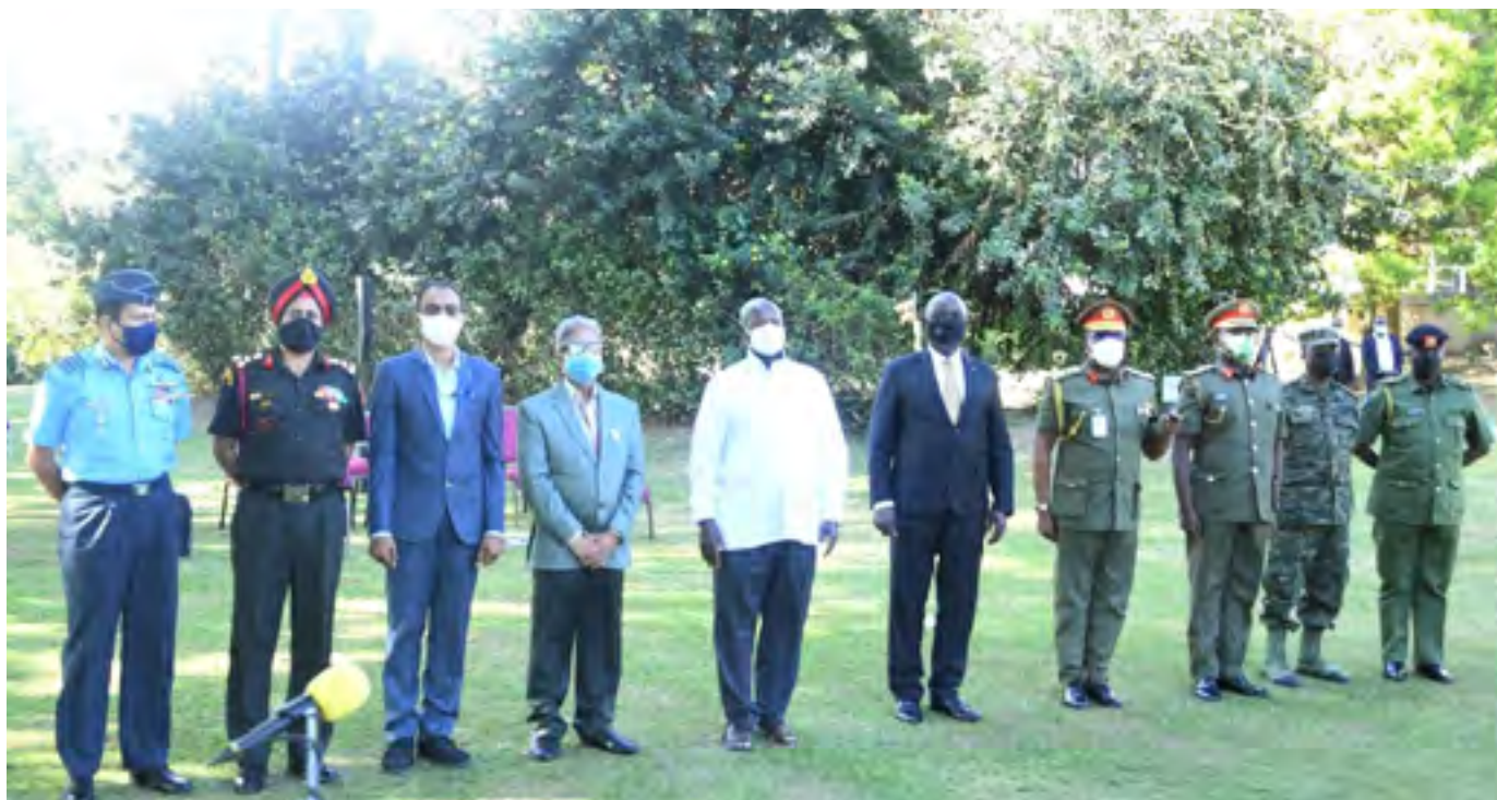
President Museveni poses for a photo with the Indian and Ugandan officials after the meeting at State House, Entebbe

Up to 130 acres of land have been allocated