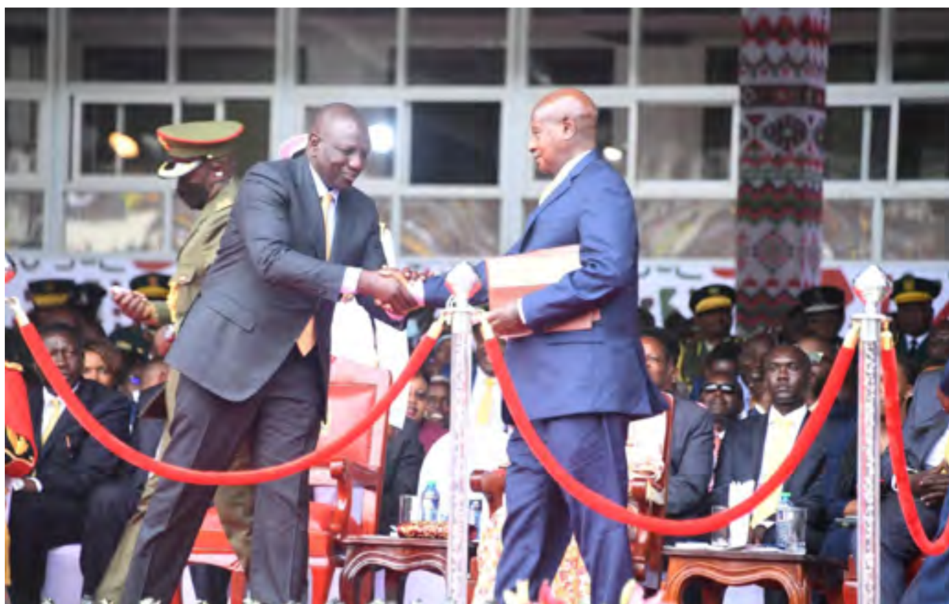
President Ruto and President Museveni shake hands during the inauguration ceremony at Kasarani, Nairobi County

Others were; H.E. Évariste Ndayishimiye of Burundi, H.E. Hassan Sheikh Mohamud of Somalia, and the Chairperson of the African Union Commission (AUC) and former Chadian Minister of Foreign Affairs, H.E. Moussa Faki Mahamat, among others.