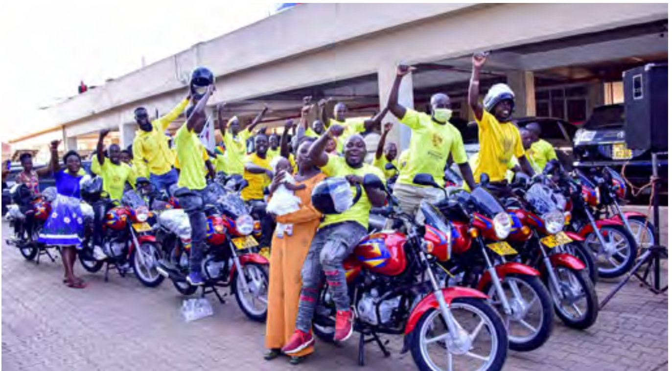
Boda boda riders standing on their newly acquired motorcycles