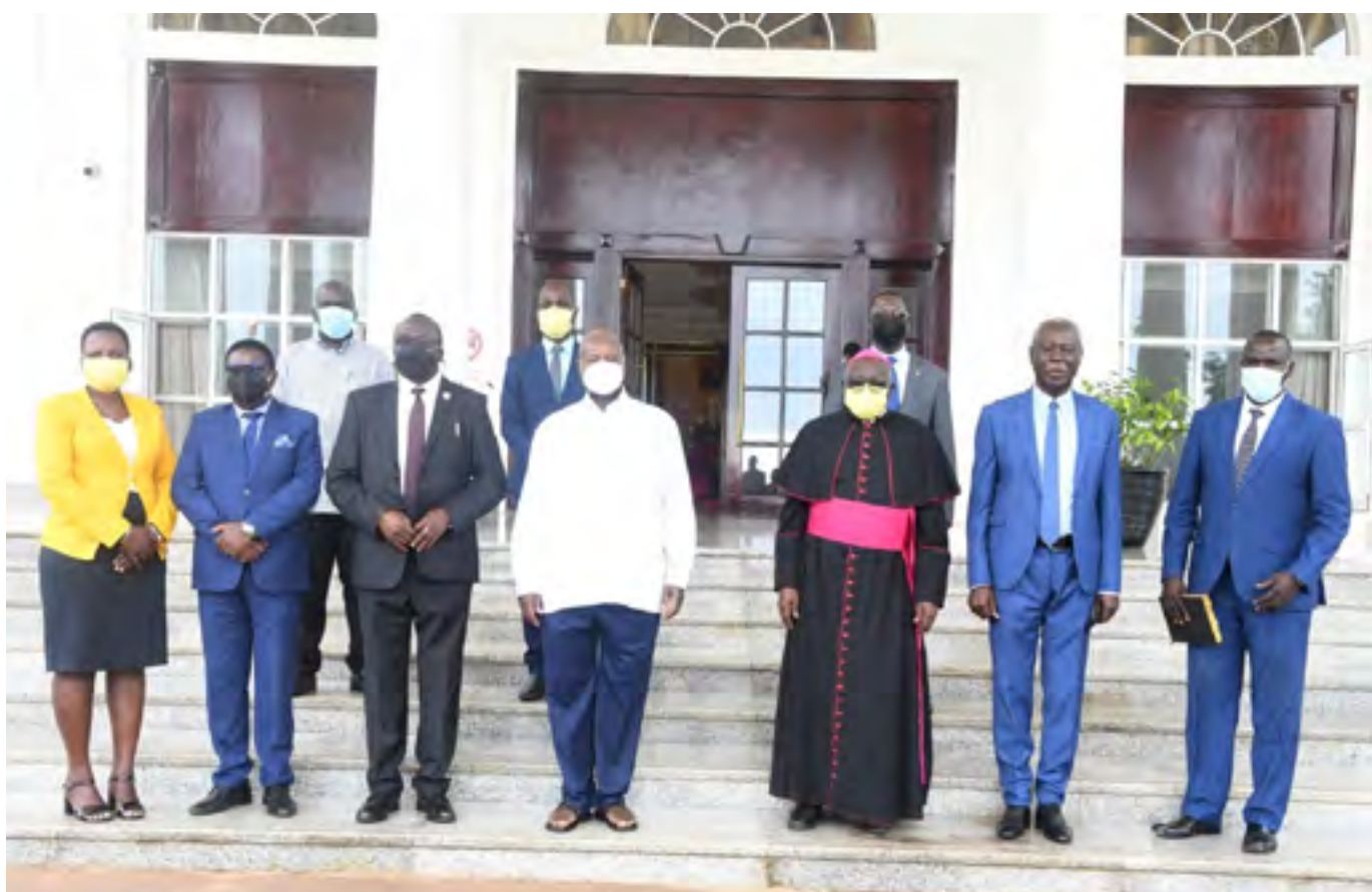
President Museveni poses for a photo with the delegation organising the beatification ceremony after a meeting at State House, Entebbe