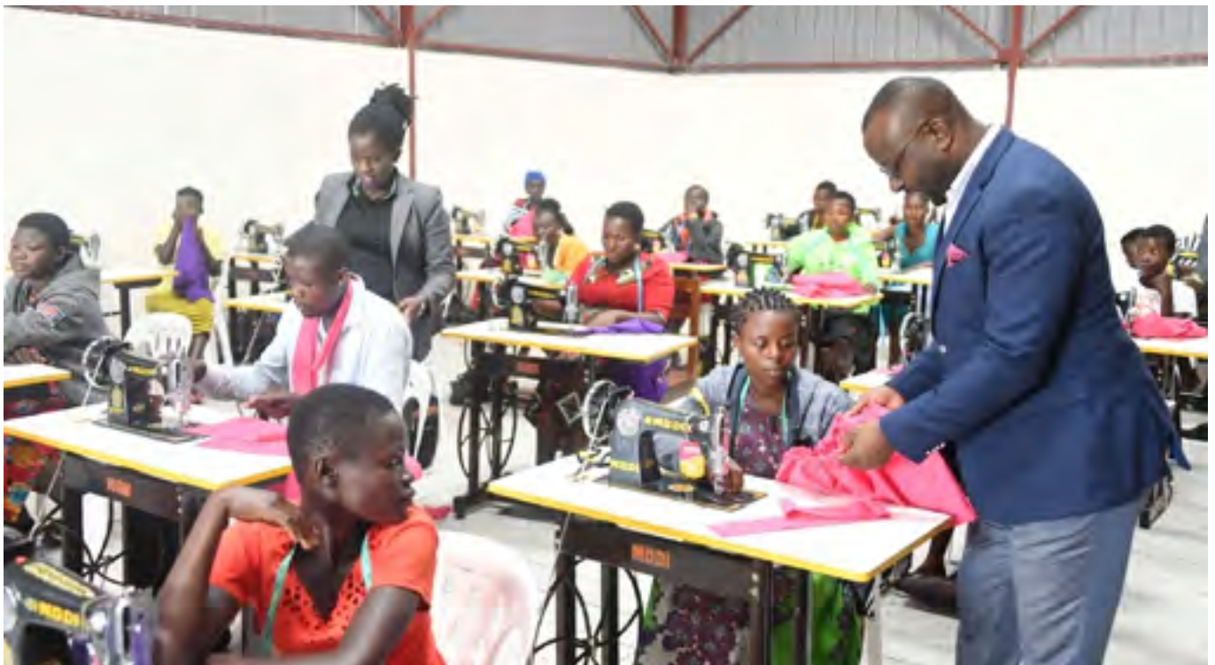
Learners at the Mbale Industrial Hub during a tailoring session