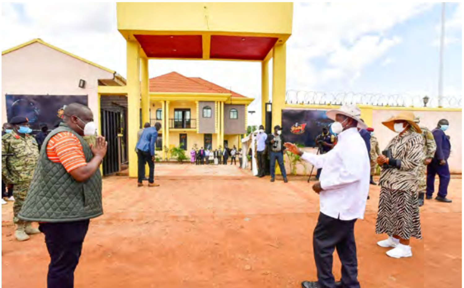
President Museveni and First Lady, Janet Museveni, greet the proprietor of Radio Seven, ahead of commissioning the radio in Masindi District