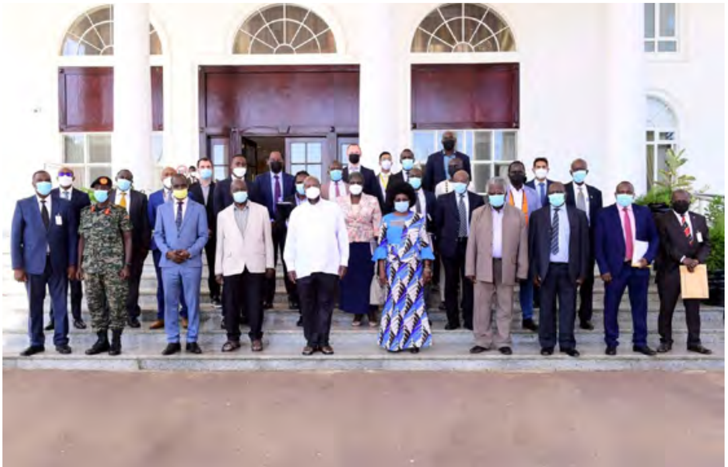
President Museveni poses for a photo with public and private players in the e-mobility sector after a meeting at State House, Entebbe

President Museveni highly commended the group for their efforts in fabricating and manufacturing vehicles and pikipikis here in the country. He noted that this will not only promote the use of clean energy and stop pollution