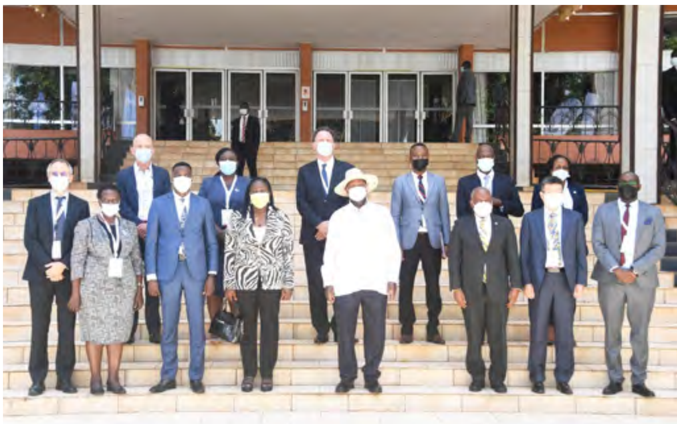
President Museveni poses for a photo with leaders in the Oil and Gas Sector during the Summit at Kampala Serena Hotel

The President also assured the country that electricity tariffs will continue to go down to spur economic growth through industrialisation. “The Government power must be preferably 5 cents per unit or not more than 8.16