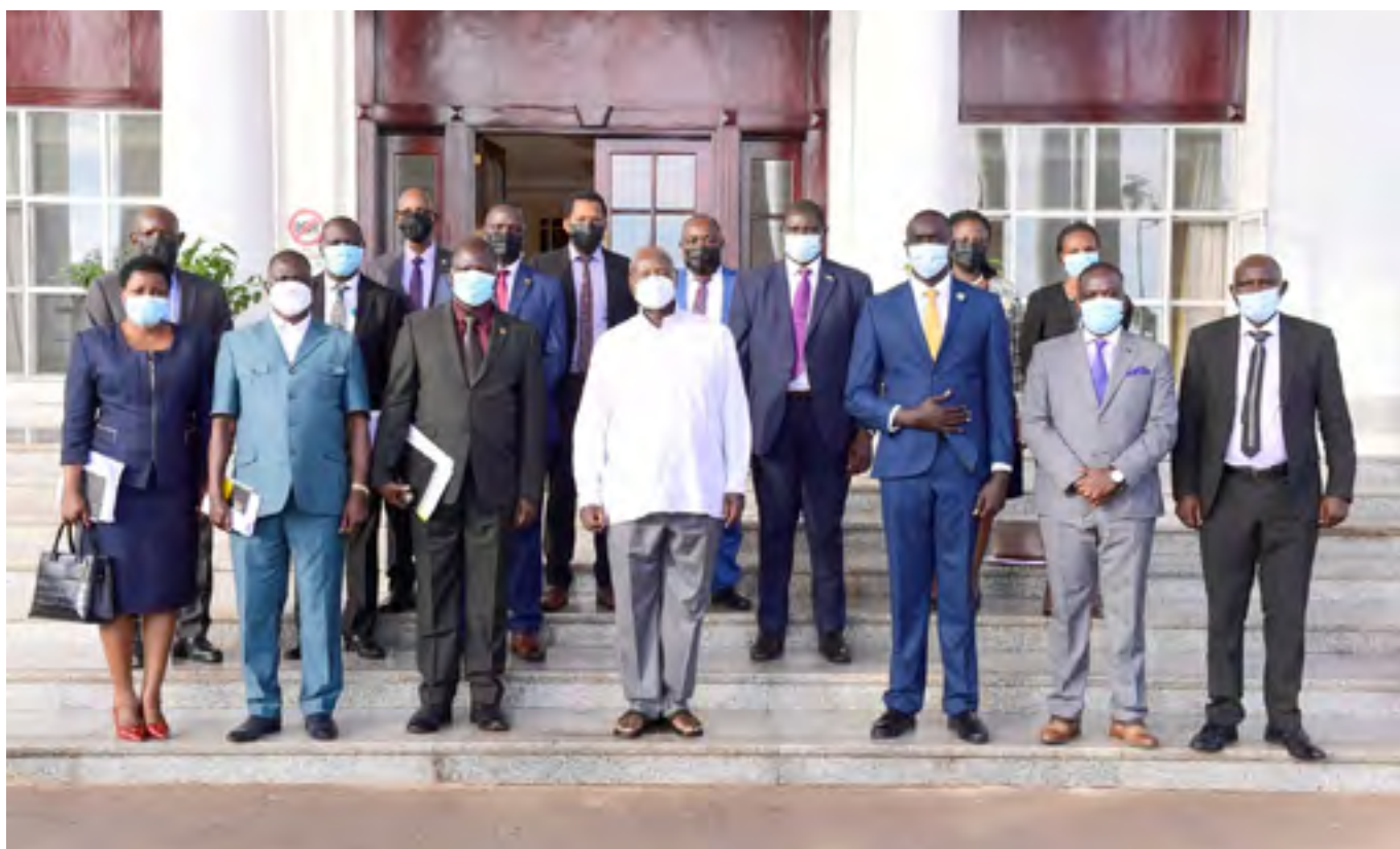
President Museveni poses for a photo with some of the new envoys to Uganda at State House, Entebbe