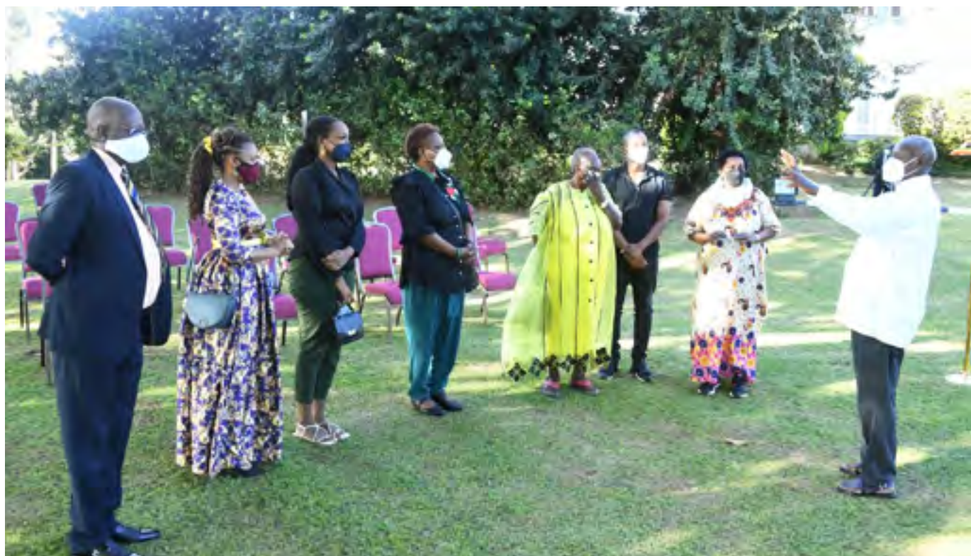
President Museveni gestures to the Ben Kiwanuka family during the meeting at State House, Entebbe

It is now 50 years ever since Kiwanuka was murdered during President Amin’s regime on September 21, 1972, after he was abducted from his chambers at the High Court in Kampala. The whereabouts of his remains is still a mystery.