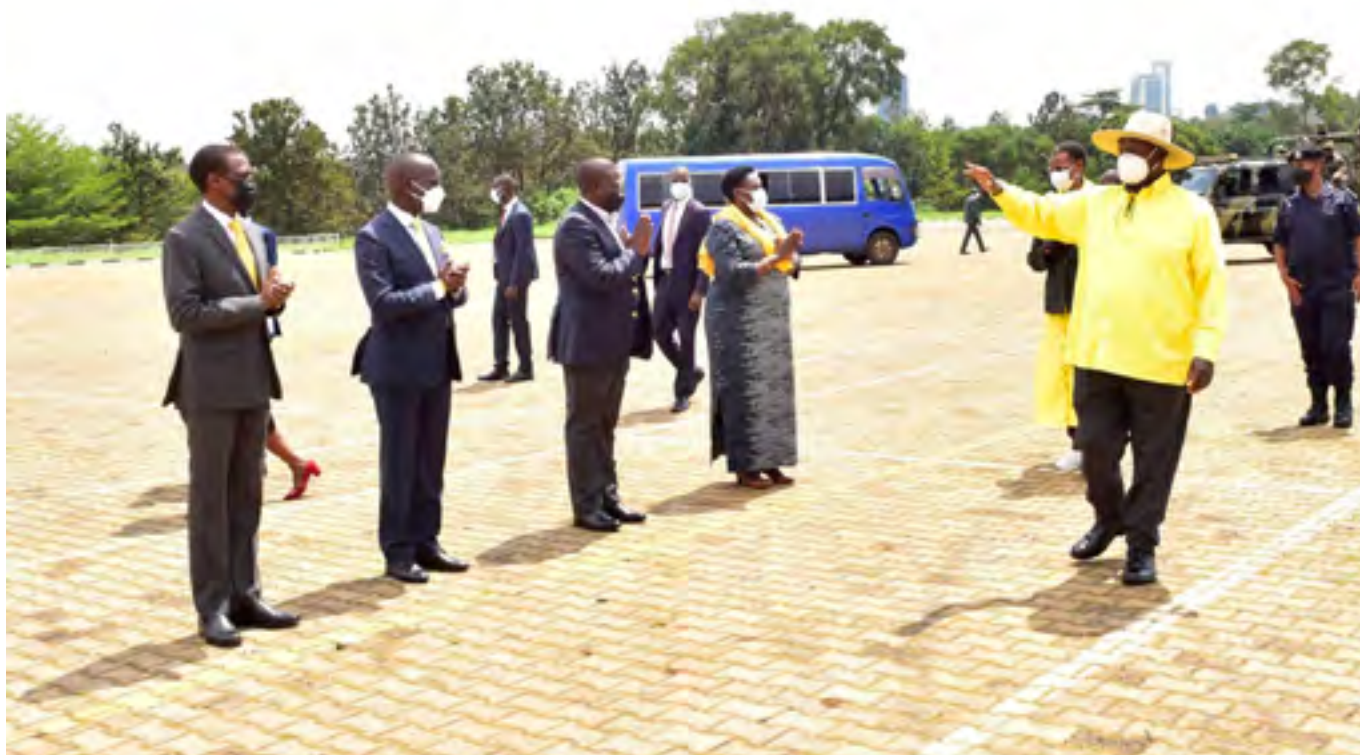
President Museveni is received by NRM Party Leaders for the party caucus meeting at Kololo Ceremonial Grounds

The President said that the other reason was the cohesion shown by the six members during their concluding tenure.