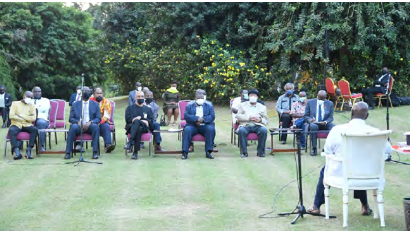
President Museveni meeting the Pan-African Movement Delegation at State House, Entebbe

“If you want to have a modern life, you must have a more active trade. Therefore, you need Uganda, East Africa and Africa. What will help you to widen the market