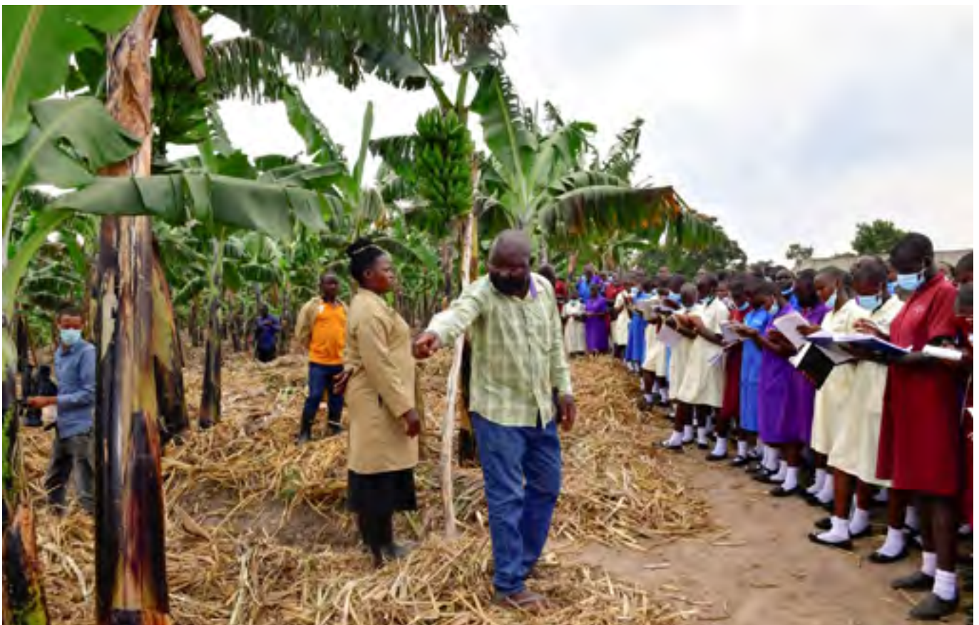
Students of Tororo Girls School take notes during the visit of Kawumu Presidential Farm in Luwero District

Among the many enterprises at the farm which the students visited were a fish farm; a greenhouse with a nursery bed, a tomato