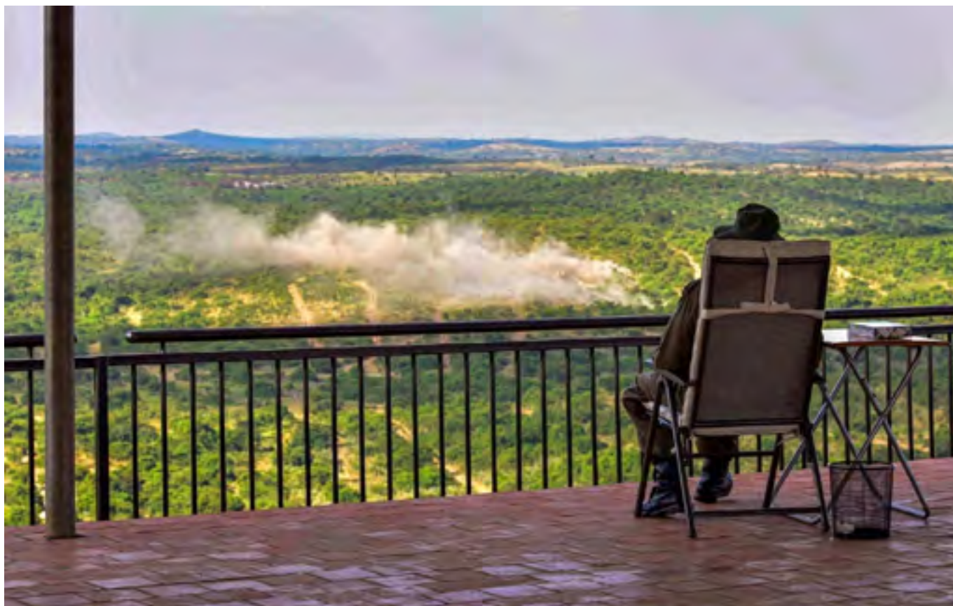
President Museveni watches drills during the pass out ceremony at Karama in Mubende District