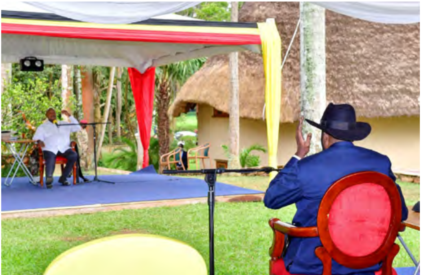
President Museveni and President Kiir in a meeting at Speke Resort, Munyonyo

The meeting was attended by Uganda's Minister of State for International Affairs, Hon. Henry Okello Oryem.