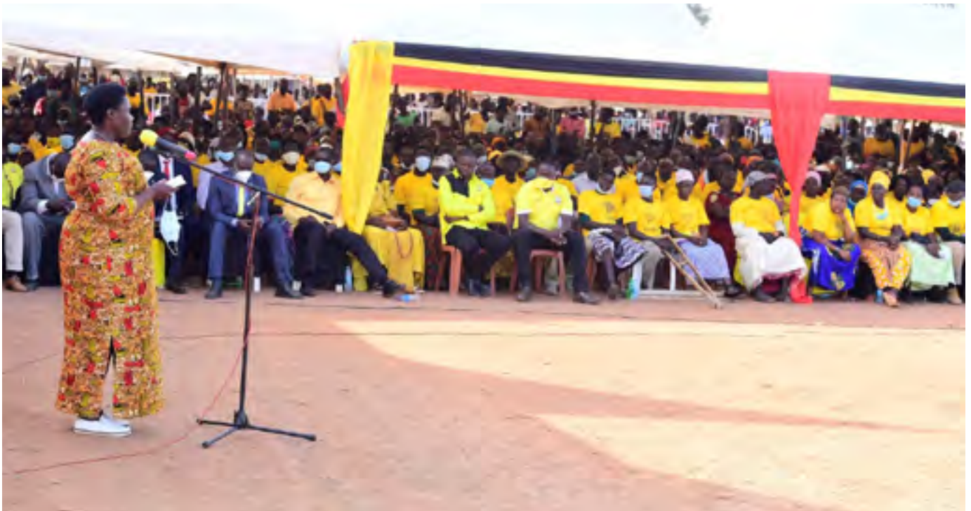
Vice President, H.E. Jessica Alupo, addresses the delegates at St. Kizito Technical School in Soroti City

The Soroti City East Constituency seat fell vacant following the