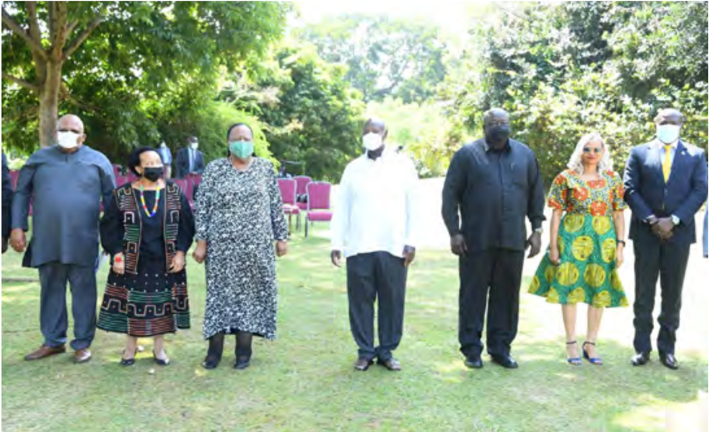
President Museveni poses for a photo with the South African Delegation during the meeting at State House, Entebbe

Uganda and South Africa. We are looking at visa waiver to increase tourism and trade between our countries. We agreed with the Minister, that we need to do more, and in Uganda We have agreed to do more in agriculture especially in agro-processing,” she said.