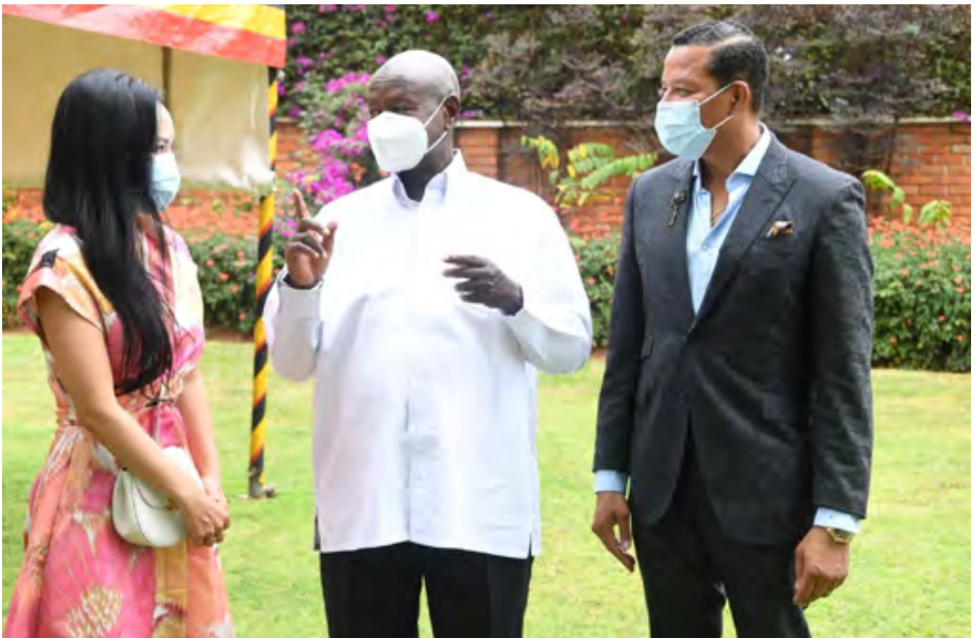
President Museveni chats with Actor Terrence Howard and his wife during the meeting at State Lodge, Nakasero

Mr. Terrence, who was also looking for investment opportunities in the fields of