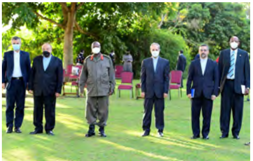
President Museveni poses for a photo with the Iranian delegation at State House, Entebbe