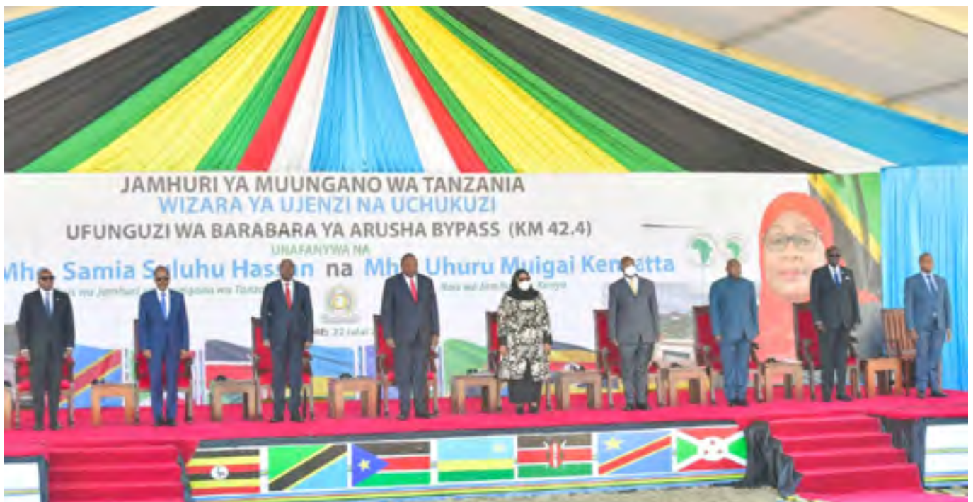
Heads of State of the EAC pose for a photo during the commissioning ceremony of the Arusha bypass in Arusha, Tanzania

Arusha bypass forms part of the 15,000km East African Road Network and the Trans African Highway from Cape Town to Cairo through Gaborone. The road starts at Ngaramtoni and crosses Dodoma road at Kisongo.