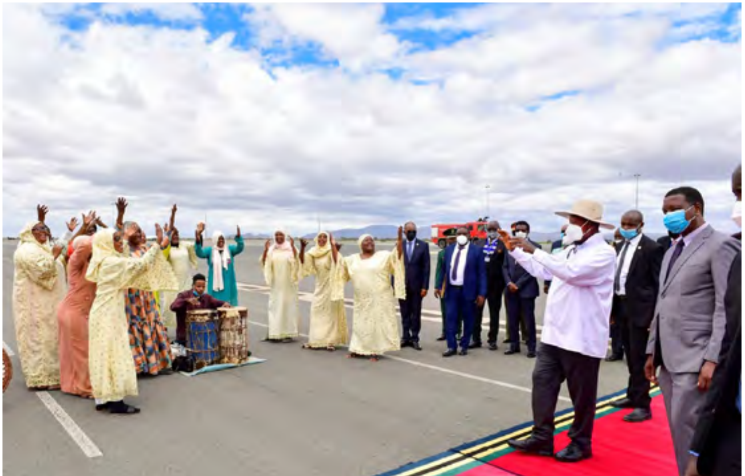
President Museveni is greeted by traditional performers at Kilimanjaro International Airport in Tanzania

The President said the push for integration