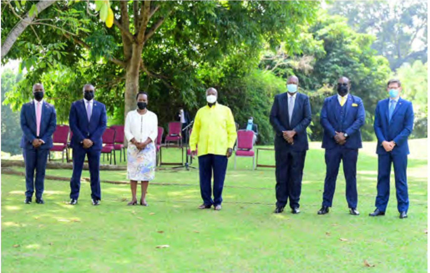
President Museveni poses for a photo with the ABSA Group delegation at State House, Entebbe