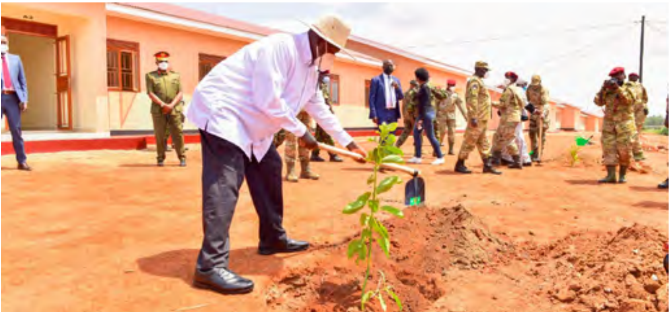
President Museveni plants a tree during the commissioning ceremony of the SFC Housing estate at Lunyo, Entebbe

The President said he was glad that the UPDF accepted the advice he gave them to use direct labour which is cheap, like the SFC Engineering Unit undertaking construction of the housing units.