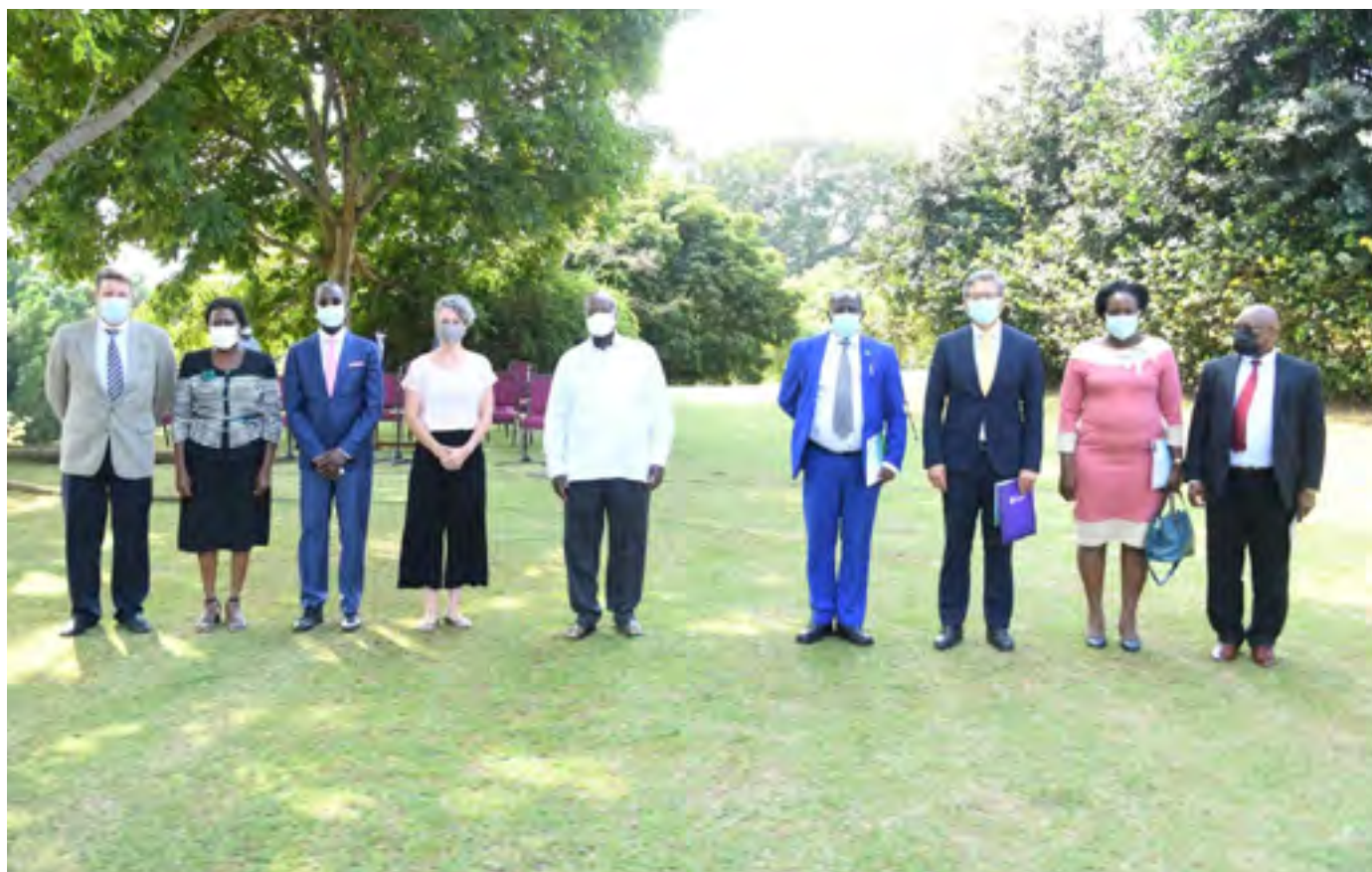
President Museveni poses for a photo with the teams from Joint Clinical Research Centre and Western University of Canada at State House, Entebbe