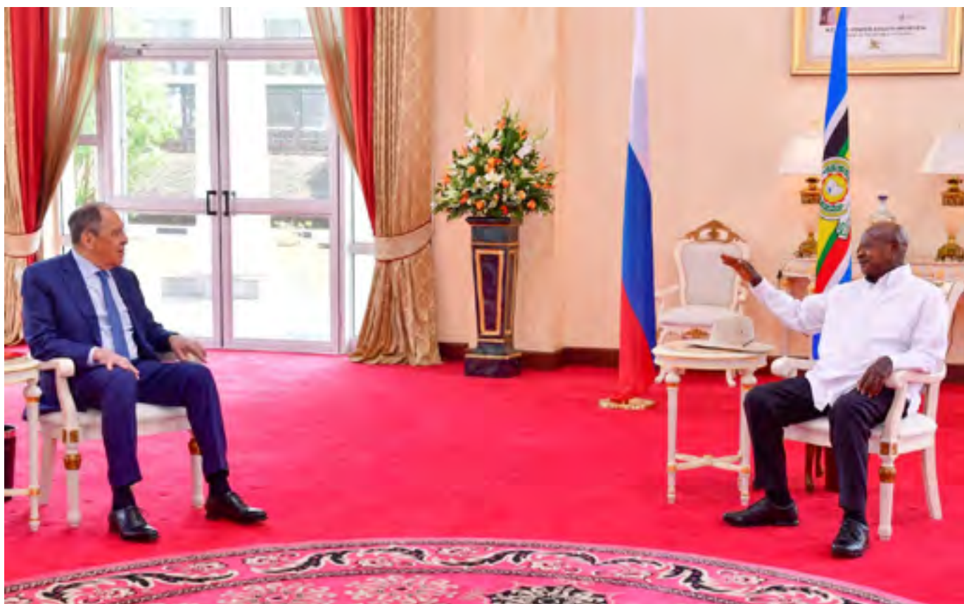
President Museveni gestures to H.E. Sergey Lavrov during the meeting at State House, Entebbe

The meeting was attended by Uganda’s Foreign Affairs Minister Jeje Odongo, State Minister Okello-Oryem and Minister of Defence and Veteran Affairs Vincent Bamulangaki Ssempijja among others.