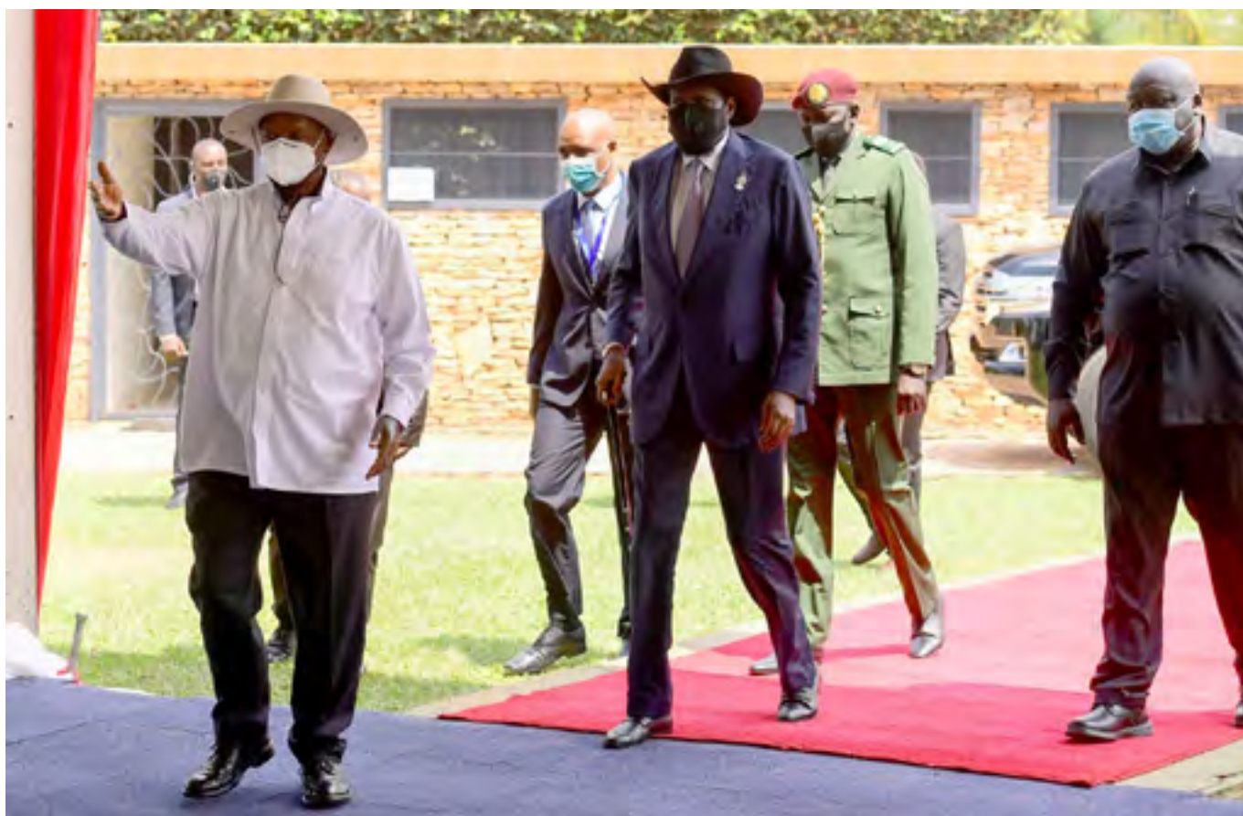
President Museveni and President Salva Kiir Mayardit of South Sudan arrive at Munyonyo for the conference

The President again advised farmers to stop growing rice in swamps since the economic activity causes a negative impact on the environment.