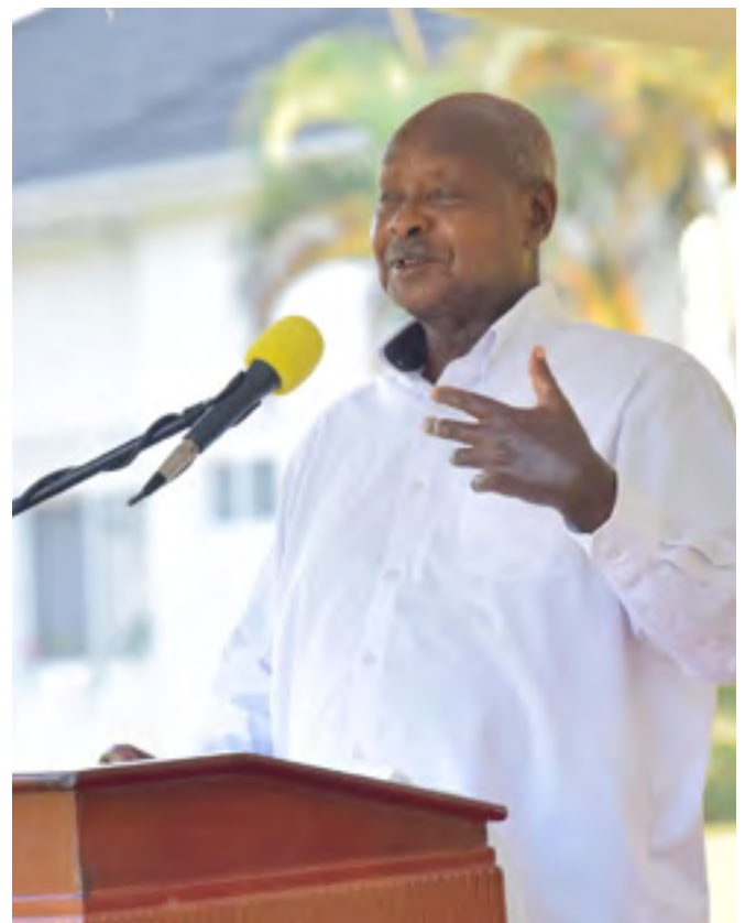
President Museveni speaks during the meeting with the CEOs at Irenga in Ntungamo District