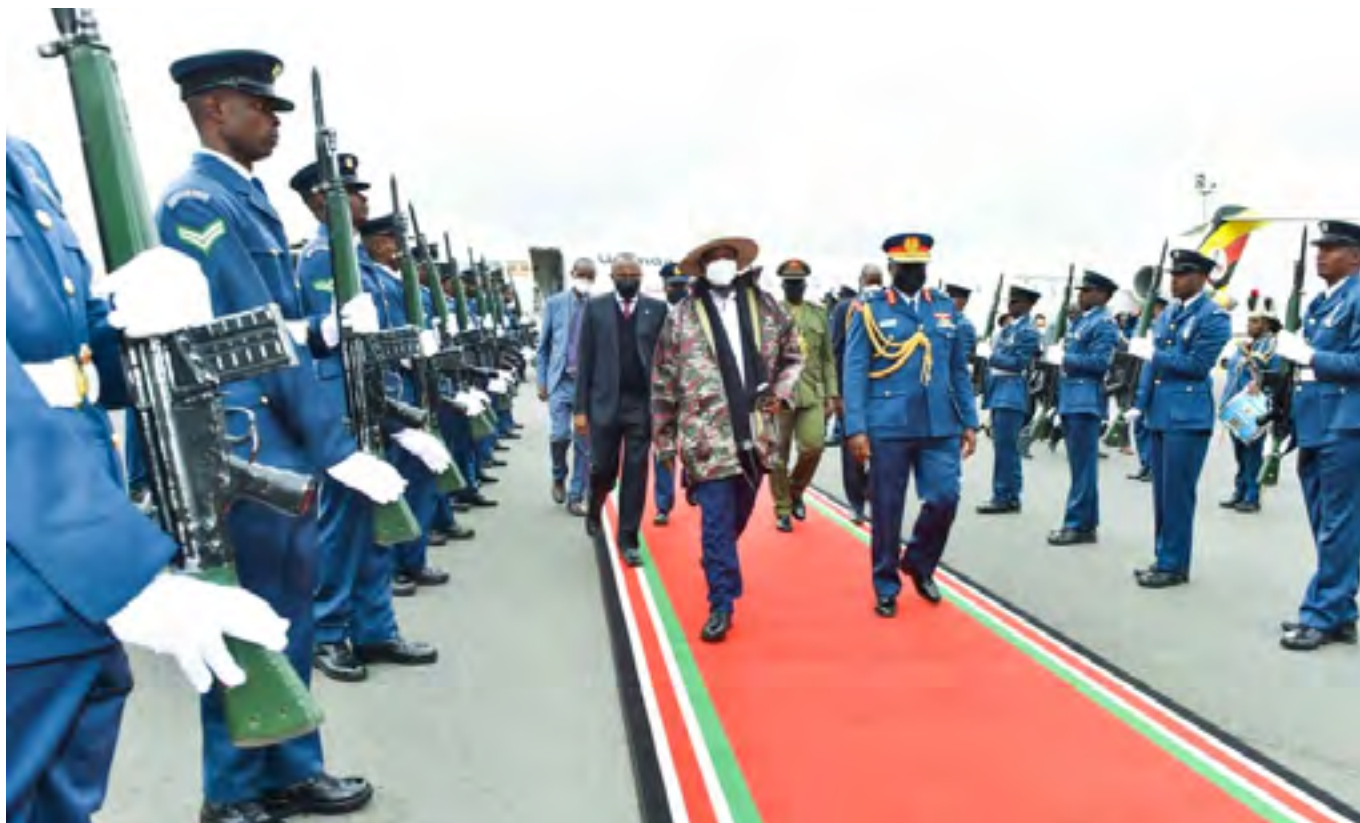
President Museveni receives a gun salute upon arrival at Jomo Kenyatta International Airport in Kenya