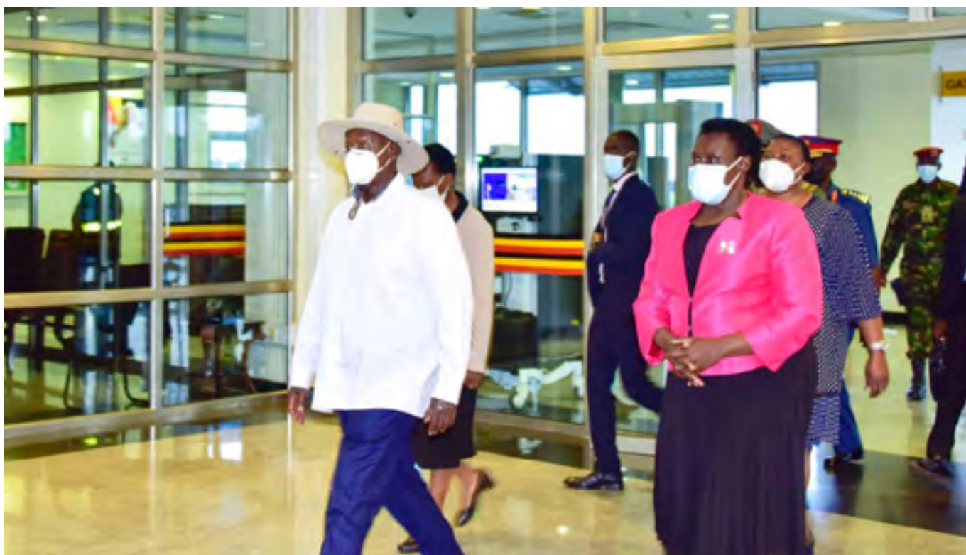
President Museveni is received by the Vice President, H.E. Jessica Alupo, at Entebbe International Airport, upon return from Nairobi, Kenya