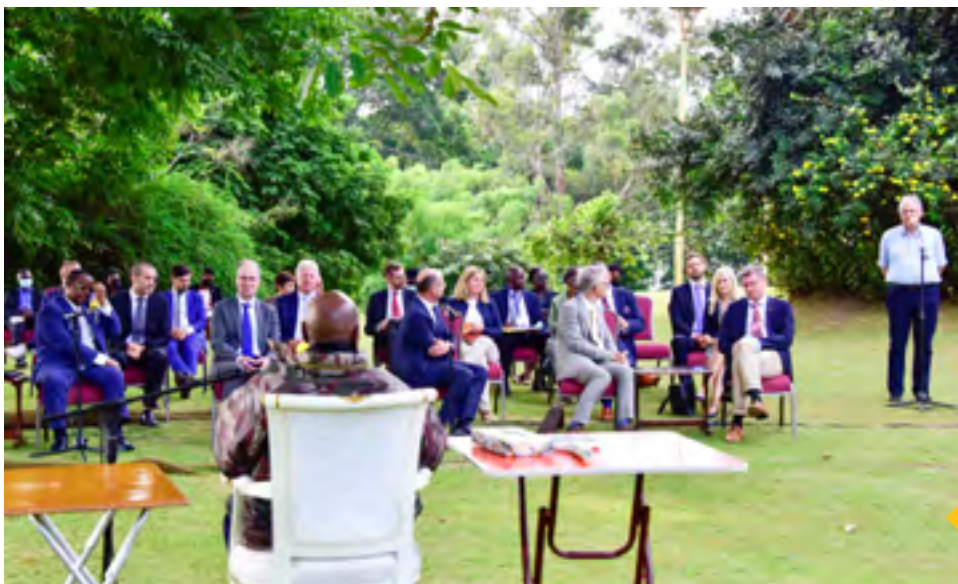
President Museveni meeting the German Investors at State House, Entebbe

The President further asked the German entrepreneurs to co-invest with Uganda in the area of processing bananas for food.