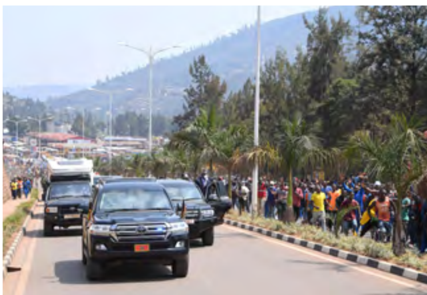
Residents of Kigali wave at the convoy of President Museveni upon arrival in Kigali, Rwanda

Commonwealth Heads of Government Meeting 2022 took place in Kigali, Rwanda. The official opening of CHOGM took place on Friday 24th June and was followed by the main high-level meetings of Heads of Government on Friday 24th to Saturday 25th June. They were preceded by four forums, ministerial meetings, side events and other activities.