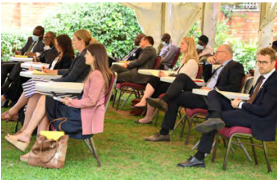
Members of the Danish delegation during the meeting at State Lodge, Nakasero

The President said he would formally communicate the position to the relevant Government departments.