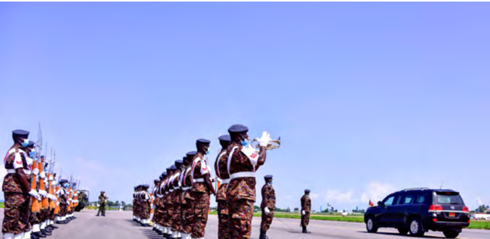
President Museveni arrives at Entebbe Air force Base for the meeting

The Commander-in-Chief made the remarks this afternoon while meeting a contingent of Men and Officers of the Uganda Air Force Wing at Entebbe Air Base that recently participated in Operation