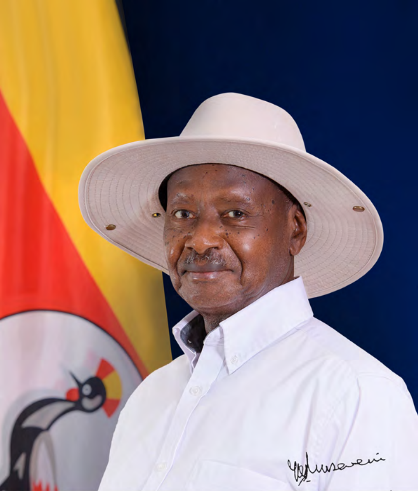
H.E. GEN. YOWERI KAGUTA MUSEVENI PRESIDENT OF THE REPUBLIC OF UGANDA