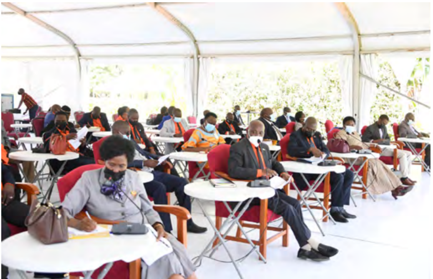
UNATU leaders meeting President Museveni at State House, Entebbe