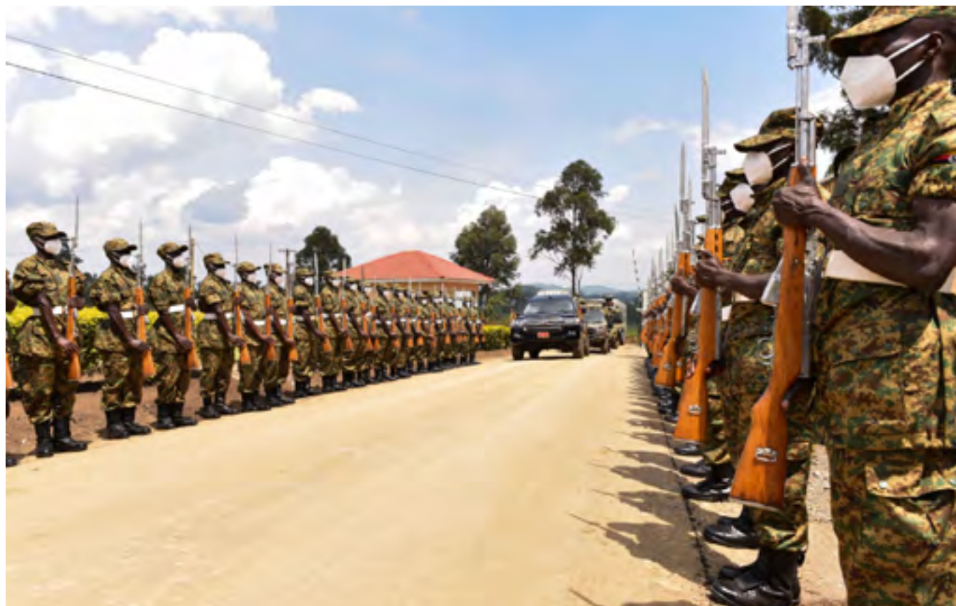
President Museveni arrives at Muhoti Barracks for the meeting the UPDF Mountain Brigade

He was pleased to note that the rebel group was defeated in the triangle of death in Eastern Congo and reported that there was a tremendous reduction of killing and abducting civilians in the UPDF operation areas.