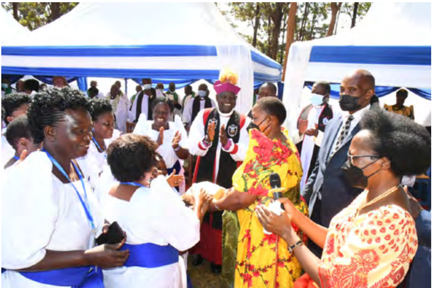
The Minister for the Presidency, Hon. Milly Babalanda, hands over the contribution from President Museveni to the leaders of Busoga Diocese

"Your messages provide the relevance of God's word but, significantly, they also ask the people to develop their social