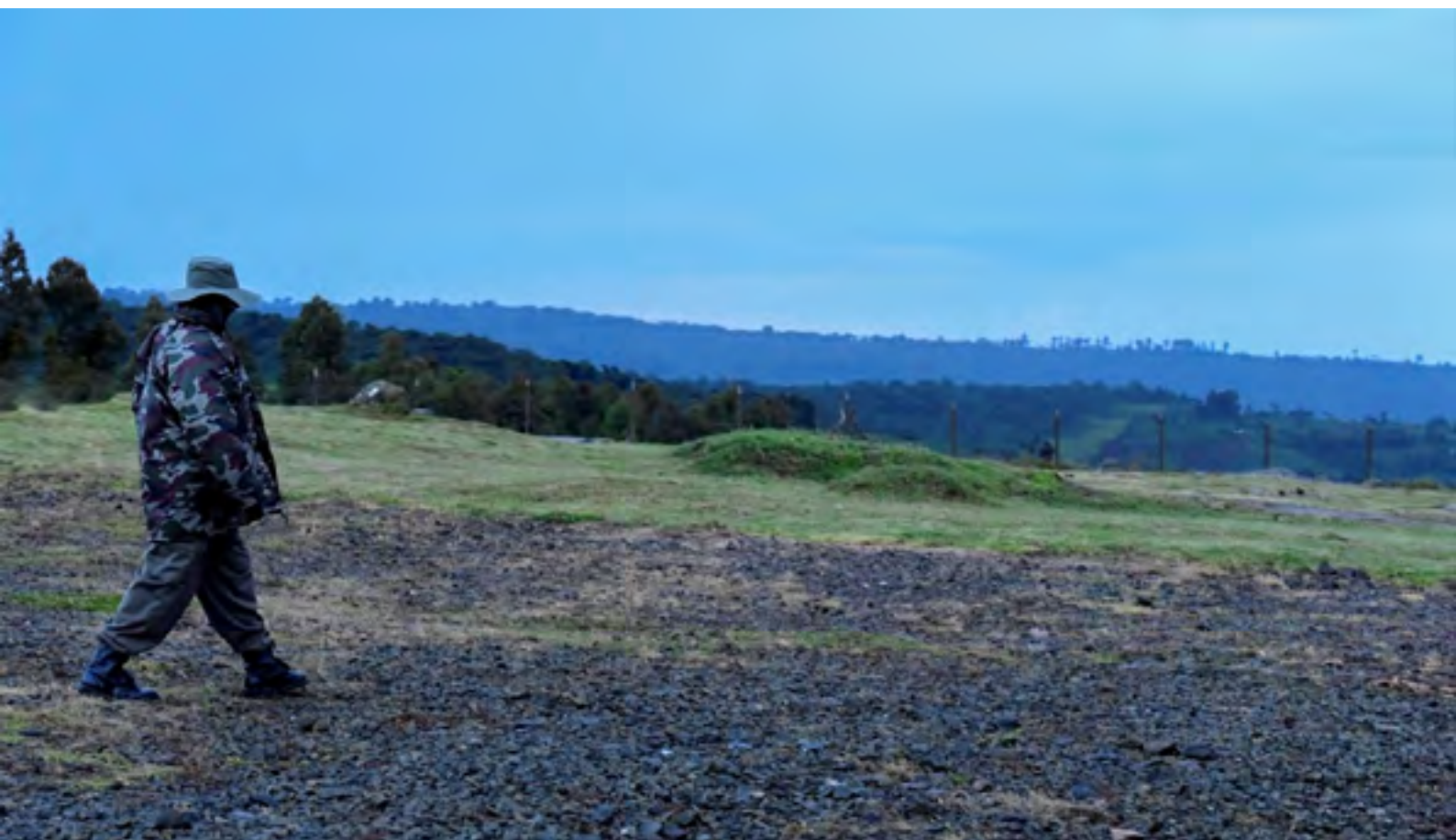
President Museveni arrives for a meeting with Security Chiefs at State Lodge, Kapchorwa

The Vice President, Major (Rtd) Jessica Alupo Epel, who hails from Teso region, hailed the disarmament process but called for more vigilance along the borders to prevent gun-wielding rustlers.