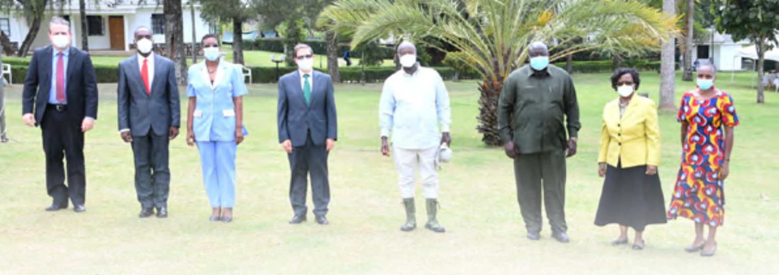
President Museveni with Cuban Minister for Foreign Affairs, Hon. Bruno Rodriguez, and other officials in Ntungamo