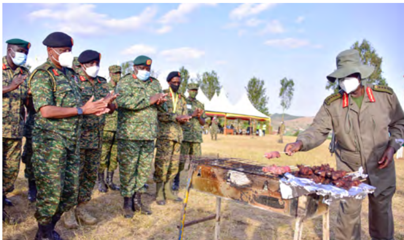
President Museveni leads soldiers to a bull-roasting session at Makenke Barracks, Mbarara City

Thereafter, President Museveni led soldiers to a bull-roasting session.