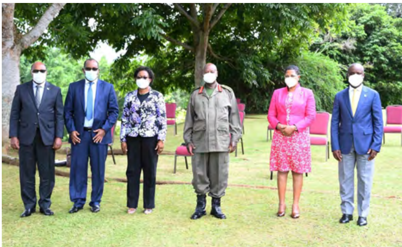
President Museveni poses for a photo with Rt. Hon. Edda Mukabagwisa, Deputy Speaker of the Parliament of the Republic of Rwanda, after a meeting at State House, Entebbe

President Museveni expressed his gratitude, on behalf of Ugandans, to the two visiting Speakers for honouring the occasion at which he presented the “State of the Nation Address” that took place on 7th June, 2022, at Kololo Ceremonial Grounds in Kampala.