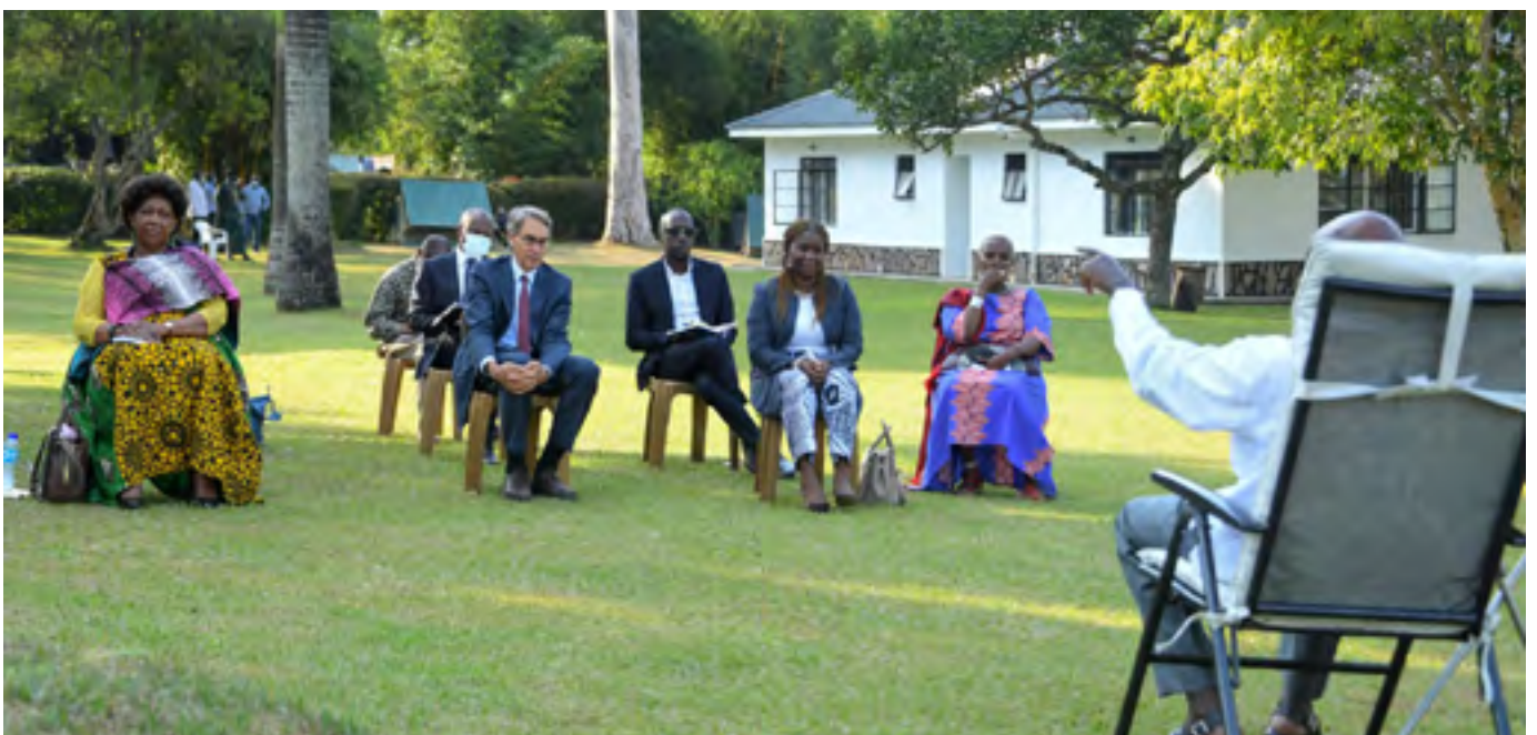
President Museveni gestures during a meeting with Human Rights Watch CEO, Mr. Ken Roth, at Ntungamo

He explained to the officials that the Government will also battle unnecessary acts by security institutions like the police force of beating, illegally detaining and