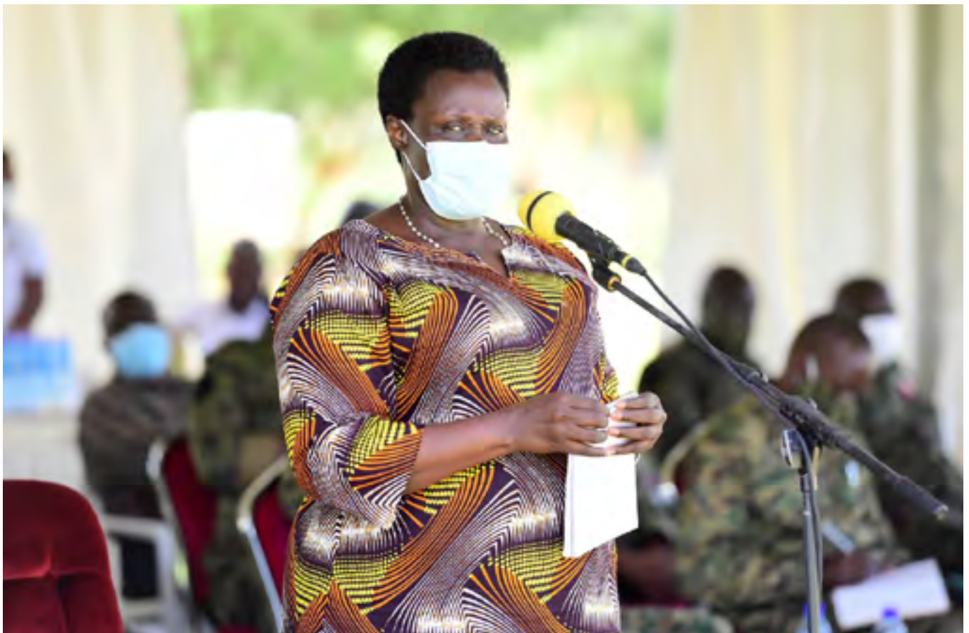
Vice President, H.E. Jessica Alupo, addresses the security meeting at Morulinga State Lodge, Napak District

“Your Excellency, there is an on-going covert campaign by some leaders across the sub-region, targeting kraal-based informers by urging them not to cooperate with security forces in disarmament operations. They accuse kraal-based informers of betraying their people. A gun trafficker in our custody who has been