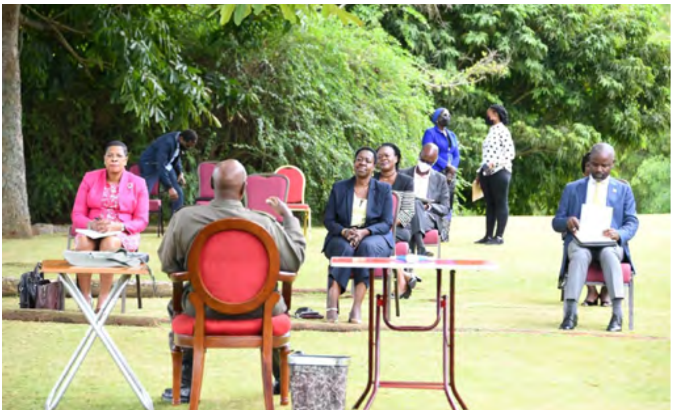
President Museveni in a meeting with Rt. Hon. Jemma Nunu Kemba, Speaker of the Parliament of the Republic of South Sudan

On his part, Rt. Hon. Kemba assured the President that South Sudan is at peace.