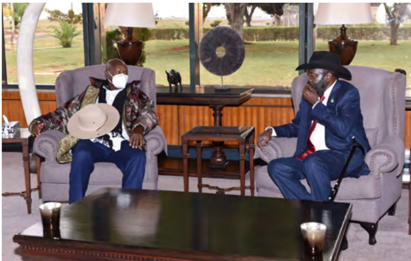
President Museveni with the President of the Republic of South Sudan, H.E. Salva Kiir Mayardit, at Jomo Kenyatta International Airport VVIP Lounge

ENTEBBE INTERNATIONAL AIRPORT: His Excellency the President of the Republic of Uganda left for Nairobi, Kenya on a one-day official visit where he joined other East African Heads of State to discuss Regional issues and matters connected to security.