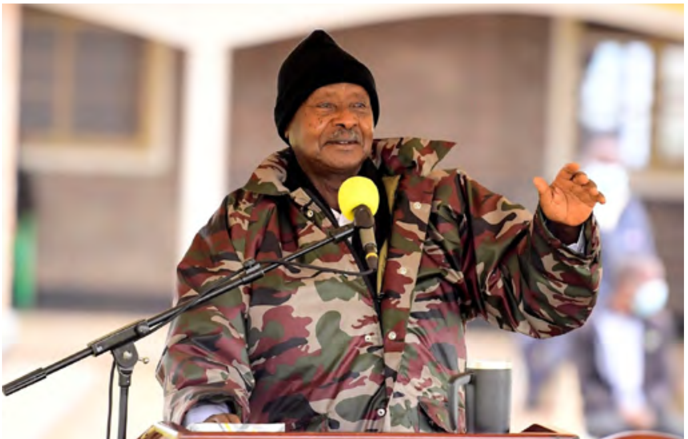
President Museveni addresses a meeting of political leaders at State Lodge, Kapchorwa

While meeting political leaders and security personnel from the Sebei, Bugisu and Teso sub-regions at Kapchorwa State Lodge in Kapchorwa district in Sebei sub region, President Museveni learnt that during the insurgency in north-eastern Uganda nearly 20 years ago, parts of Bugisu and Sebei, also lost cattle and need to be compensated.