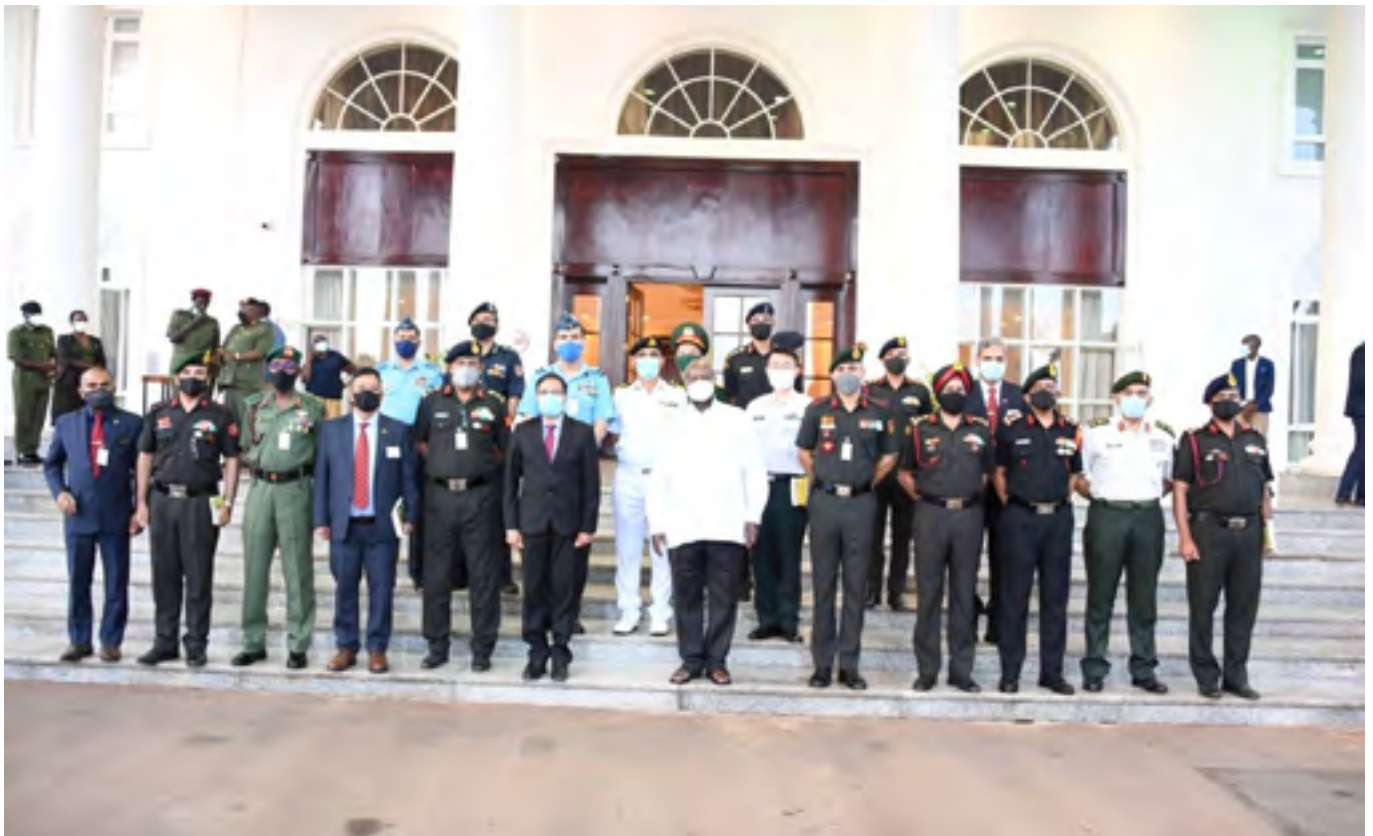
President Museveni poses for a photo with officers from New Delhi National Defence College, at State House, Entebbe

President Museveni noted that the second principle of the NRM is to promote Pan Africanism. He called on the African population to always think of Africa as a united continent.