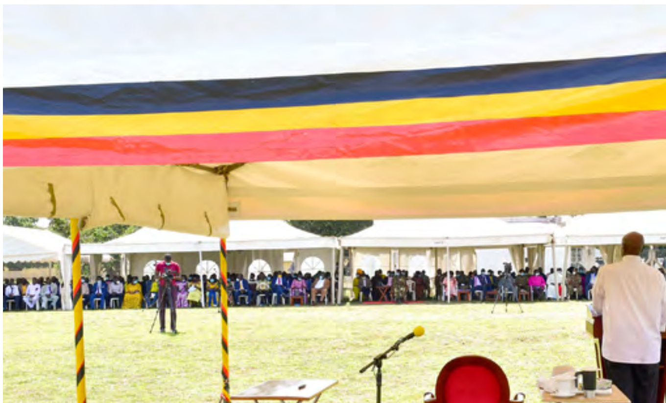
President Museveni addresses Acholi and Langi leaders at Baralege State Lodge, Otuke District

possession of fire arms, bows and arrows, sticks for driving the animals or those suspected to be involved in cattle rustling. He said the use of police canines would also be intensified.