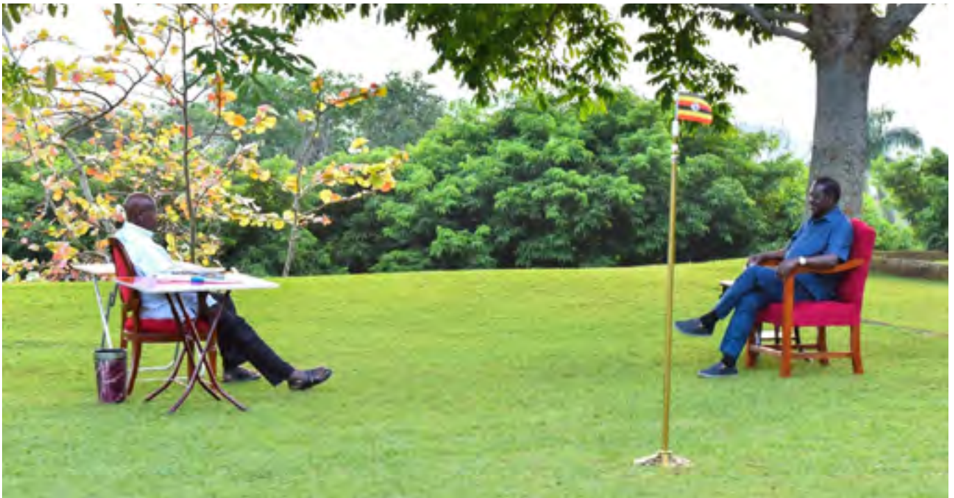
President Museveni holding talks with Kenyan Opposition Leader Raila Odinga

Raila Odinga last visited Uganda in September 2019 and paid President Museveni a courtesy call during which they discussed socio-economic and political developments in their respective countries.