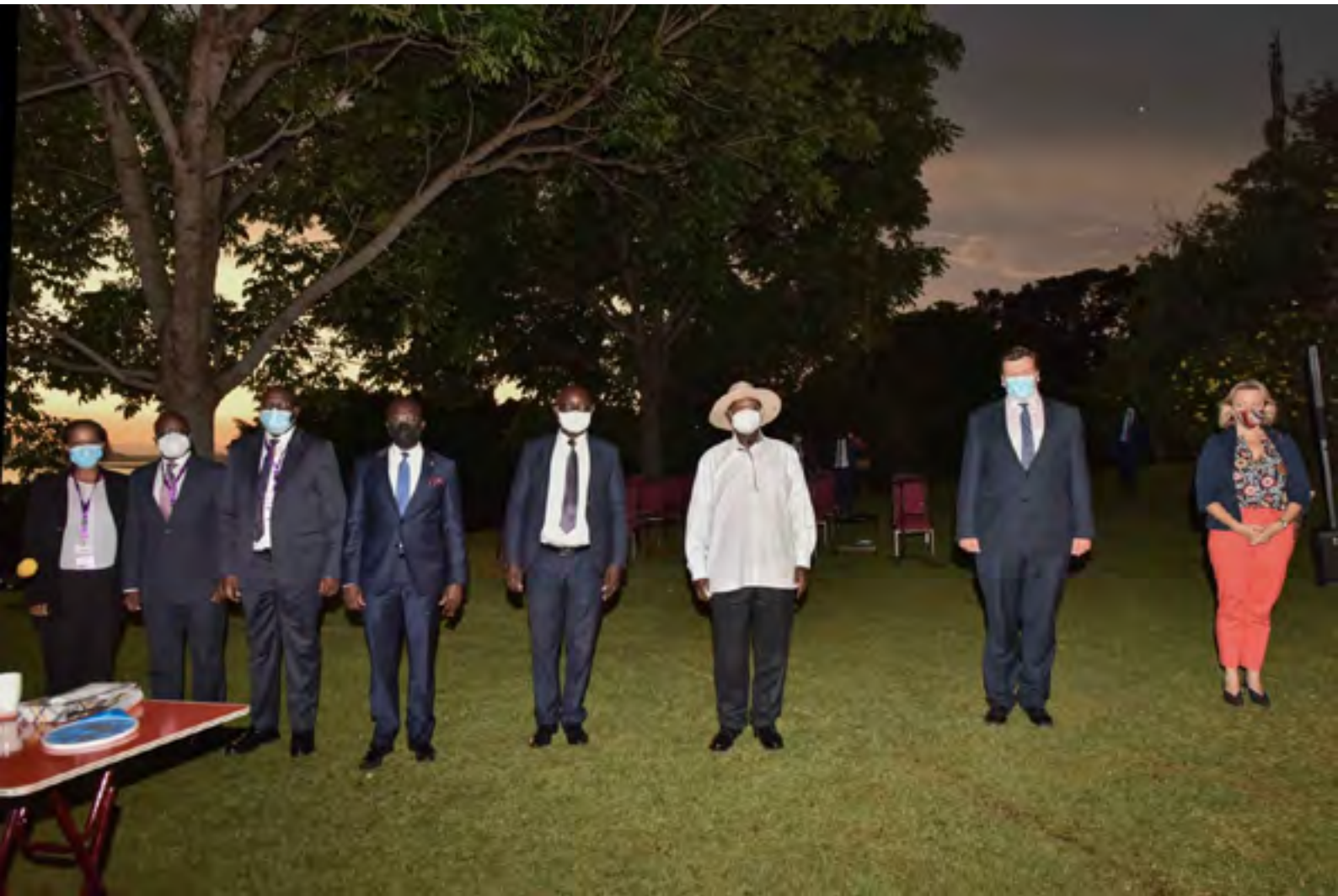
President Museveni poses for a photo with the UK Minister for the Armed Forces and Ugandan and UK Government officials

STATE HOUSE, ENTEBBE: President Yoweri Kaguta Museveni met Mr. James Stephen Heappey the United Kingdom Parliamentary Under Secretary of State (Minister for the Armed Forces). Minister Heappey is responsible for armed forces activity including operations, operational legal matters, force generation and international defence engagement.