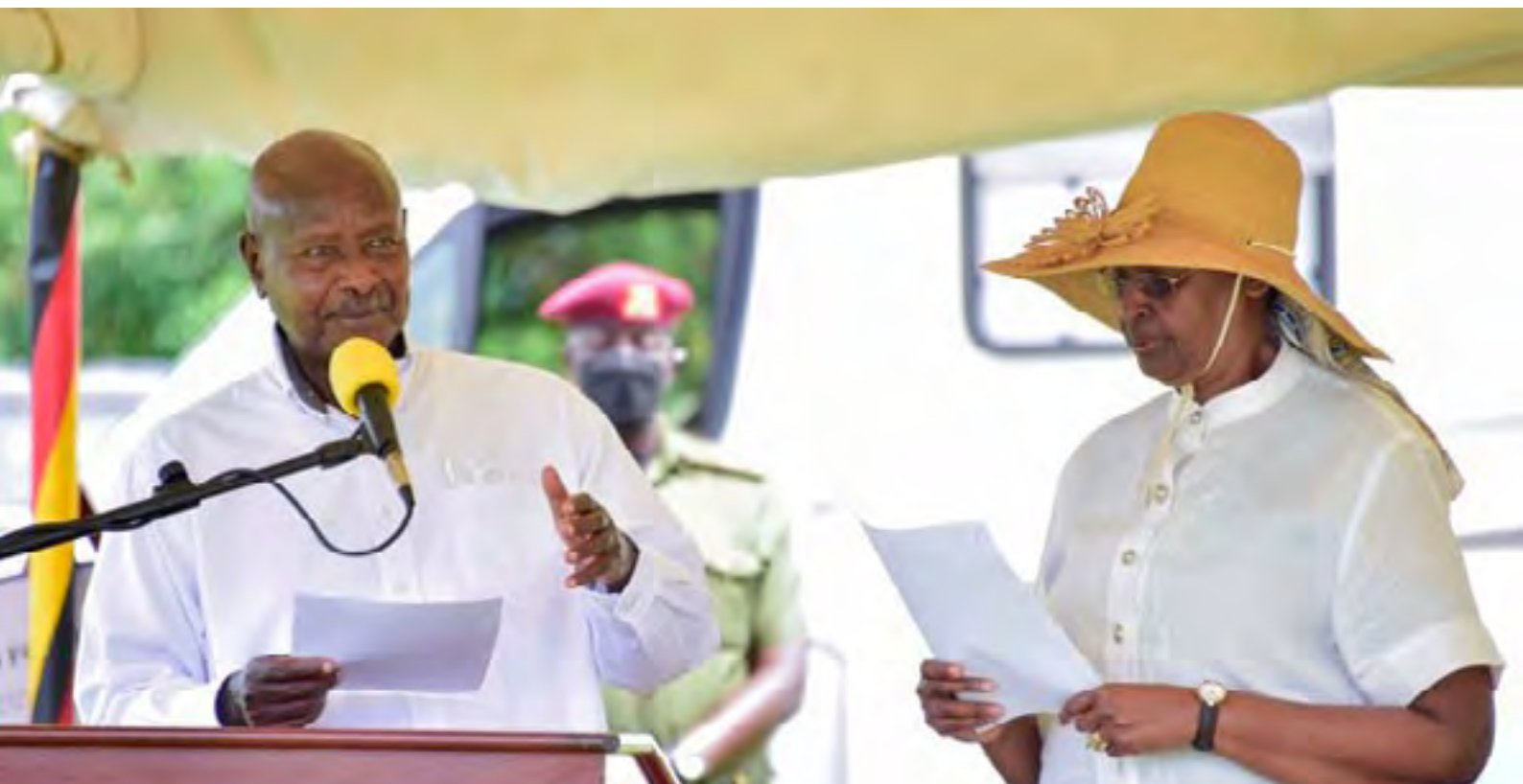
President Museveni flanked by First Lady Janet Museveni speaks in Luwero

“Even when development has surged through the rest of the country, it has been a slow and painful journey here. That is why I am very thankful to God because he always has his appointed time. I believe this is his appointed time to visit Luwero in a special way. It is only God who can bring the spiritual healing and restoration to the hearts and minds of people so that they can move on with their lives. We as people can partner with God through repentance, a spirit of brokenness and forgiveness towards others,” she said.