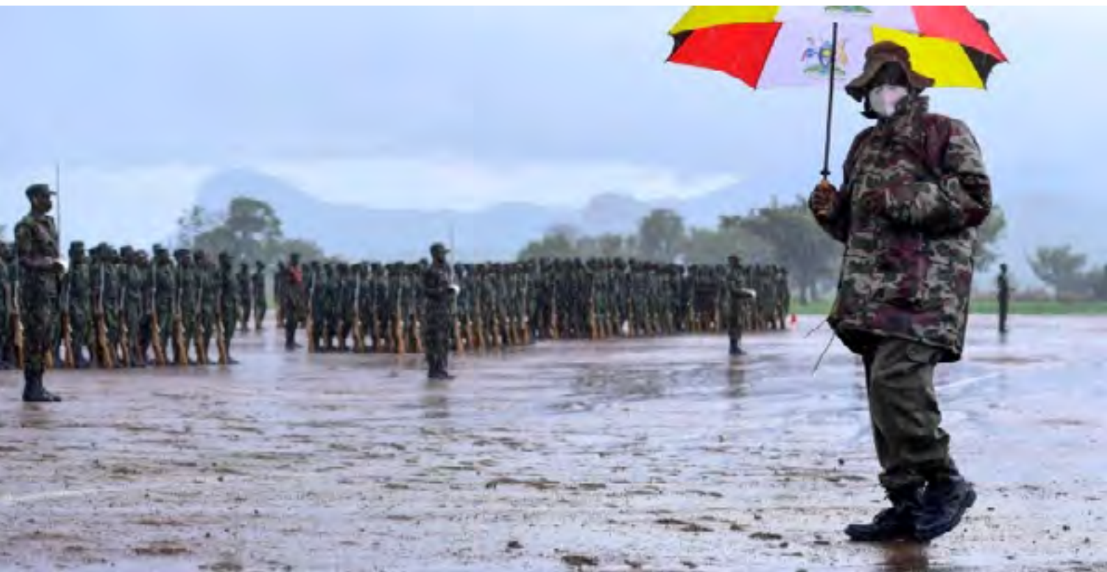
President Museveni inspecting a guard of honor and marching past by the new recruits

it from that angle otherwise you will be disappointed. If you are to stay in the UPDF, do your work and do it well. It is not about pay but service,” he said.