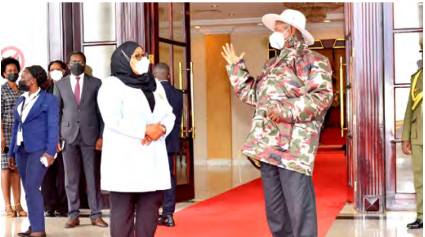
President Museveni seeing off President Samia Suluhu Hassan after her two-day state visit to Uganda