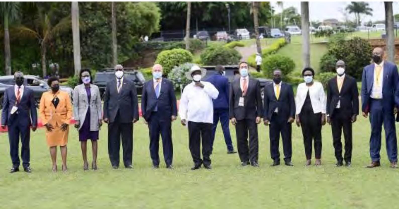
President Museveni poses for a photo with Turkish and Ugandan government officials during the Uganda - Turkey Investment Summit

The Investment summit was organised under the President’s guidance as part of efforts to boost economic ventures between Uganda and Turkey. President Erdogan of Turkey was represented by the Deputy Minister of Trade of Turkey Mr. Riza Tuna Turagay. A delegation of 94 investors from Turkey attended the summit held