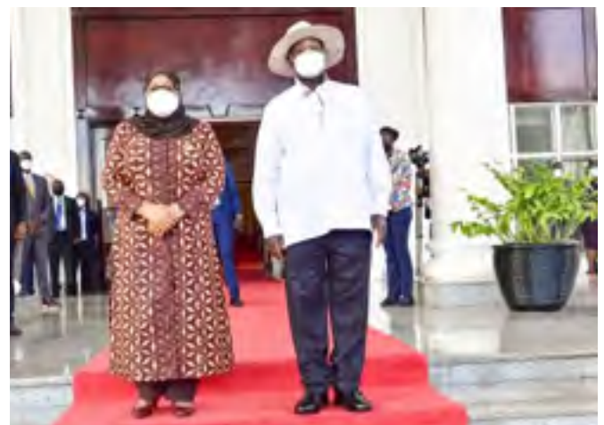
President Museveni poses for a photo with Tanzania's President Samia Suluhu Hassan.

Earlier at Entebbe International Airport VVIP terminal, the Tanzanian President was received by Hon. Rukia Nakadema Isanga, the Third Deputy Prime Minister and Minister without portfolio together with the State Minister of Foreign affairs, Hon. Okello Oryem.