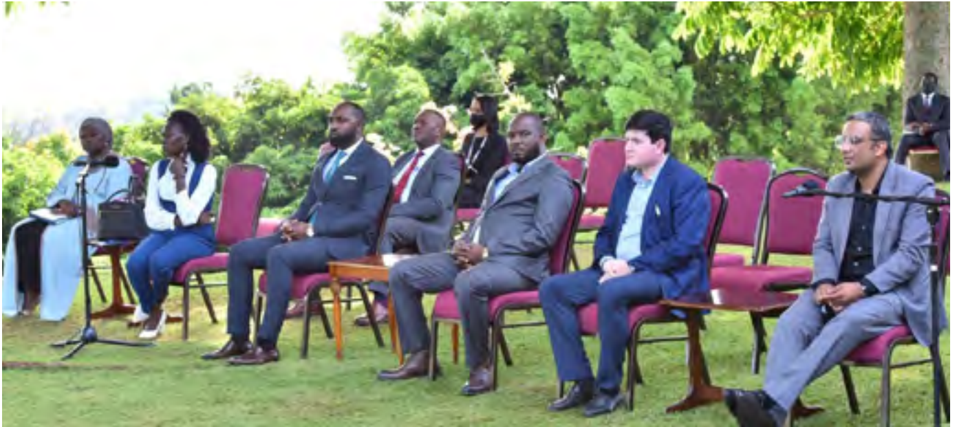
A delegation of Indian investors alongside Ugandan Government officials in a meeting with President Museveni