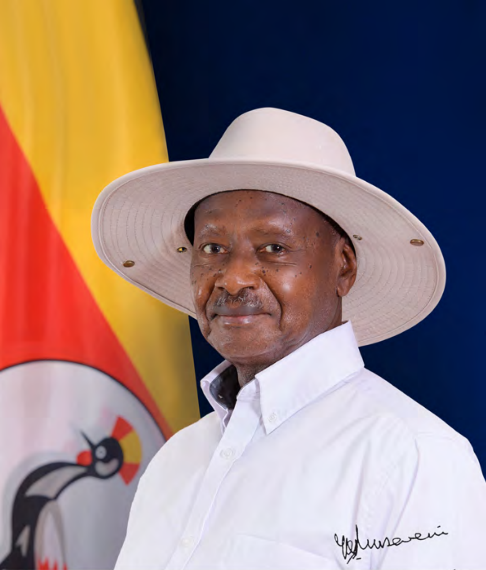
H.E. GEN. YOWERI KAGUTA MUSEVENI PRESIDENT OF THE REPUBLIC OF UGANDA