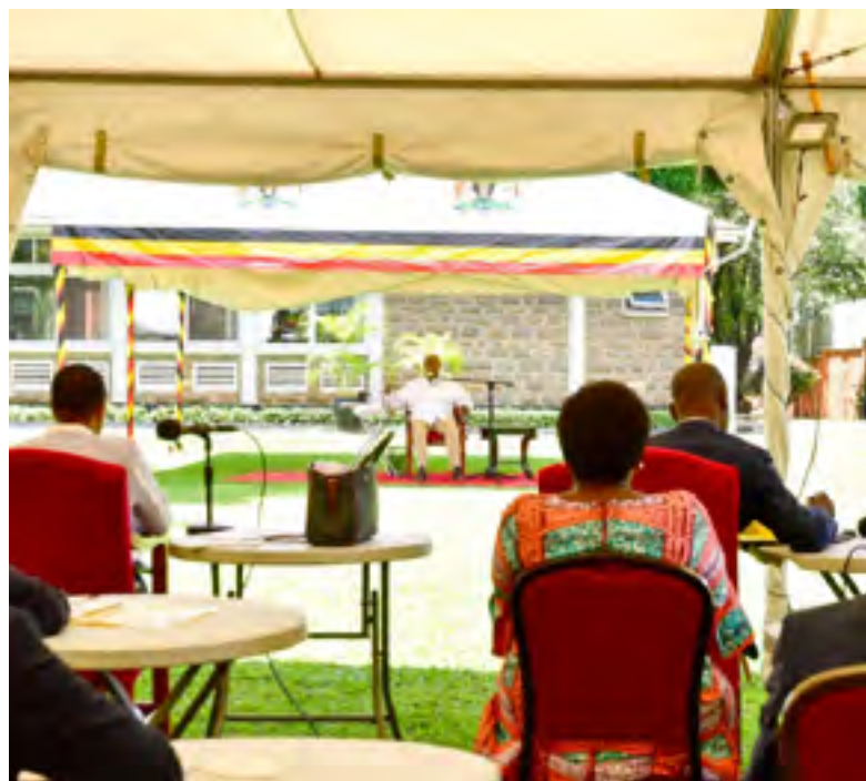
President Museveni addressing the Speaker of Parliament and members of the Parliamentary Commission on Budget during a meeting at State House Nakasero

The meeting was attended by the Prime Minister of Uganda, Rt. Hon. Robinah Nabbanja, the Minister of Finance, Hon. Matia Kasaijja, Clerk to Parliament, Hon. Adolf Mwesigye and Parliamentary Commissioners among others.