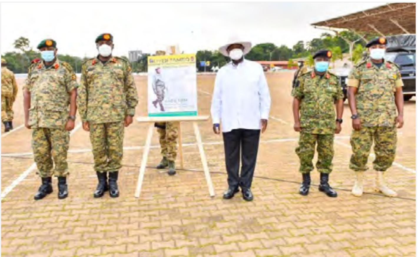
President Yoweri Museveni poses for a photo with some of the Army Officers next to a dummy Oliver Tambo Magazine that he had just launched.

128 officers attended the ideological course at the National Leadership Institute Kyankwanzi in Kiboga district while 154 participants attended a similar training at Oliver Tambo Leadership School in Kaweweta in Nakaseke district.