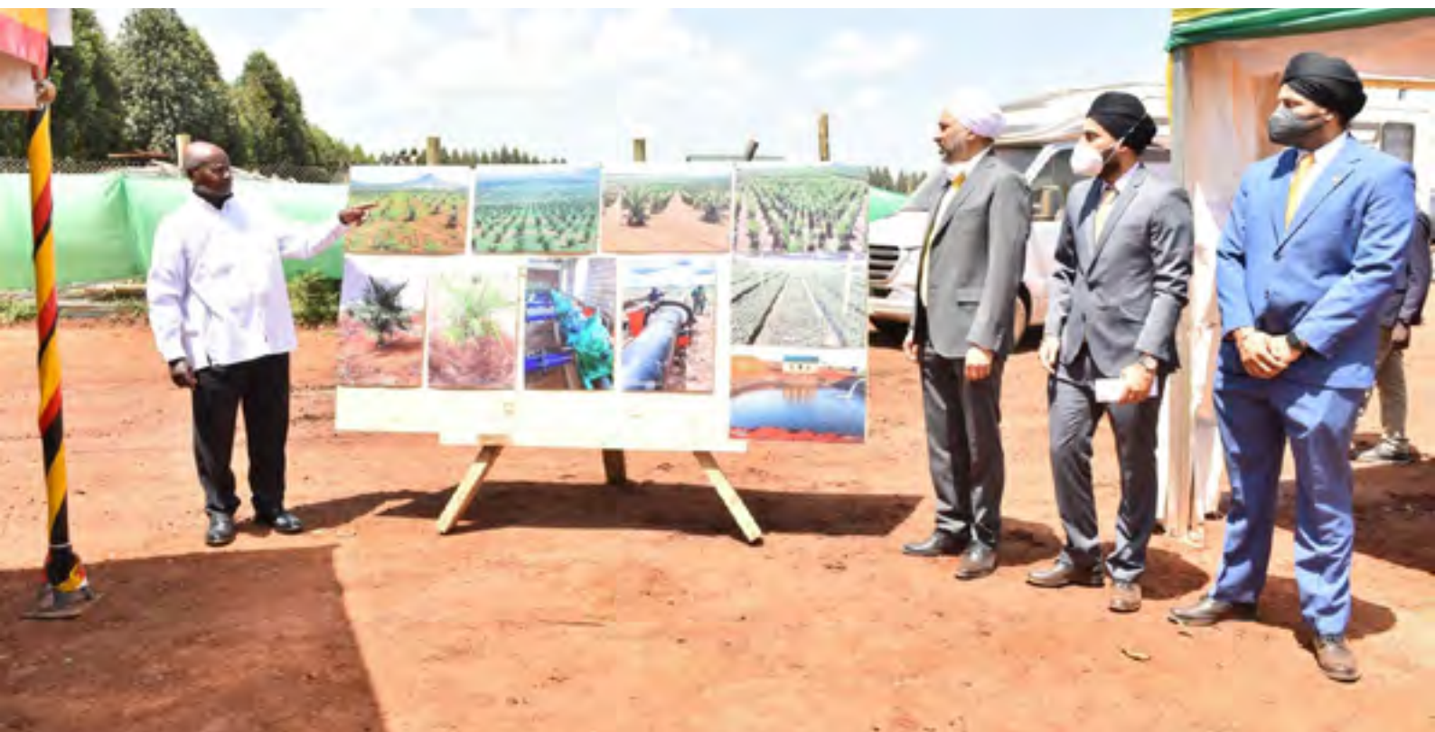
President Museveni commissions $ 60 million dollar sugar factory in Kiryandongo district

“Sarrai Group proprietors are focused on innovation in investment. They gave me an idea that the surplus power can be utilised at the cost of three cents and pump water