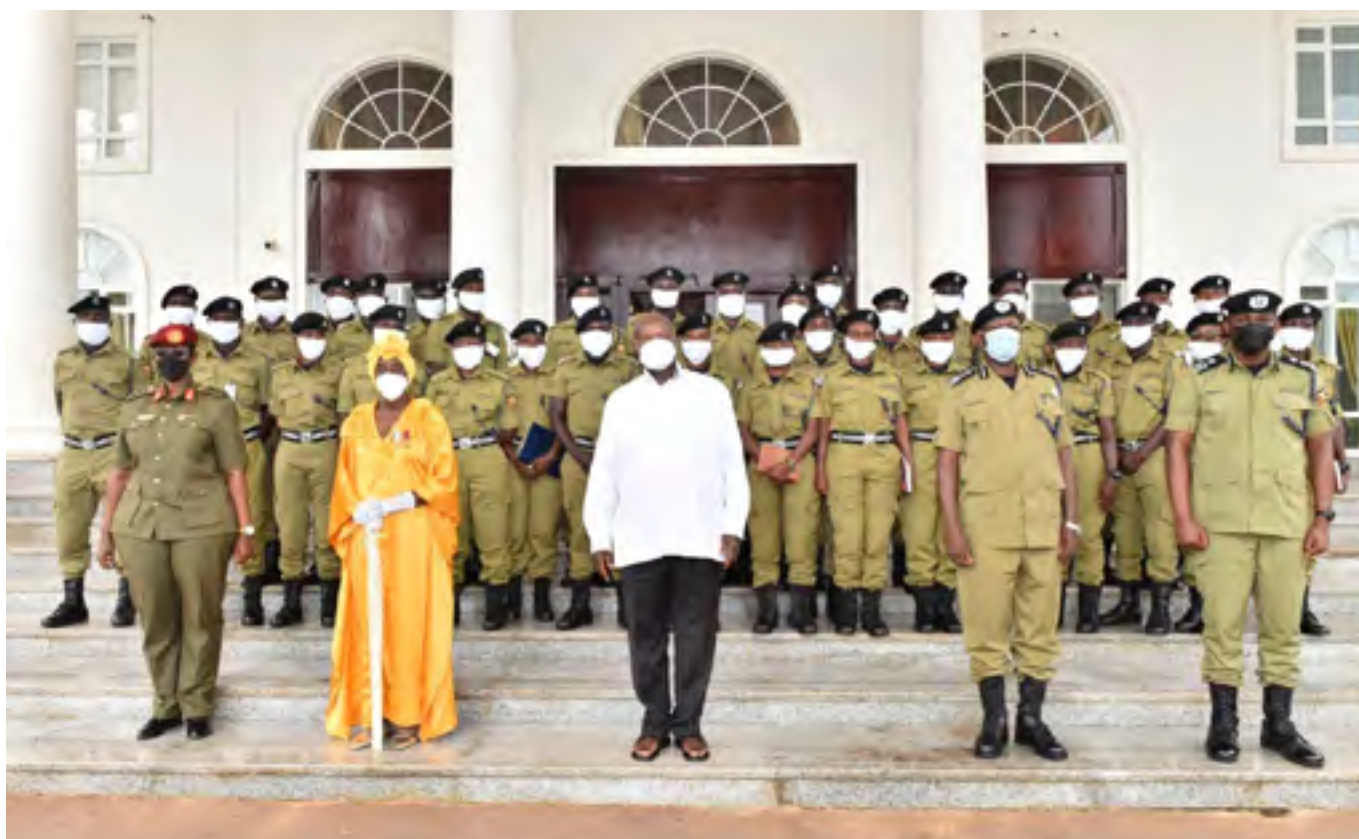
President Museveni poses for a photo with probationary police constables that had been undergoing training in Criminal law and Investigations.

The President urged leaders to sensitise the people to go from old science to modern new science through formal and informal and also doing business in new ways not