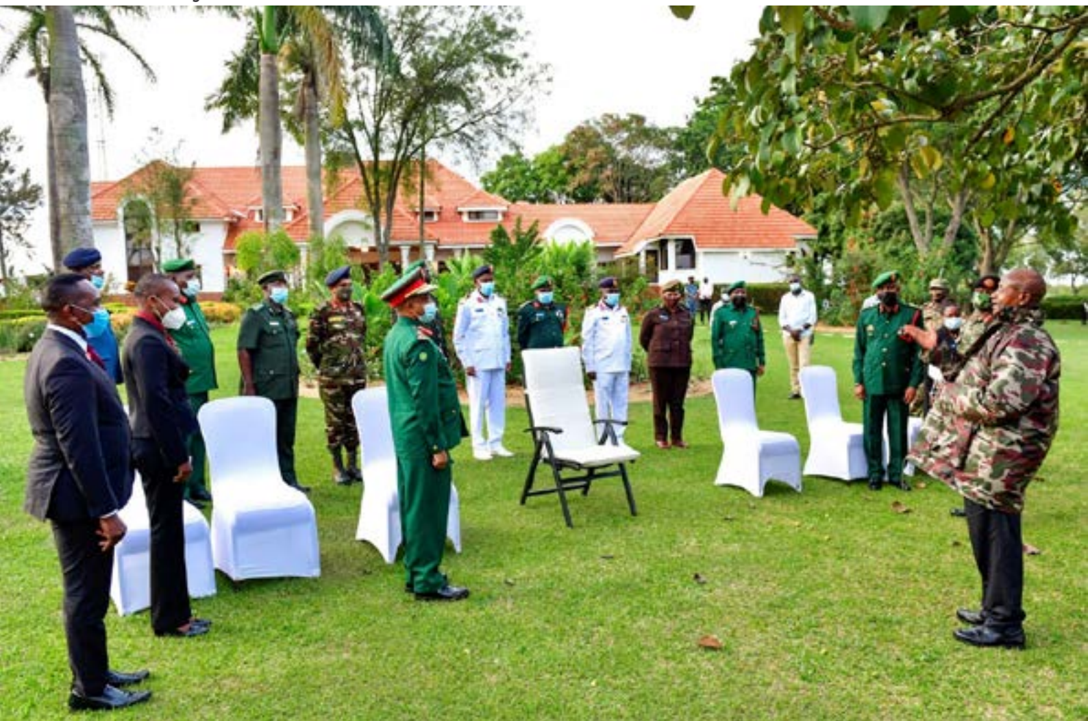
President Museveni chats with a delegation from National Defence College of Tanzania at Rwakitura, Kiruhura

“USA is one of the richest countries in the world because of its market, that’s why we need an African market for our prosperity. This will enable our people to move away from traditional way of doing things to modern ways,” he added.