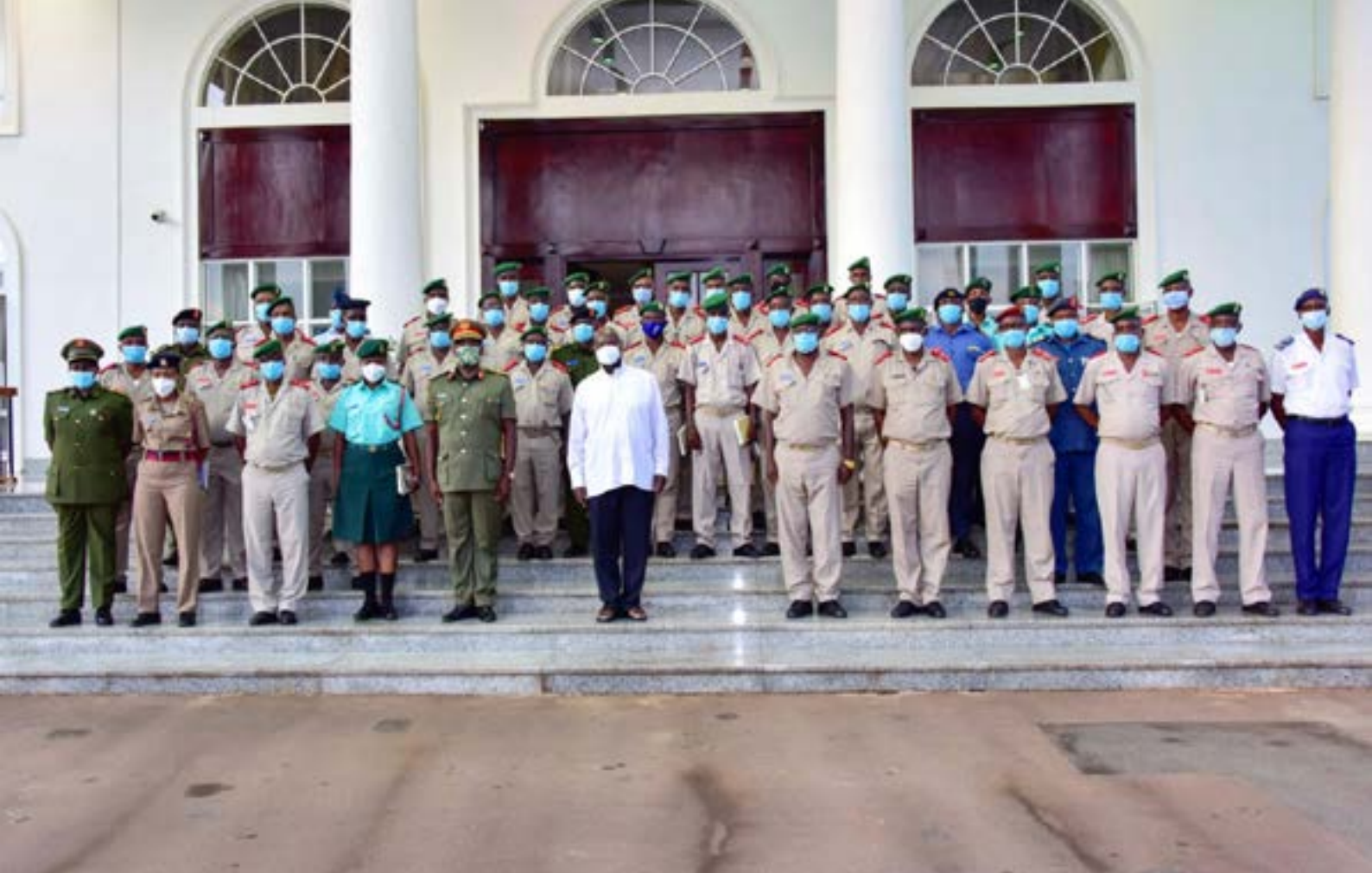
President Museveni poses for a photo with a delegation from Burundi National Defence Senior Command and Staff College, at State House, Entebbe

He explained that Idi Amin had built a small army of 20,000 soldiers mainly from his home area and they were the ones keeping him in power for eight years.