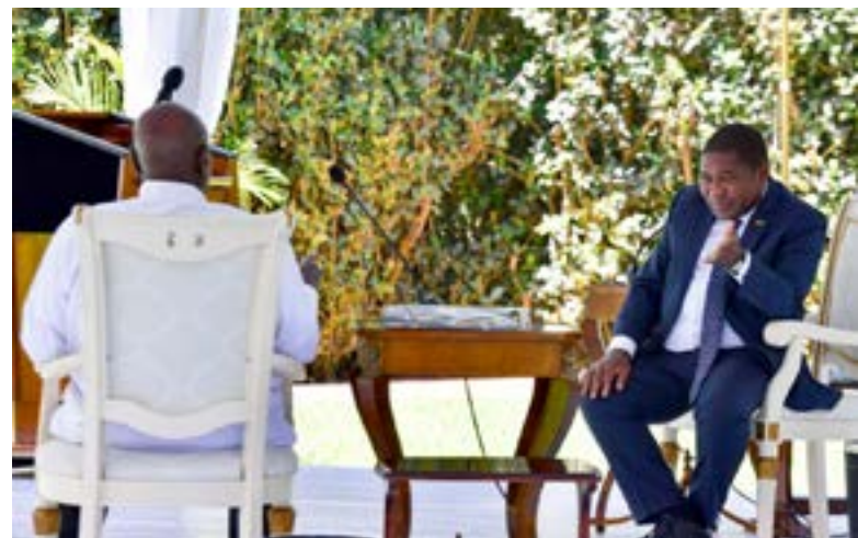
President Museveni and President Nyusi in a tete-a-tete at State House, Entebbe

The President also offered to train Mozambique nationals (Scientists) in wildlife conservation and protection to also reap from the huge benefits of tourism like Uganda.