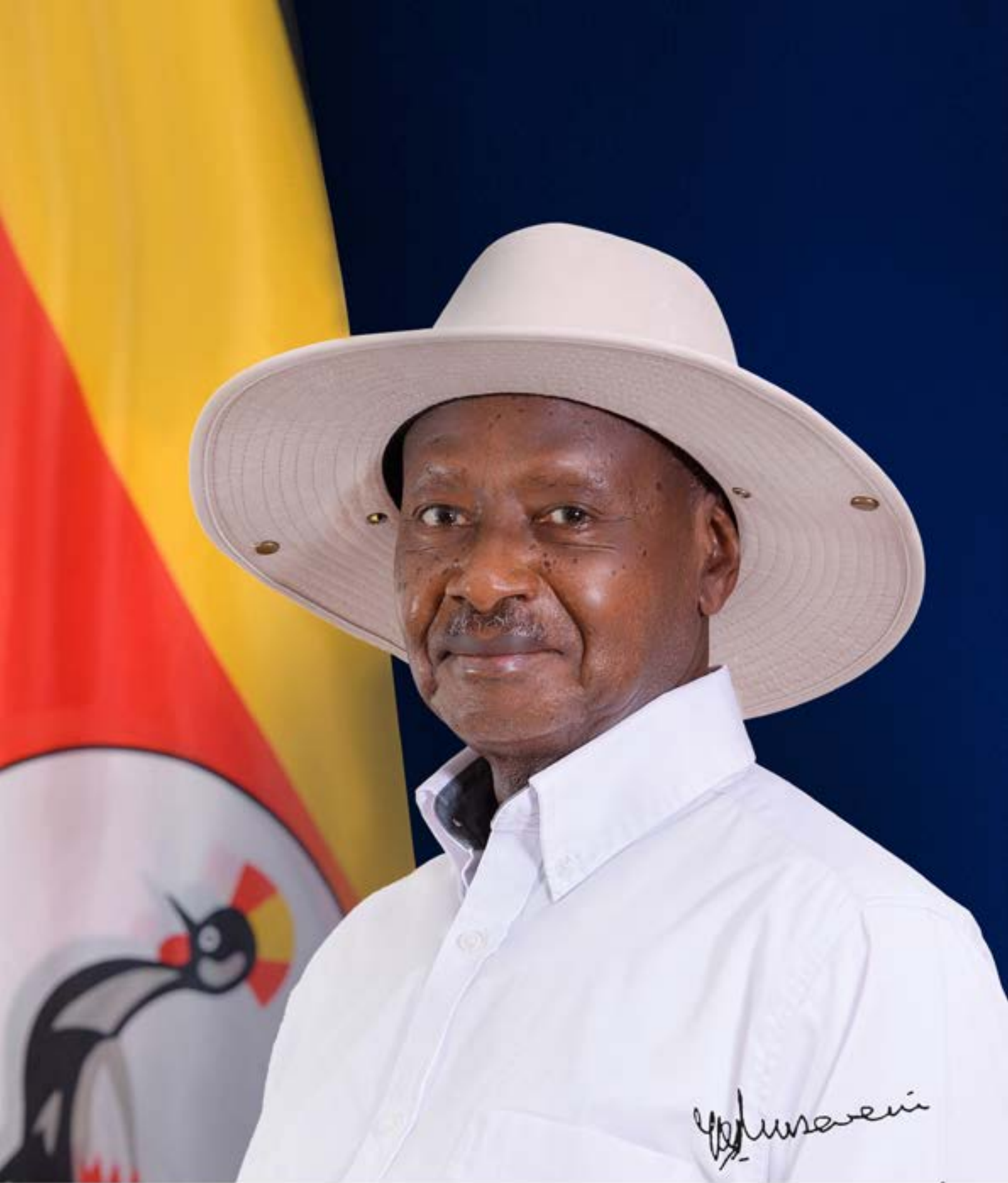
H.E. GEN. YOWERI KAGUTA MUSEVENI PRESIDENT OF THE REPUBLIC OF UGANDA