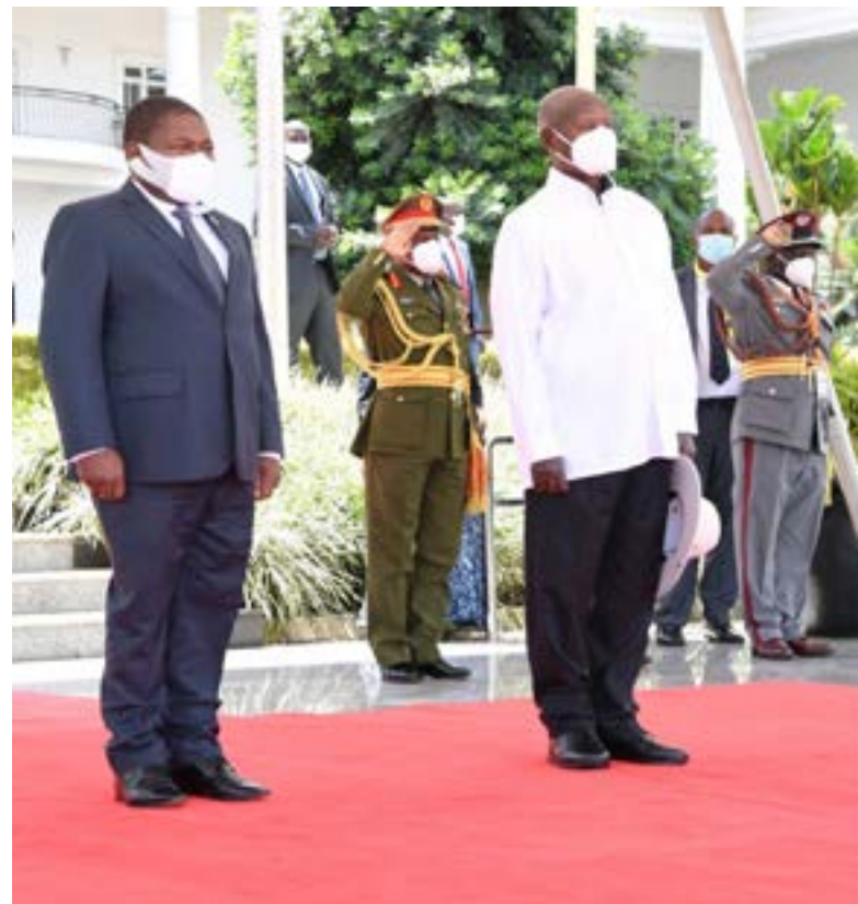
President Museveni welcomes President Filipe Jacinto Nyusi at State House, Entebbe

President Filipe Nyusi and his wife Isaura Nyusi will visit several places of mutual interest before returning home.