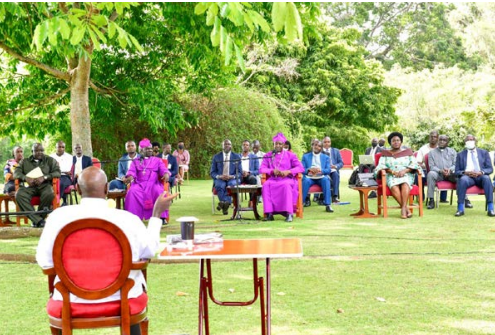
President Museveni meeting Church leaders at State House, Entebbe

Speaking to the delegation, President Museveni welcomed the idea of the memorial stadium saying it will promote