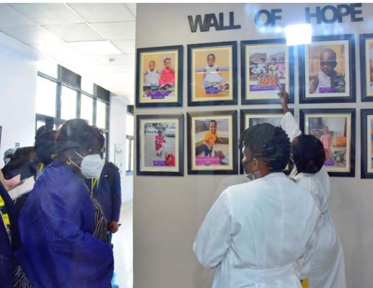
H.E. Dr. Isaura Ferrao Nyusi (left) visits the Wall of Hope at Mulago Specialised Women and Neonatal Hospital