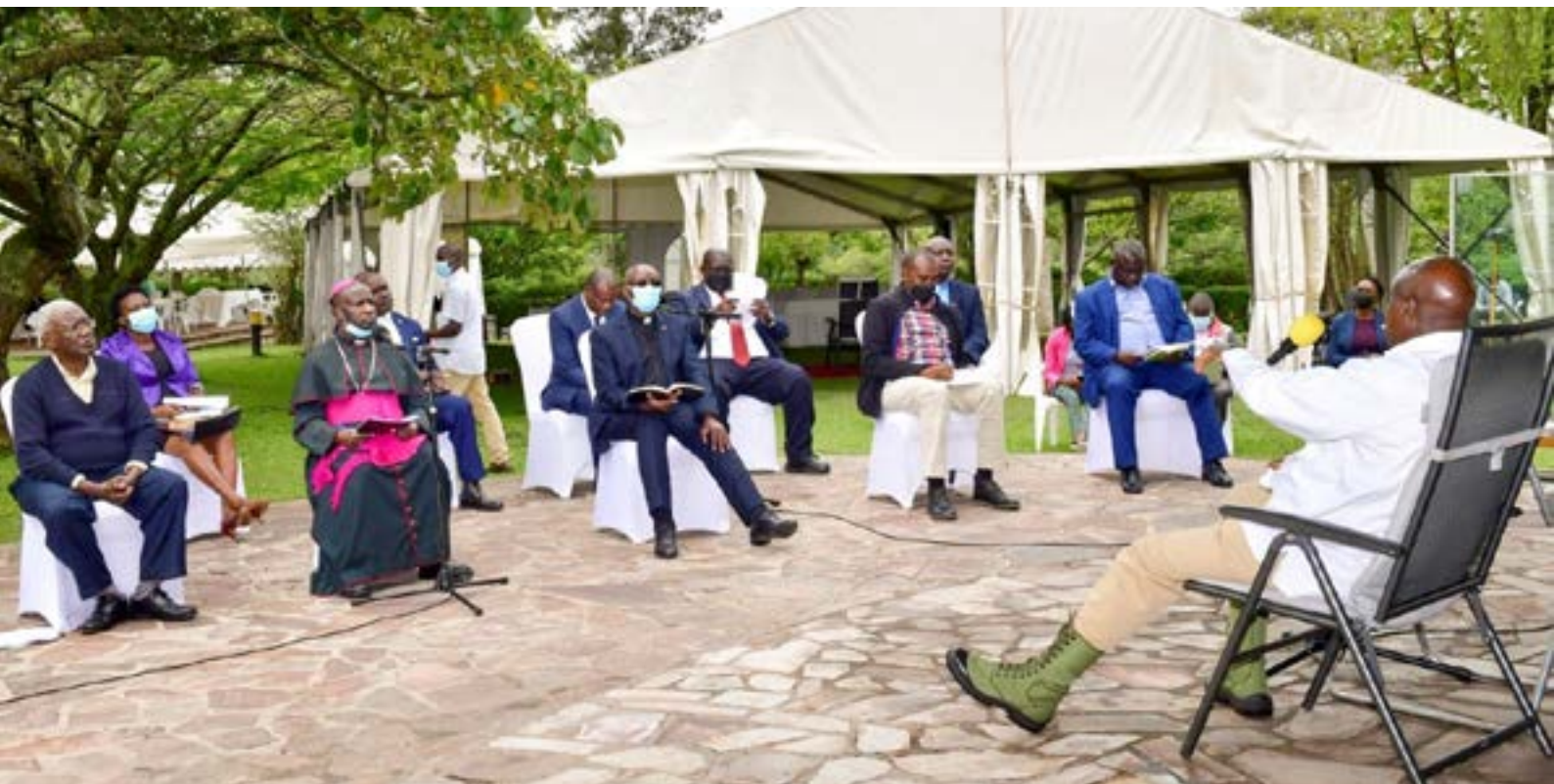
President Museveni addresses the Fort Portal Diocese delegation at Rwakitura, Kiruhura