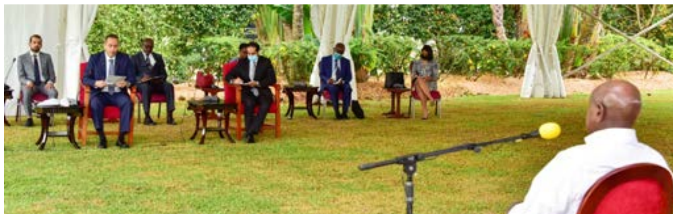
President Museveni meets the Saudi Arabia Embassy Delegation at State House, Entebbe

The delegation also expressed deepest condolences to the Government and people of Uganda for the loss of the Speaker of Parliament, Rt. Hon. Jacob Oulanya, and wished the soul of the departed eternal rest.