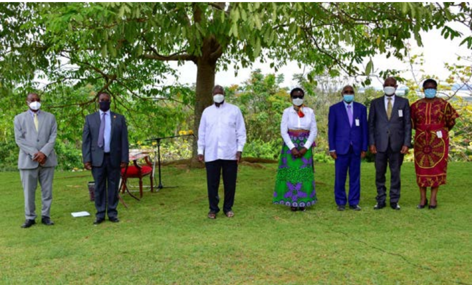
President Museveni posing for a photo with the UNFPA delegation at State House, Entebbe

Speaking to the delegation, the President assured them that Uganda has a different concept from them concerning what needs to be done when handling under-developed countries. He explained that UNFPA and other donors emphasise consumption, spending especially on social services. “They have adequate budgets for health, education whereas we, the Batembuzi, (people who go to unchartered territories and clear them), the Pioneers, our system here is to clear the bush. The Baganda call it “ettale”