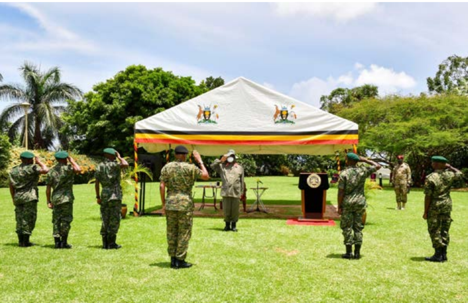
Officers of UPDF salute President Museveni during the meeting at State House, Entebbe