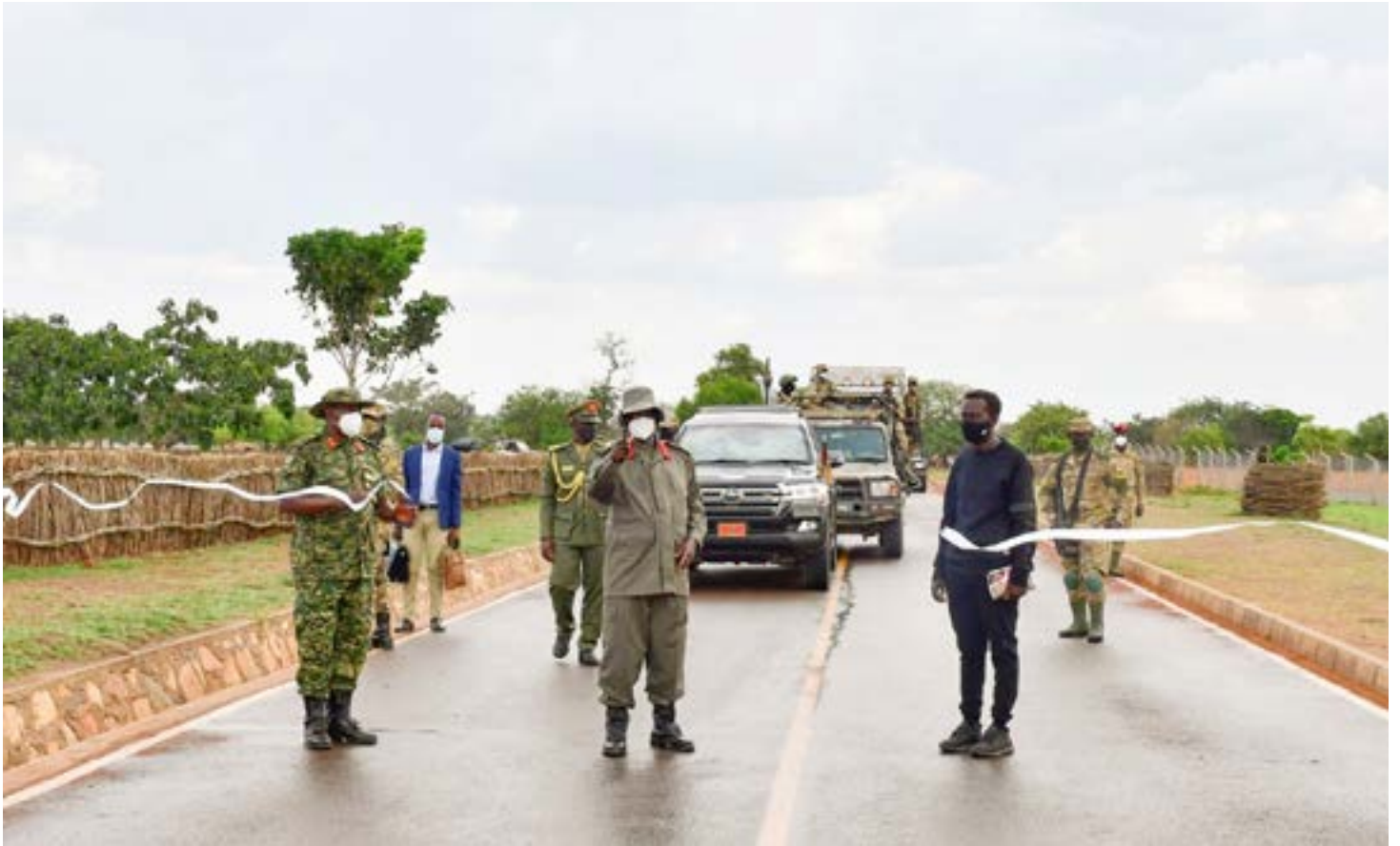
President Museveni commissions the road network connecting Kaweweta Recruits Training School, Fort Samora Machel Special Forces School and Oliver Reginald Tambo School of Leadership and Pan-African Centre of Excellence