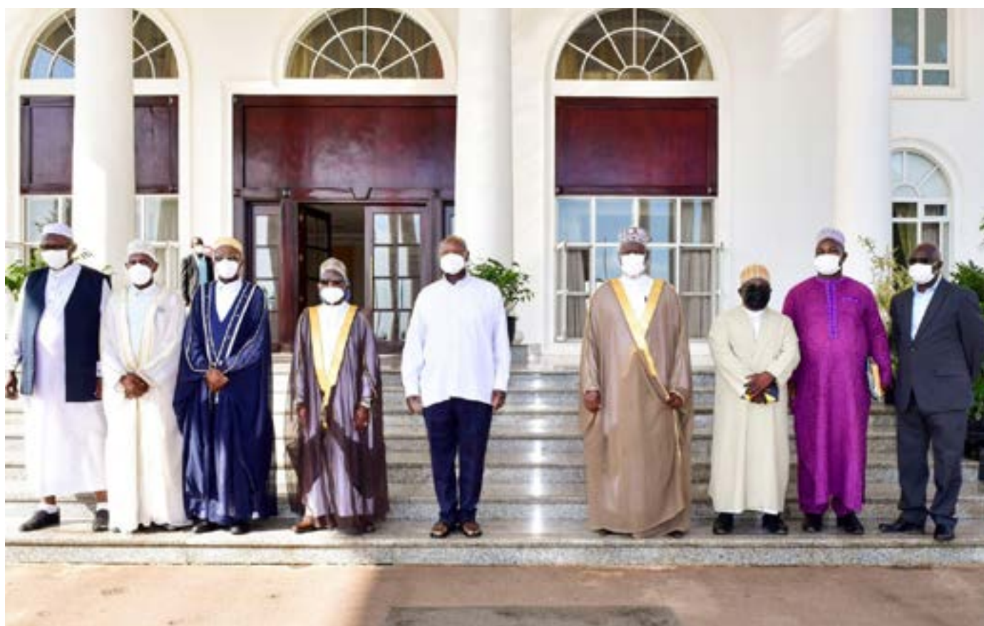
President Museveni poses for a photo with Muslim leaders after a meeting at State House, Entebbe