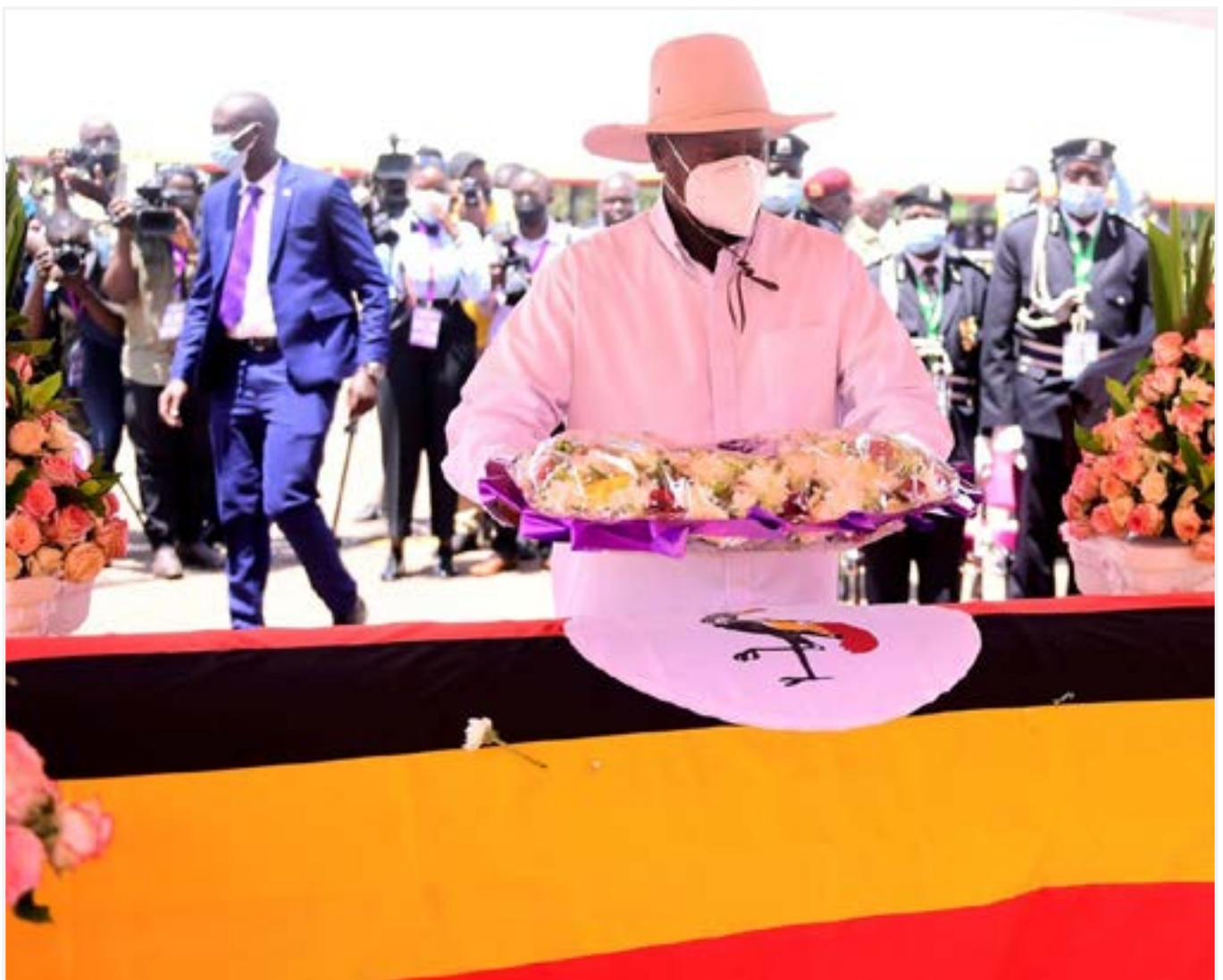
President Museveni lays a wreath at the casket containing remains of former Speaker, Rt. Hon. Jacob Oulanyah

The President commended the late Omoro County MP for having used his talents well while on earth and promised to support Jacob Oulanyah Education Trust Fund that has been set up to educate the former Speaker’s children and others who depended on him.