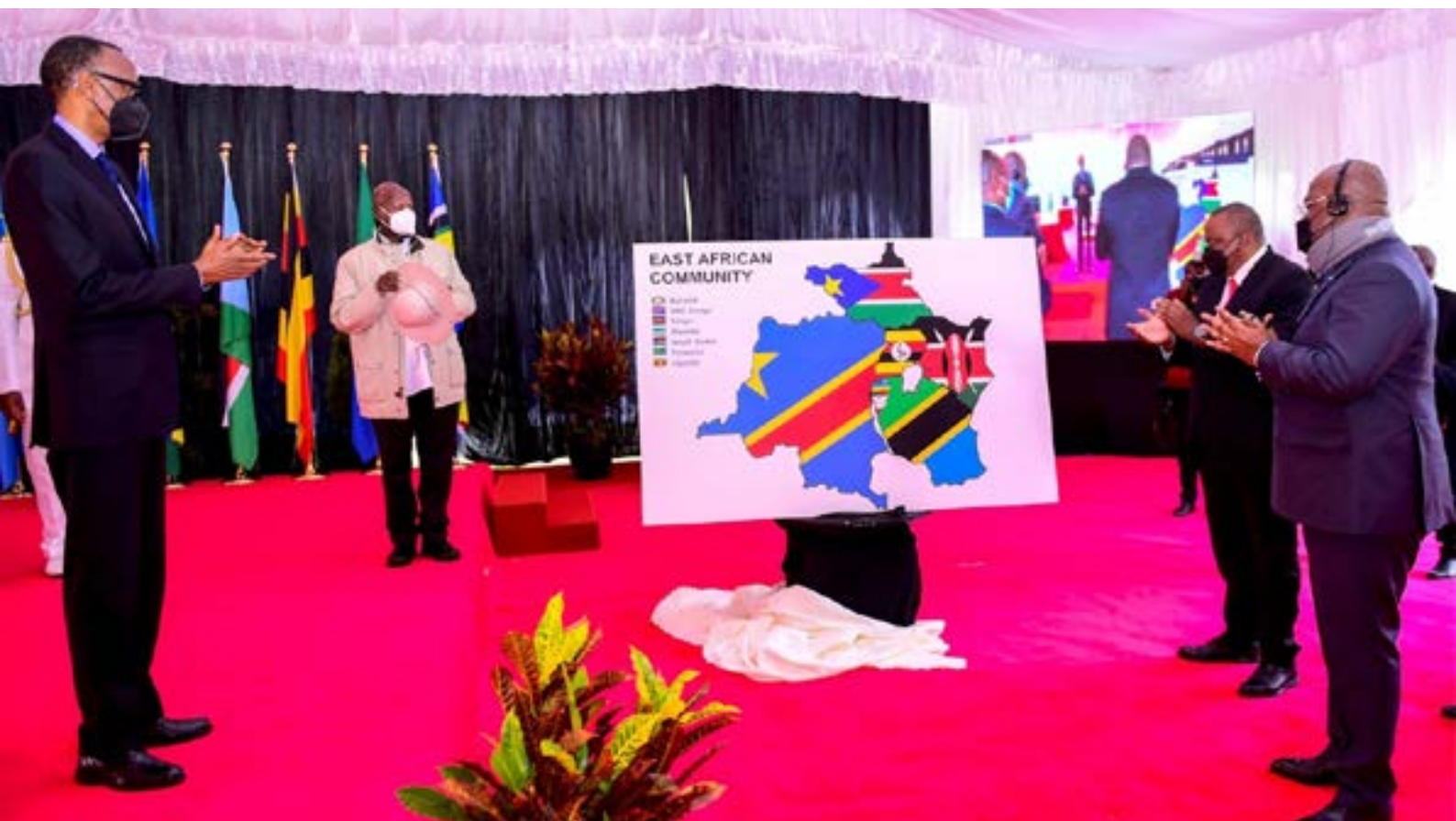
Heads of State of the East African Community unveil the new map of the community in Nairobi, Kenya

“If you want prosperity in Africa, the way forward is markets, to be able to negotiate for bigger markets in Africa and in East Africa. If I am a business man or business woman and I produce a product or service, how many people will buy from me,” he said.