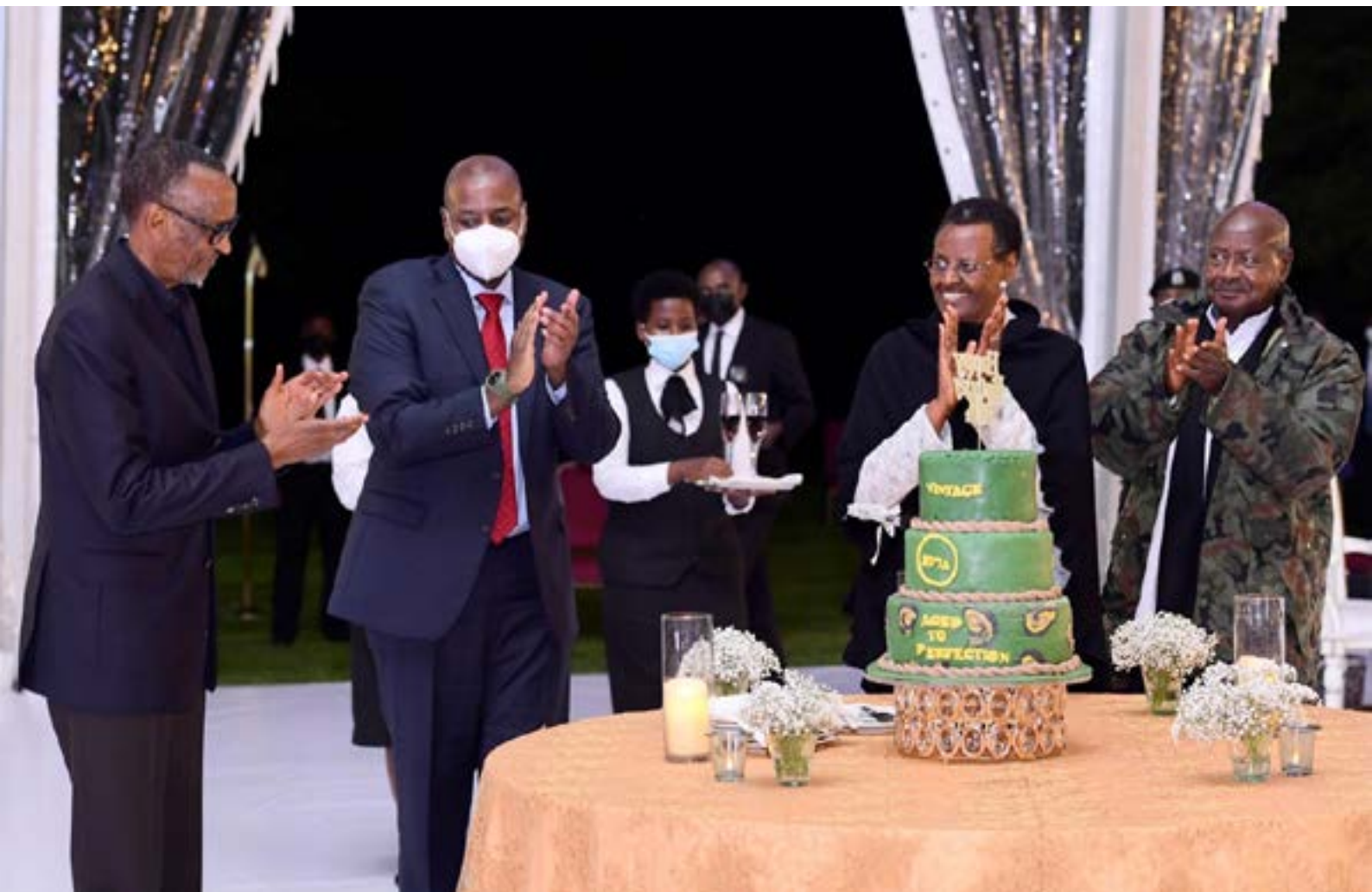
L-R: President Paul Kagame, Lt. Gen. Kainerugaba, First Lady Janet Museveni and President Museveni during the dinner at State House, Entebbe

Later the two Heads of State went for a bilateral meeting where they discussed