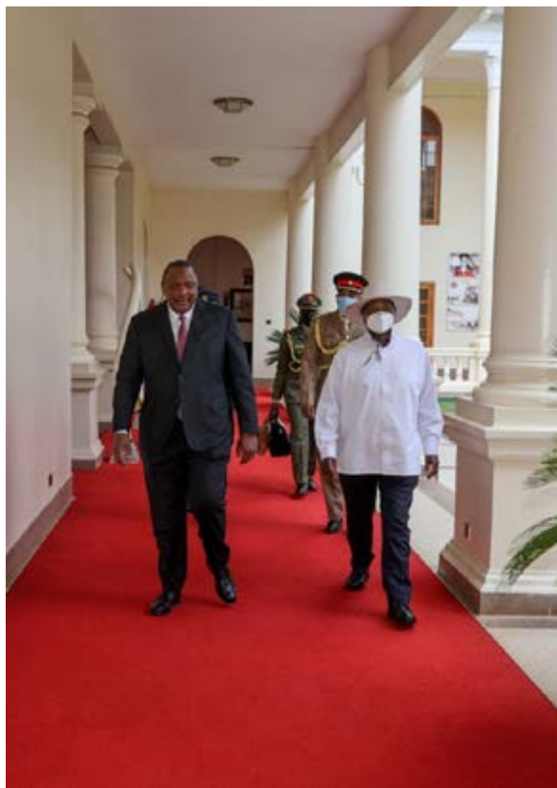
President Museveni is received by President Uhuru Kenyatta of Kenya at State House, Nairobi

10. ADOPTED on 21st April, 2022, Nairobi, Kenya