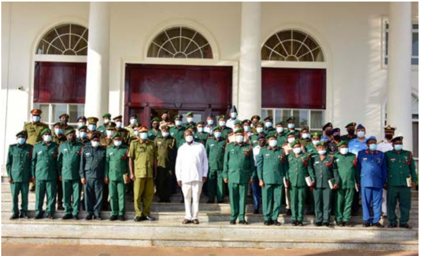
President Museveni poses for a photo with a delegation from Command and Staff College, Duluti, Arusha, Tanzania, at State House, Entebbe

“We took a holistic picture and you must have known that Uganda had become a failed state just like Somalia and other failed states. And