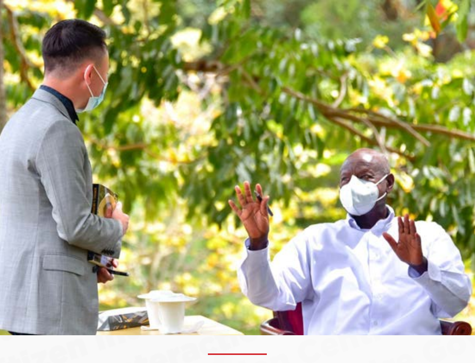
President Museveni gifts a Chinese investor a copy of his autobiography; Sowing the Mustard Seed, during the meeting at State House, Entebbe

Zhurong Hydropower is interested in bulk power purchase, potentially being the largest power off-taker in Uganda.