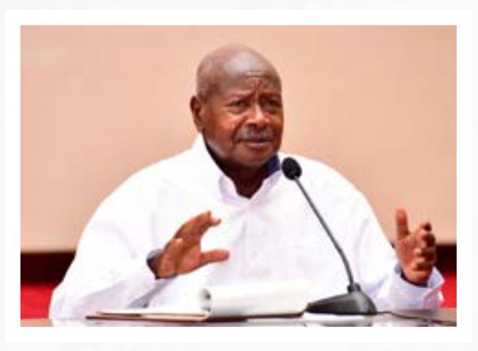
President Museveni addresses the 19th Extraordinary Summit of the EAC Heads of State Summit

President Uhuru Kenyatta said DRC was first assessed by a council of the EAC ministers who concluded that the DRC is eligible to join the EAC, adding, that the aim of regional integration blocks is to strengthen our relationship, expand our markets for goods and services, create