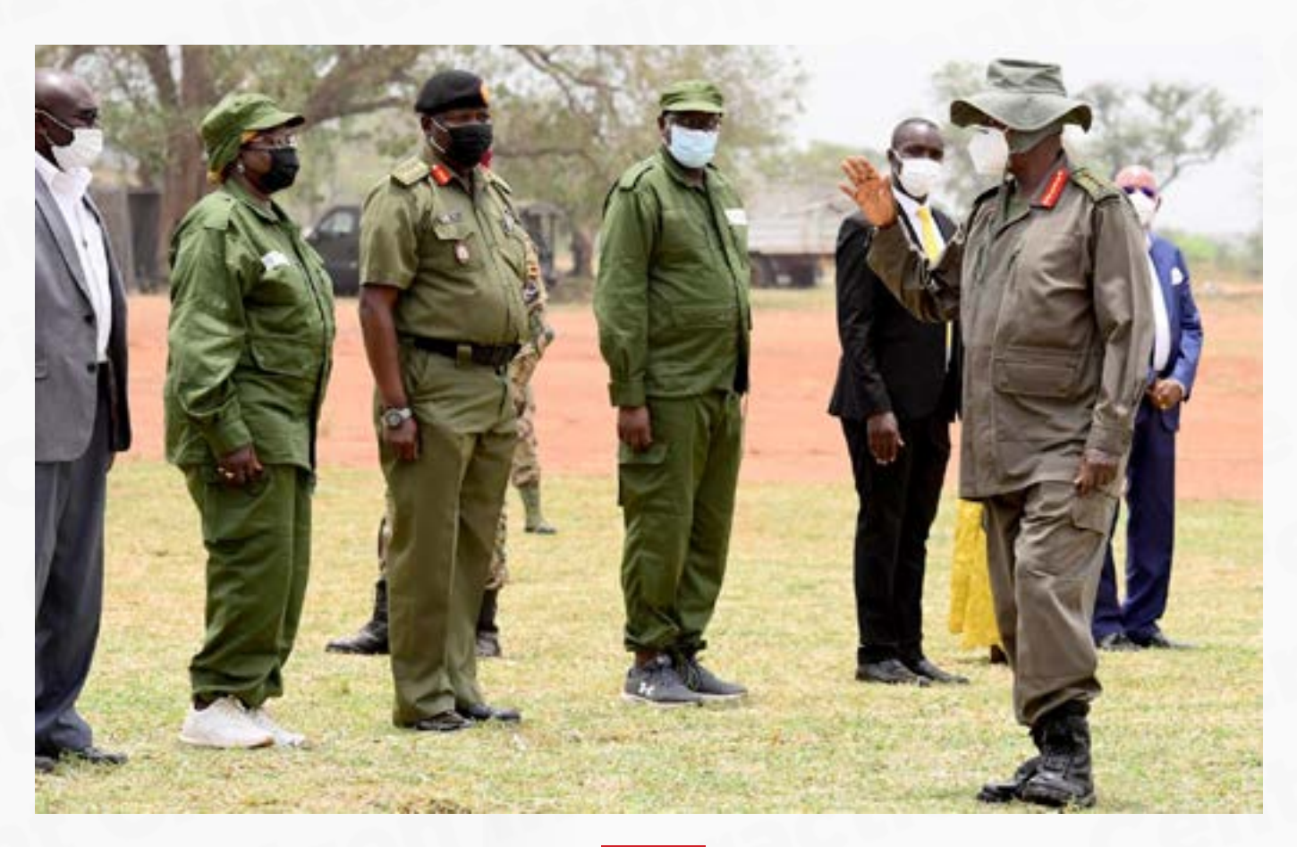
President Museveni on arrival at NALI, Kyankwanzi for the meeting

Areas of focus include agriculture, livestock, poultry and fish farming among others. Government intends to inject Uganda shillings 100 million per Parish to implement the model which will focus on production, storage, processing and marketing. It will also include infrastructure and economic services, financial inclusion,