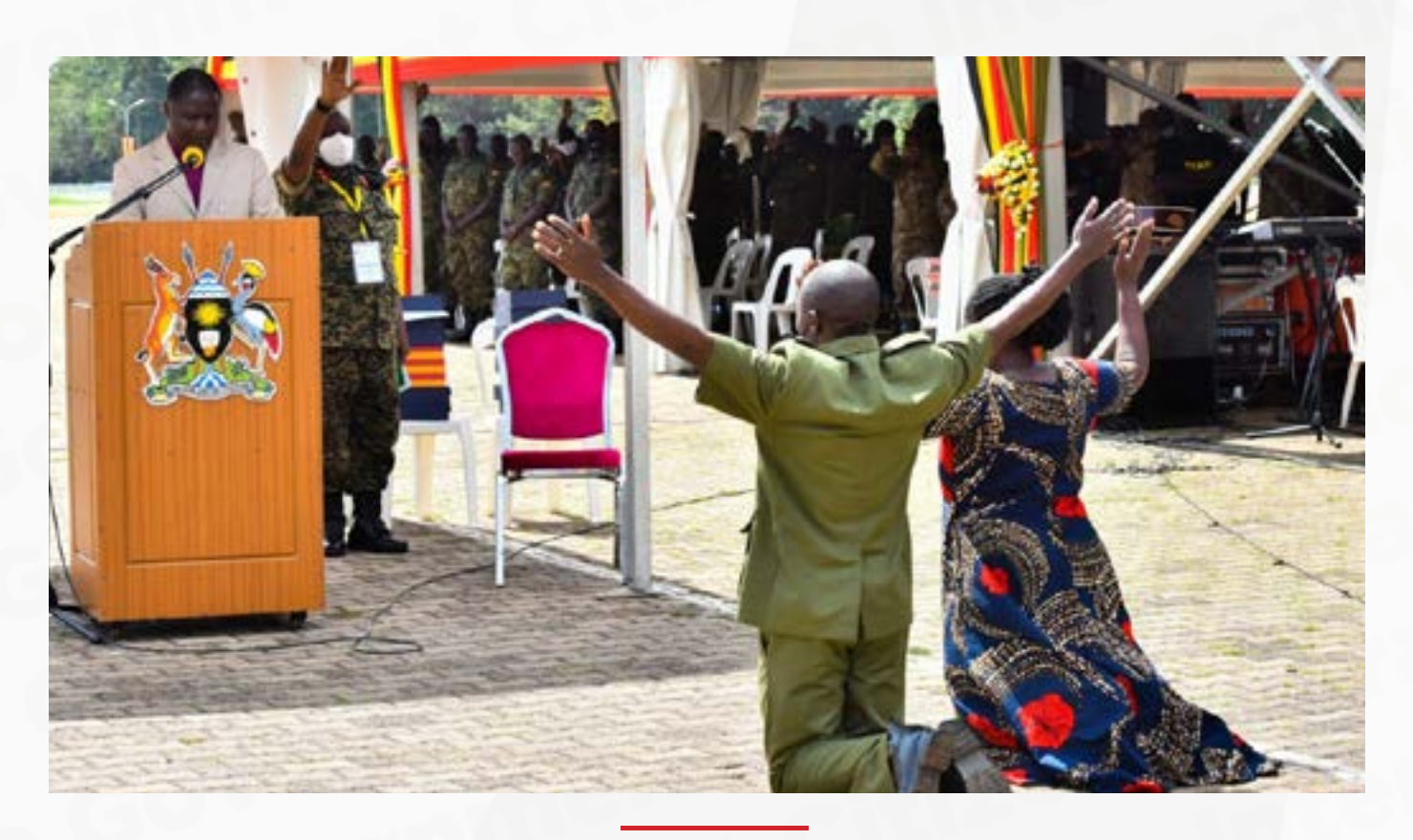
Some of the veterans pray during the thanksgiving breakfast at Kololo

The 41st UPDF Tarehe Sita Anniversary and Defence Forces Week activities were held in Bugisu and Sebei subregions of Eastern Uganda in February this year.