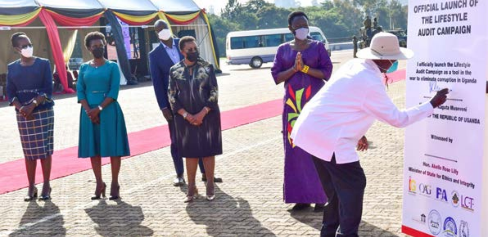
President Museveni launches the Lifestyle Audit Campaign at Kololo Independence Grounds

on locust money (UGX.24B), COVID-19 money (UGX.59B), Innovation Fund for the former Ministry of Science and Technology (UGX.78B), renovation of Entebbe Airport (UGX.17B), SAGE money involving ghost elderly people (UGX.49.6B), Ministry of Agriculture (UGX. 9B) among others. She said the cases are at different levels of completion between investigation, prosecution and appeals in courts of law.