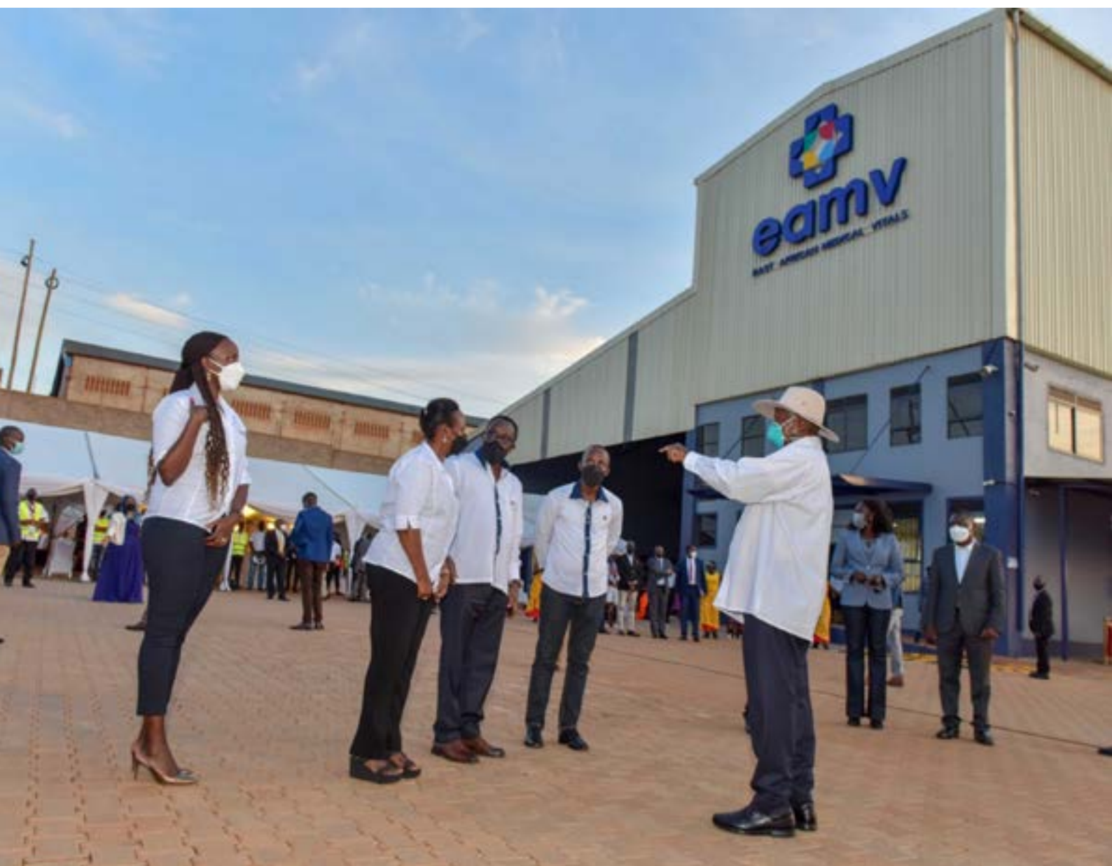
President Museveni interacts with the Management of EAMV factory in Namanve

The Minister of State for Trade, Mr. David Bahati, officials from Uganda Investment Authority (UIA), Ministry of Health, National Drug Authority (NDA), National Medical Stores (NMS) and the business community attended the ceremony.