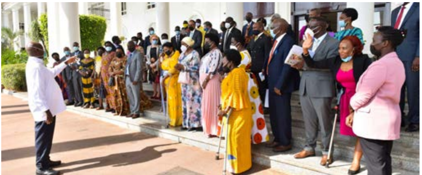
President Museveni gestures to officials who attended the International Day of PWDs at State House, Entebbe

"It reminds us that persons with disabilities must be part of any decision-making process around COVID-19, around the achievement of Sustainable Development Goals, or around any other issue relevant to our societies," he said.