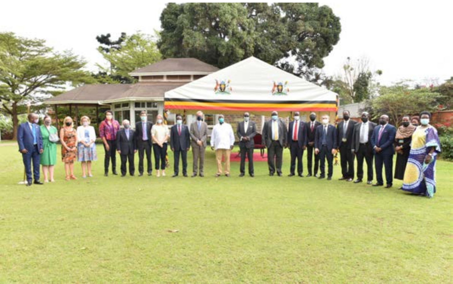
President Museveni posing for a photo with participants in the South Sudan talks during a meeting held at State Lodge, Nakasero

He said that his government was addressing the peace process through defence, elections and the constitutional process. He called on the international community to lift the embargos imposed on South Sudan.