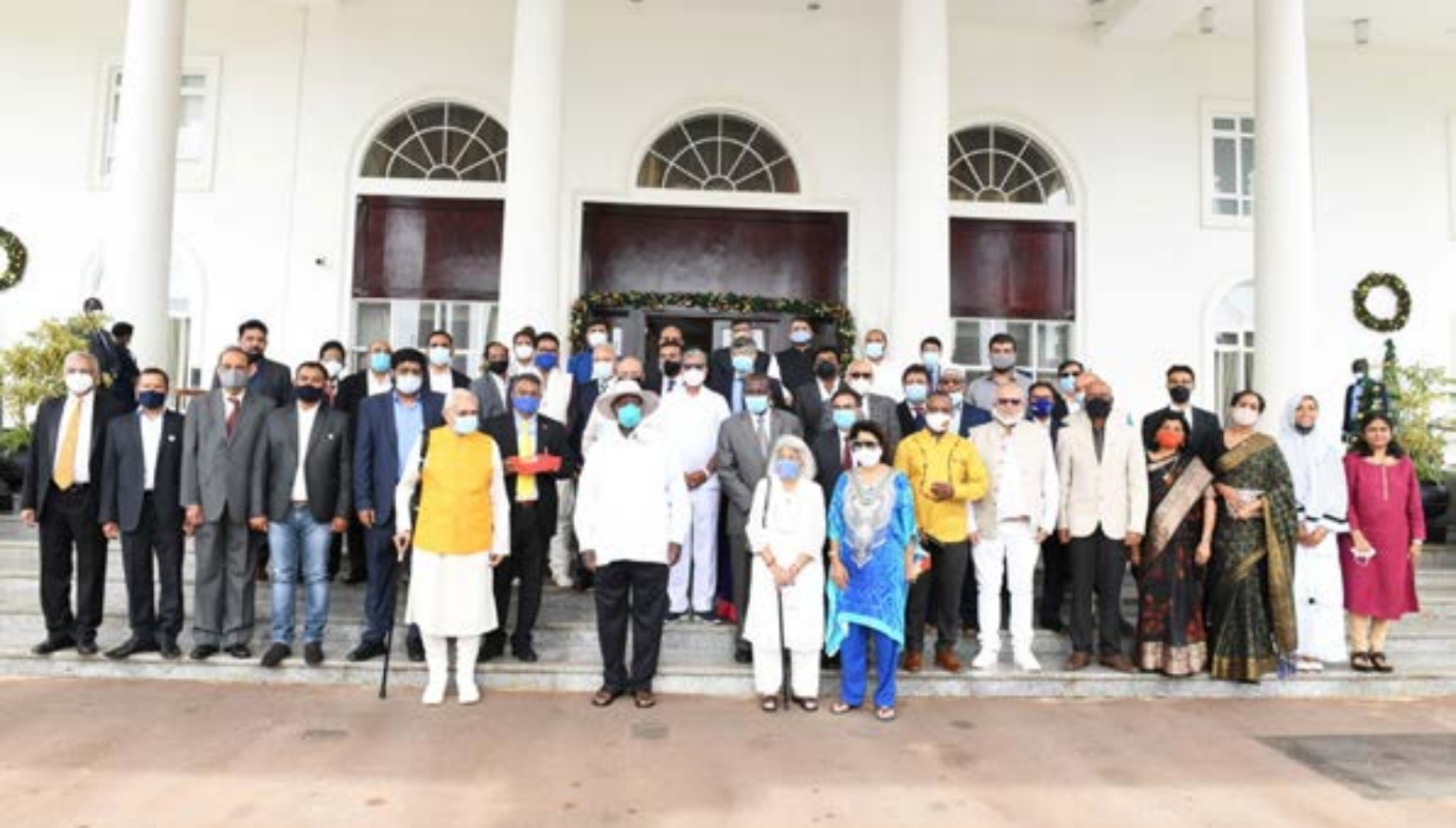
President Museveni poses for a photo with the Indian Community in Uganda at State House, Entebbe

He commended the Indian community for their tremendous contribution towards national economic development and prosperity.