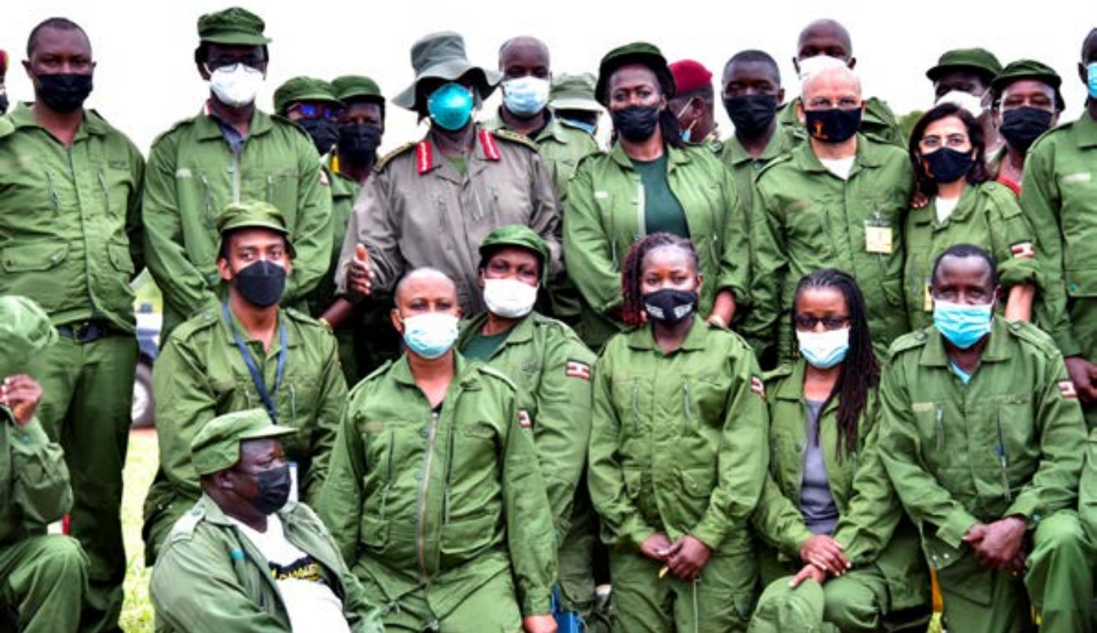
President Museveni (with red gorgets) posing for a photo some of the CEOs at NALI, Kyankwanzi

the Prime Minister's directive to have all Accounting Officers procure local content.