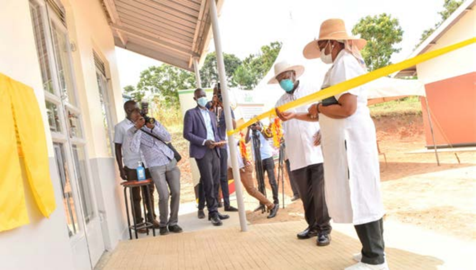
President Museveni and First Lady commission Keihangara Seed Secondary School in Ibanda District

for personal gain that they will be got and punished.