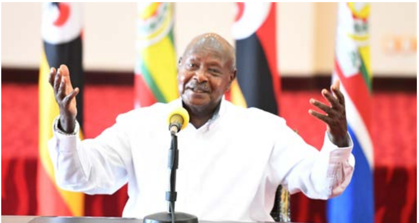
President Museveni gestures during a meeting with H.E. Modeste Bahati Lukwembo, President of the DRC Senate

The President was holding a zoom meeting from State House, Entebbe, with the President of the Senate of the Democratic Republic of Congo (DRC), H.E. Modeste Bahati Lukwembo, who was at the Ministry of Foreign Affairs in Kampala.