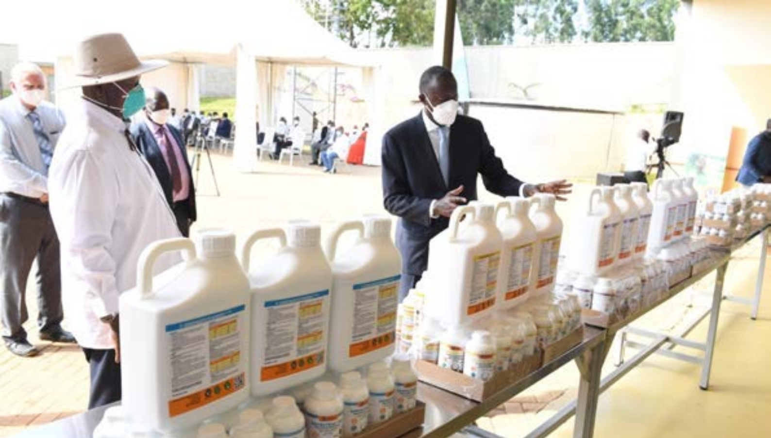
President Museveni inspects some of the animal drugs manufactured by Sanga Vet. Chem. Ltd

by accessing low interest loans from UDB. Government cannot fail to fund this vital venture,” he said.