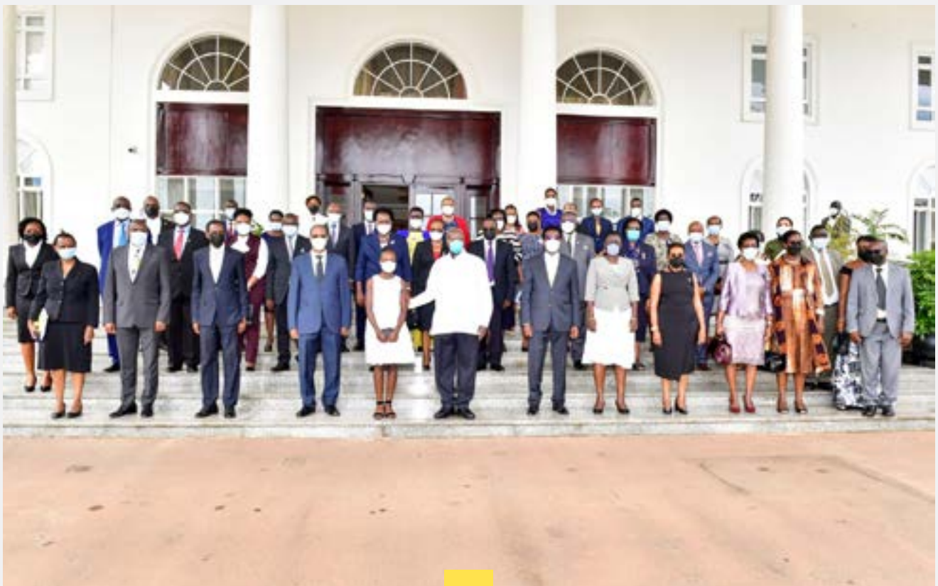
President Museveni poses for a photo with newly sworn in Judges, IGG and Deputy IGGs.