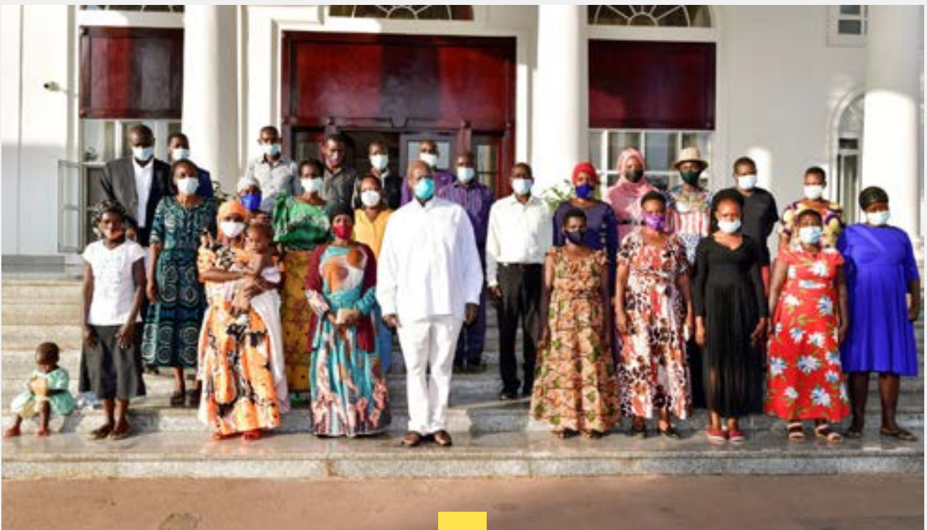
President Museveni poses for a photo with families of the Masaka and Lwengo murder victims at State House, Entebbe