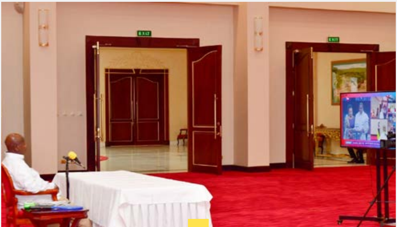
President Museveni virtually addresses Christians on World Prayer Day

‘First of all know the importance of God, have God in your life and in all your actions. Secondly it helps in overcoming selfishness. If you love your neighbor as you love yourself you overcome all selfishness, forgiving unconditionally. Jesus said you should even love your enemies. Those who listened have added value to our lives,” he said.