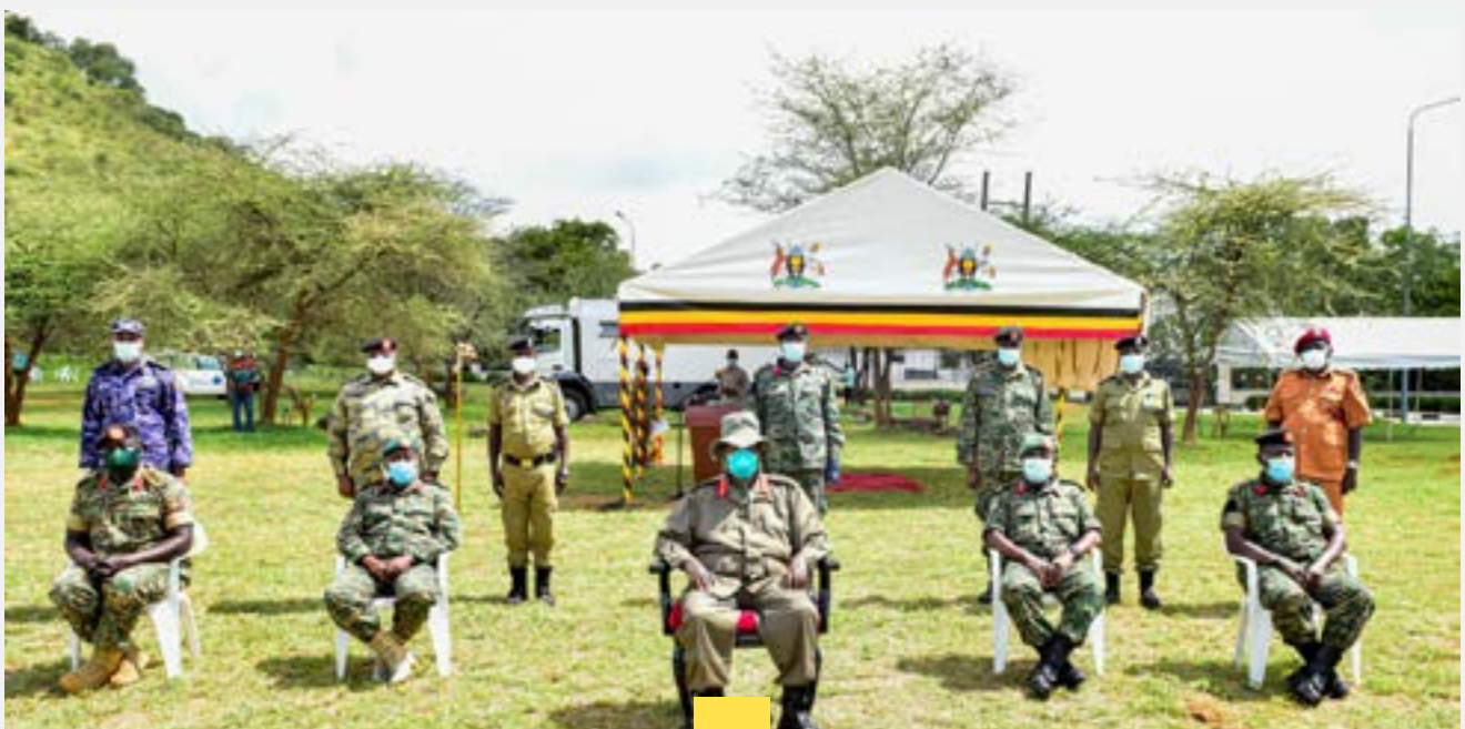
President Museveni posing for a photo with top security commanders for Karamoja region

The meeting discussed various strategies that will be tabled at the High Command before implementation.