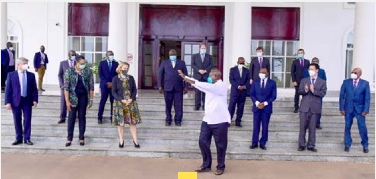
President Museveni gestures to representatives of the permanent members of UN Security Council after a meeting at State House, Entebbe

The Minister of Foreign Affairs Hon. Gen. Odongo Jeje Abubakhar and State Minister of Foreign Affairs Hon. Okello Oryem also attended.