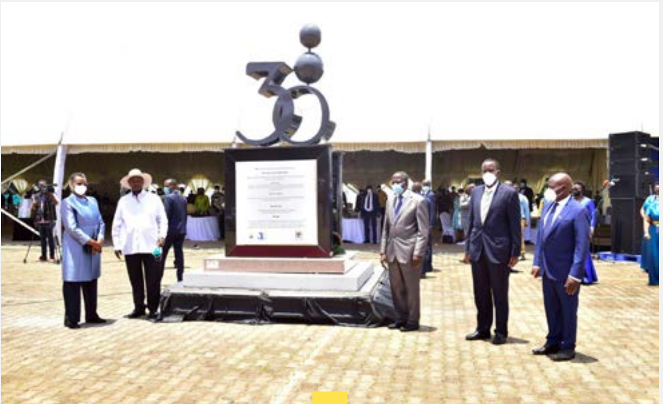
President Museveni, First Lady, Minister for Finance, Planning and Economic Development at URA Commissioner at the celebrations (15th September, 2021)