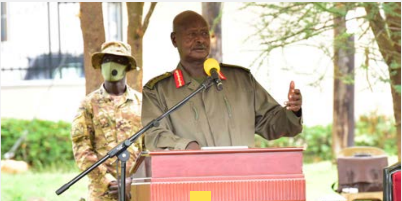
President Museveni addressing Karamoja leaders at Morulinga State Lodge

The group also recommended intelligence led operations to curb crime and pave way for disarmament and quick deployment