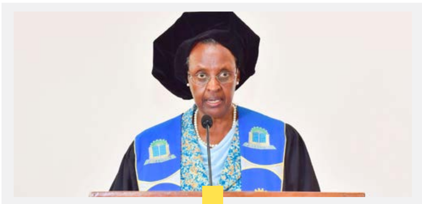
First Lady and Minister for Education and Sports, Hon. Janet Museveni, speaking at the graduation ceremony

“Keep on upgrading yourselves, learning does not end,” he advised.