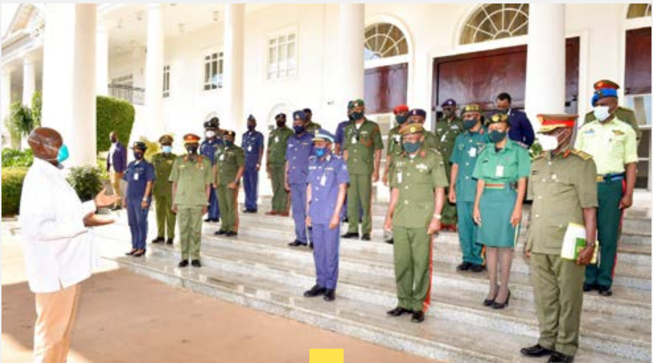
President Museveni gestures to students of Zambia Command and Staff College after a lecture at State House, Entebbe

The delegation that commenced its tour of Uganda on Monday September 27th, has visited various institutions and returned to Zambia on Saturday the 2nd October 2021.