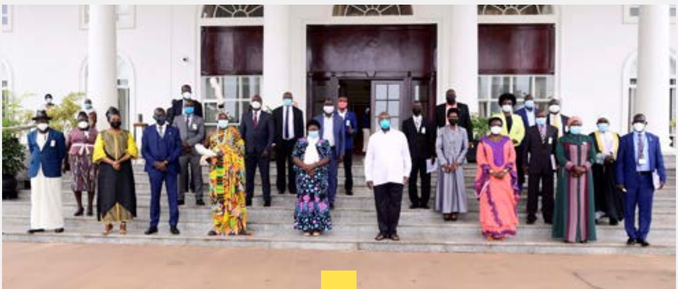
President Museveni posing for a photo with a delegation from West Nile after a meeting at State House, Entebbe

The Minister of State for Education and Sports (Primary Education) Dr Joyce Kaducu Moriku and the Minister of State for Defence and Veteran Affairs (Veteran Affairs) Hon. Huda Abason Oleru also attended the meeting.