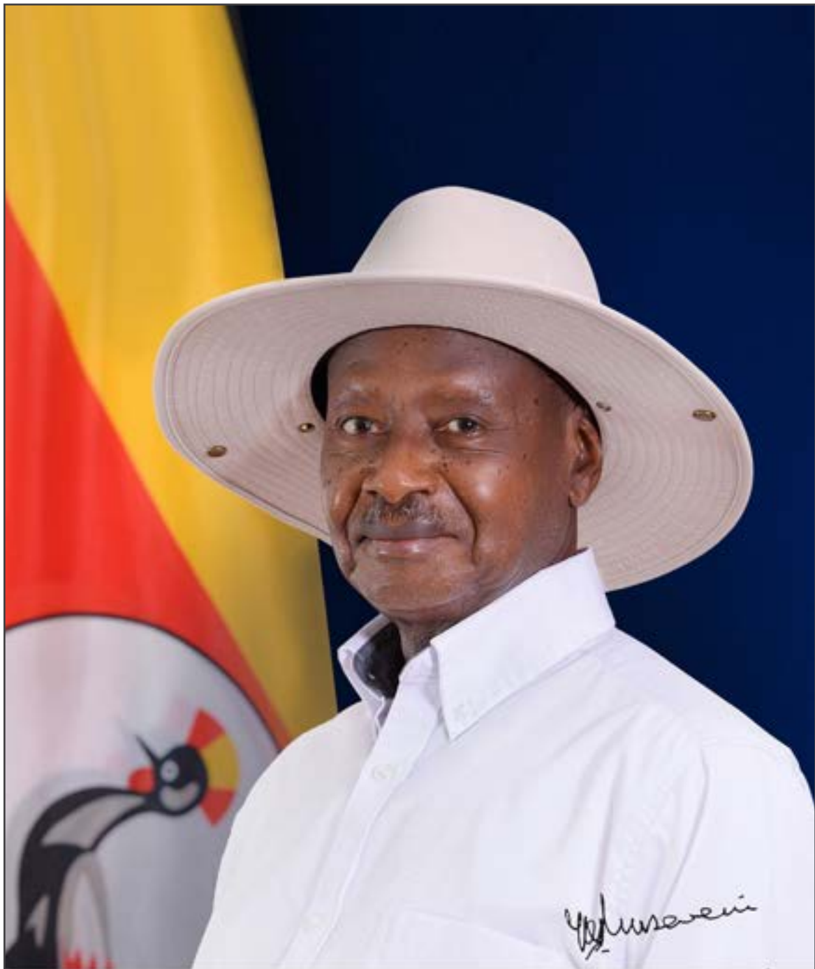
H.E. GEN. YOWERI KAGUTA MUSEVENI PRESIDENT OF THE REPUBLIC OF UGANDA