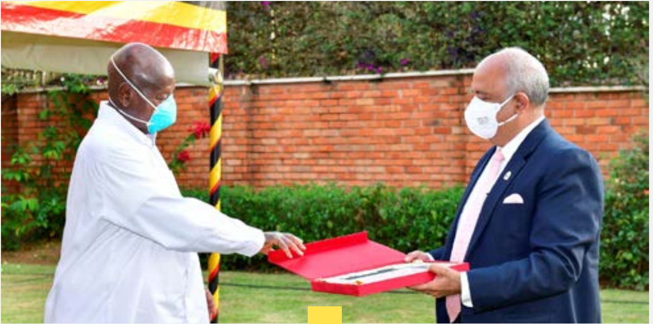
President Museveni receives a gift from Rotary International President (14th September, 2021)