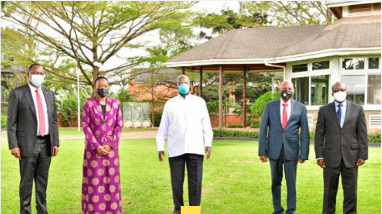
President Museveni poses for a photo with Amb. Monica Juma and other officials

Other members of the Kenyan delegation included Ambassador Raychelle Omamo, the Kenyan Cabinet Secretary for Foreign Affairs. Ambassador Monica Juma conveyed to President Museveni warm greetings from the President and the people of Kenya to President Museveni and the people of Uganda.