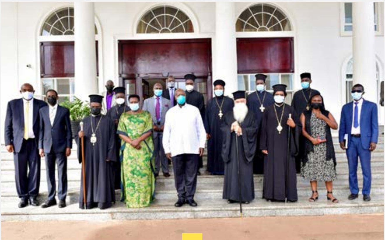
President Museveni and Vice President Jessica Alupo pose for a photo with Orthodox Church leaders at State House, Entebbe