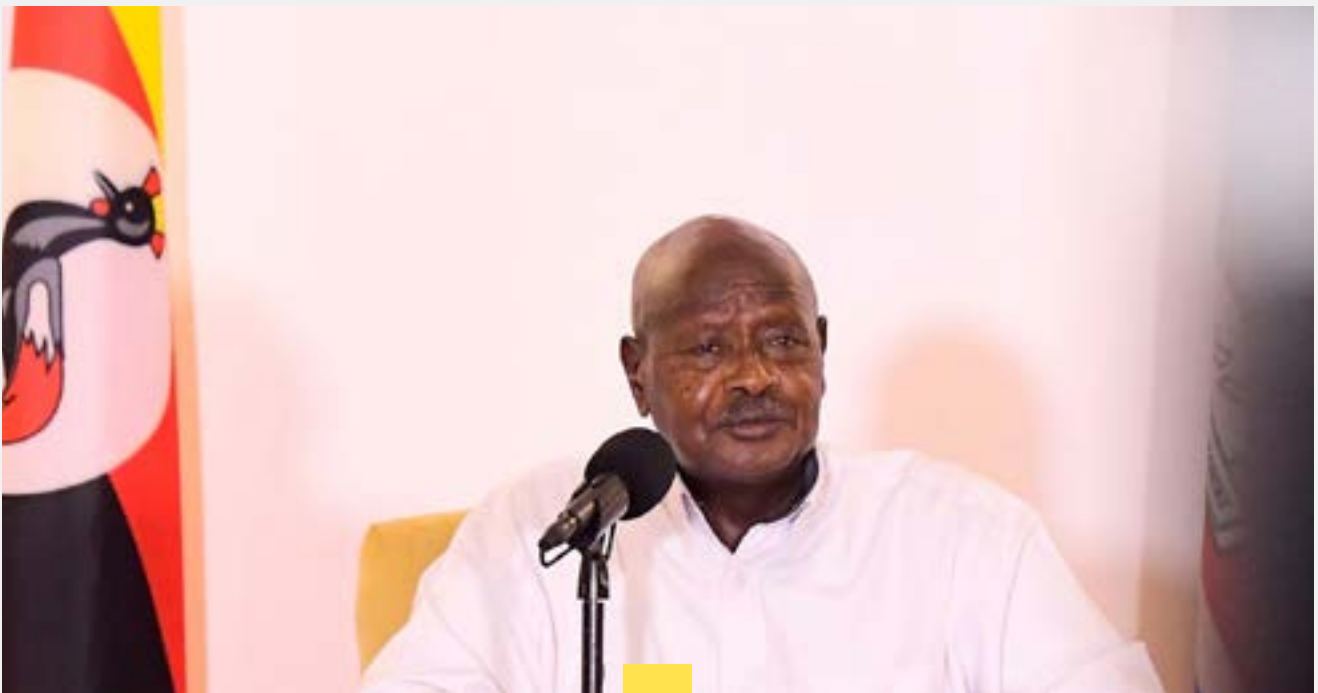
President Museveni addressing the nation on security matters on 15th August, 2021.

“Nobody should be in the uniform of the army if you don’t respect the people of Uganda,” he added.