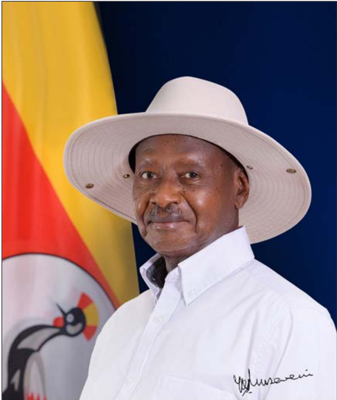
H.E. GEN. YOWERI KAGUTA MUSEVENI PRESIDENT OF THE REPUBLIC OF UGANDA