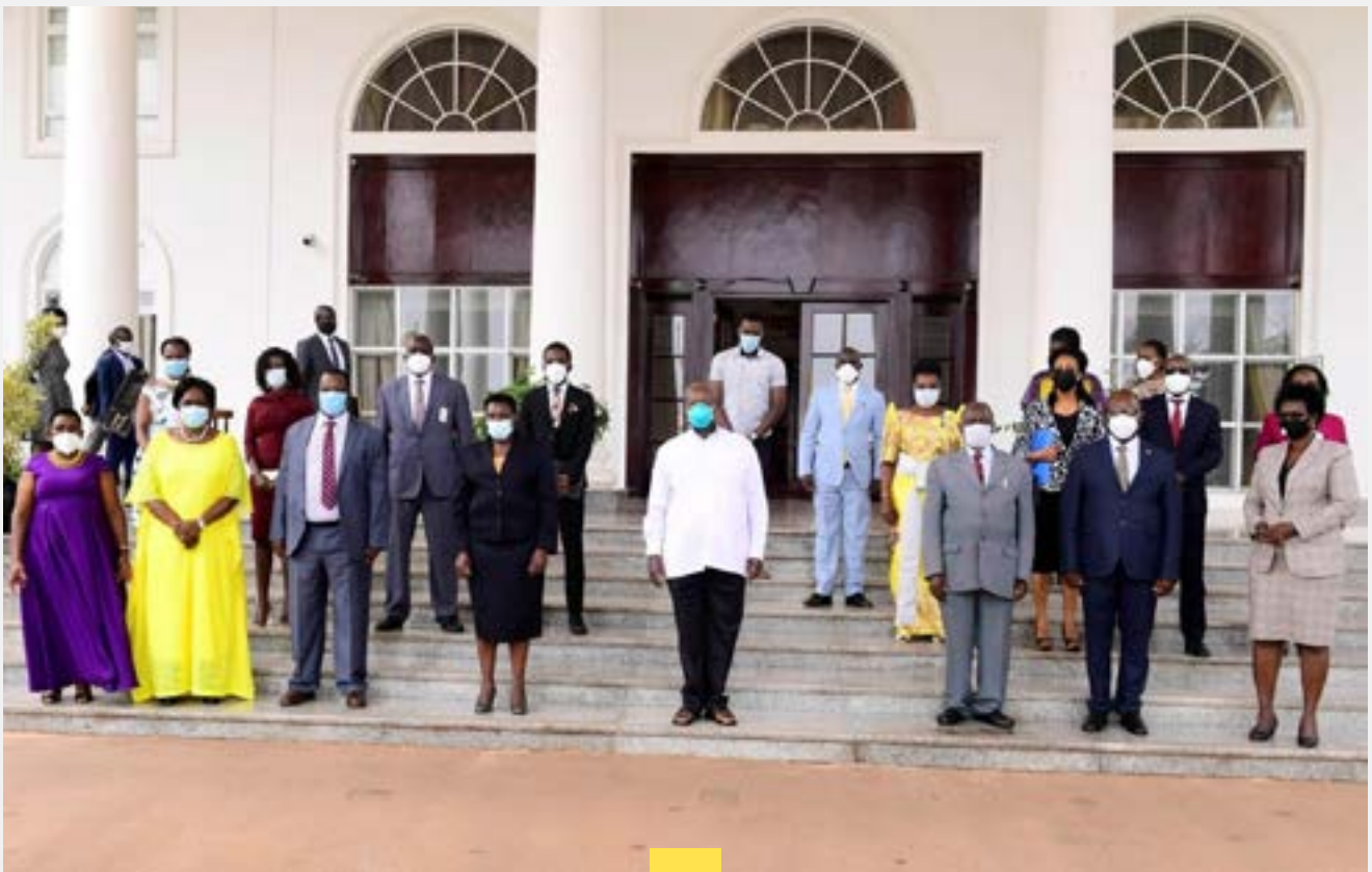
President Museveni posing with members of the Presidential CEO Forum after the launch, at State House, Entebbe