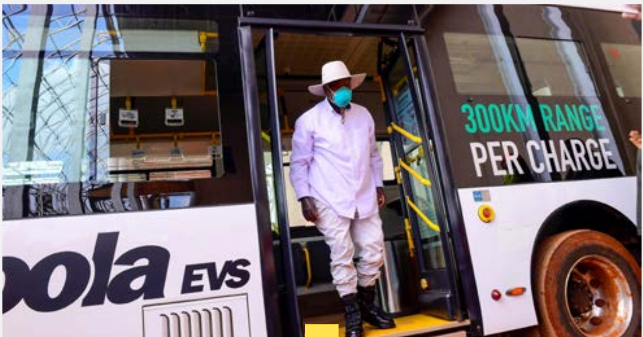
President Museveni disembarking from a bus manufactured at Kiira Motors

"The amount of money we spend importing vehicles is $550m per year. We earn over $500m from coffee and it all goes back when we import other people's vehicles. We are giving jobs to the Japanese and other nationalities. We are losing these jobs. This should end," the President said.