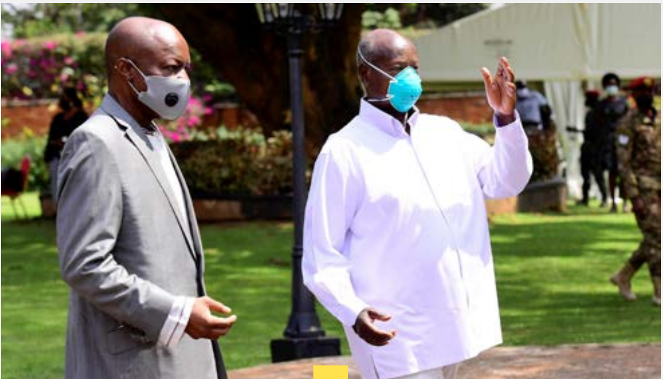
President Museveni walks with the Kabaka at State Lodge, Nakasero