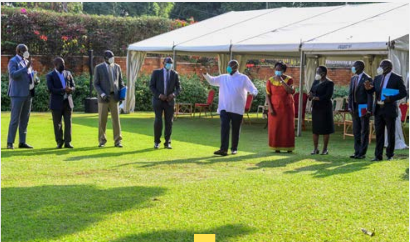
President Museveni posing for a photo with Acholi leaders led by Chief Justice, Alphonse Owiny Dollo

Apaa land sits on the border of Amuru and Adjumani districts and is contested between the two districts and Uganda Wildlife Authority (UWA). The Government evicted people from the disputed land following several clashes between the Madi ethnic group from Adjumani and their Acholi neighbours from Amuru.