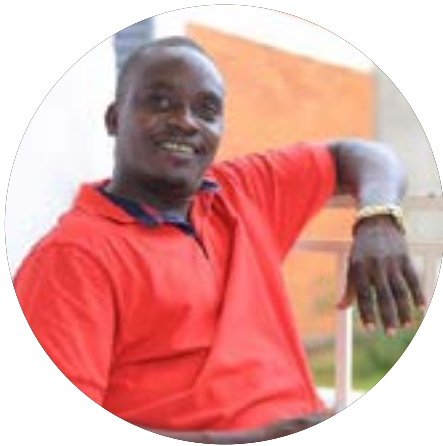
Robert Sharp Mugabe