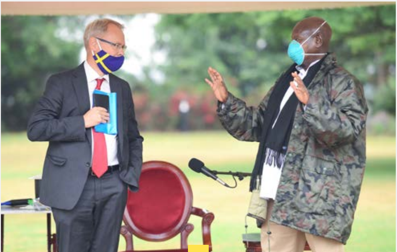
President Museveni chats with Ambassador Lindgarde at State House, Entebbe

The meeting was also attended by the Foreign Affairs Minister Hon. Jeje Odongo.