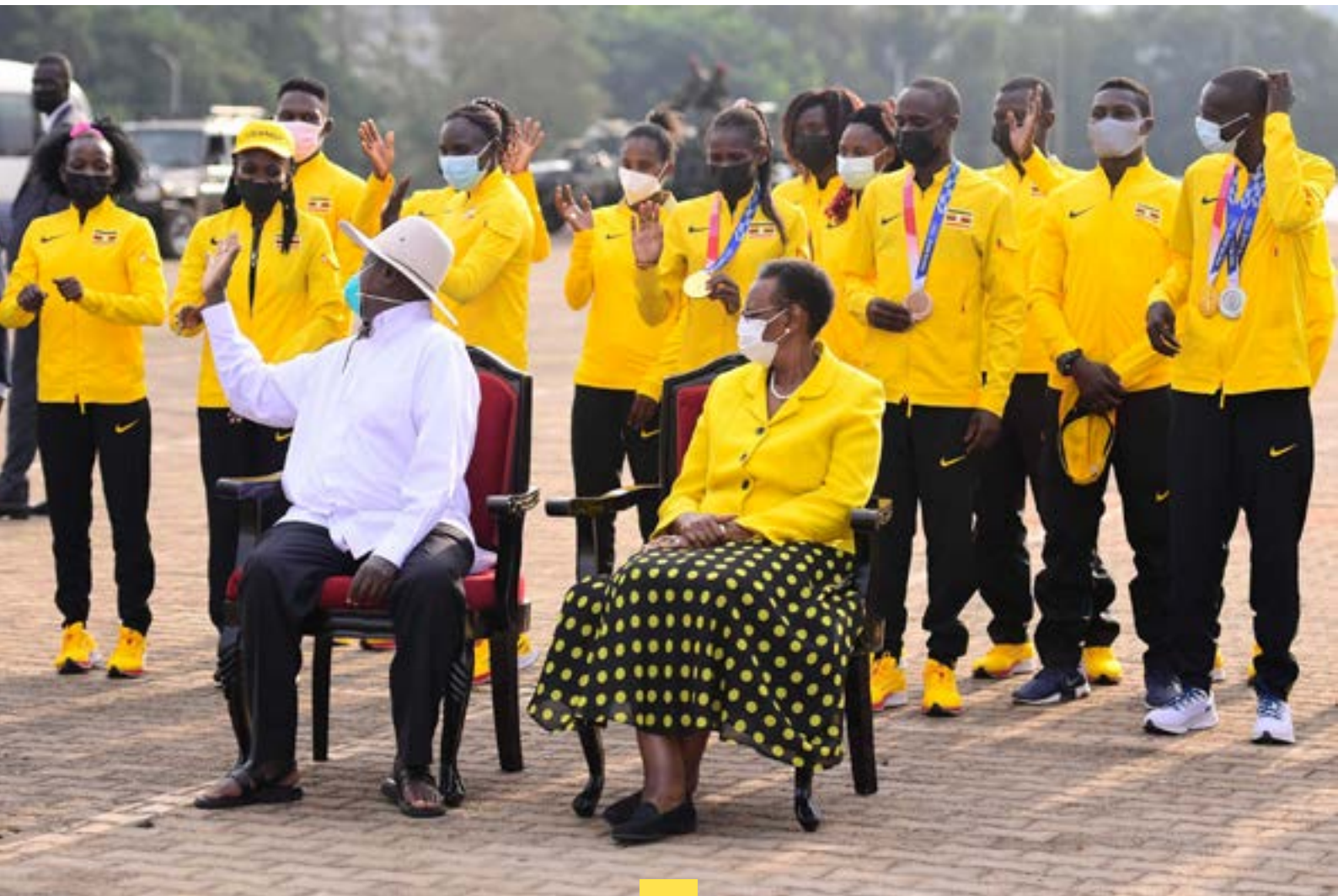
President Museveni with First Lady also Minister for Education and Sports posing for a photo with Uganda's Olympic Team