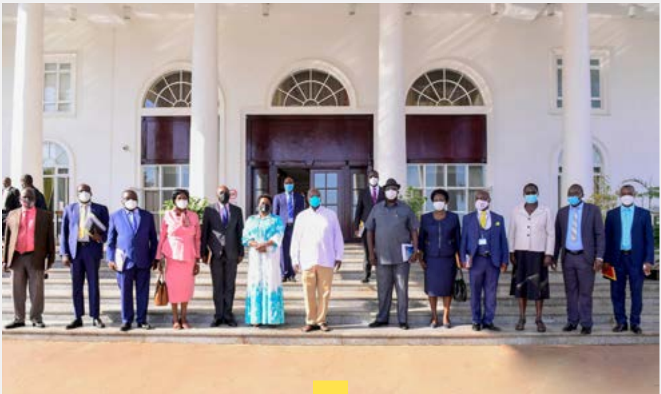
President Museveni posing for a photo with representatives of workers after the meeting at State House, Entebbe

NSSF is a government agency responsible for collection, safekeeping, responsible investment and distribution of retirement funds from employees in the private sector who are not covered by the government retirement scheme.