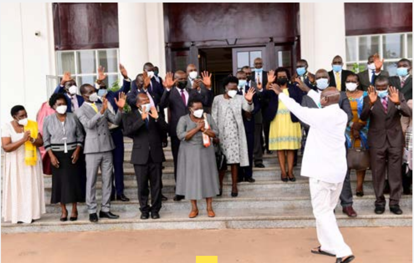
President Museveni waves to Bunyoro leaders after a meeting at State House, Entebbe

In 2015 Parliament of Uganda passed a resolution urging government to start public universities in Lango, Teso, Kigezi, Busoga and Bunyoro among other areas.