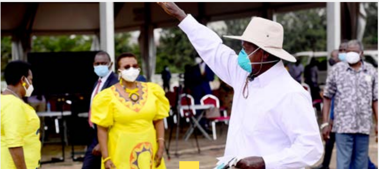
The President gestures to NRM Members of Parliament during the party caucus meeting at Kololo Independence Grounds

The caucus meeting was attended by the Vice President (Rtd) Maj. Jessica Alupo, Prime Minister Nabbanja, Ministers and independent NRM-leaning members of Parliament among others.