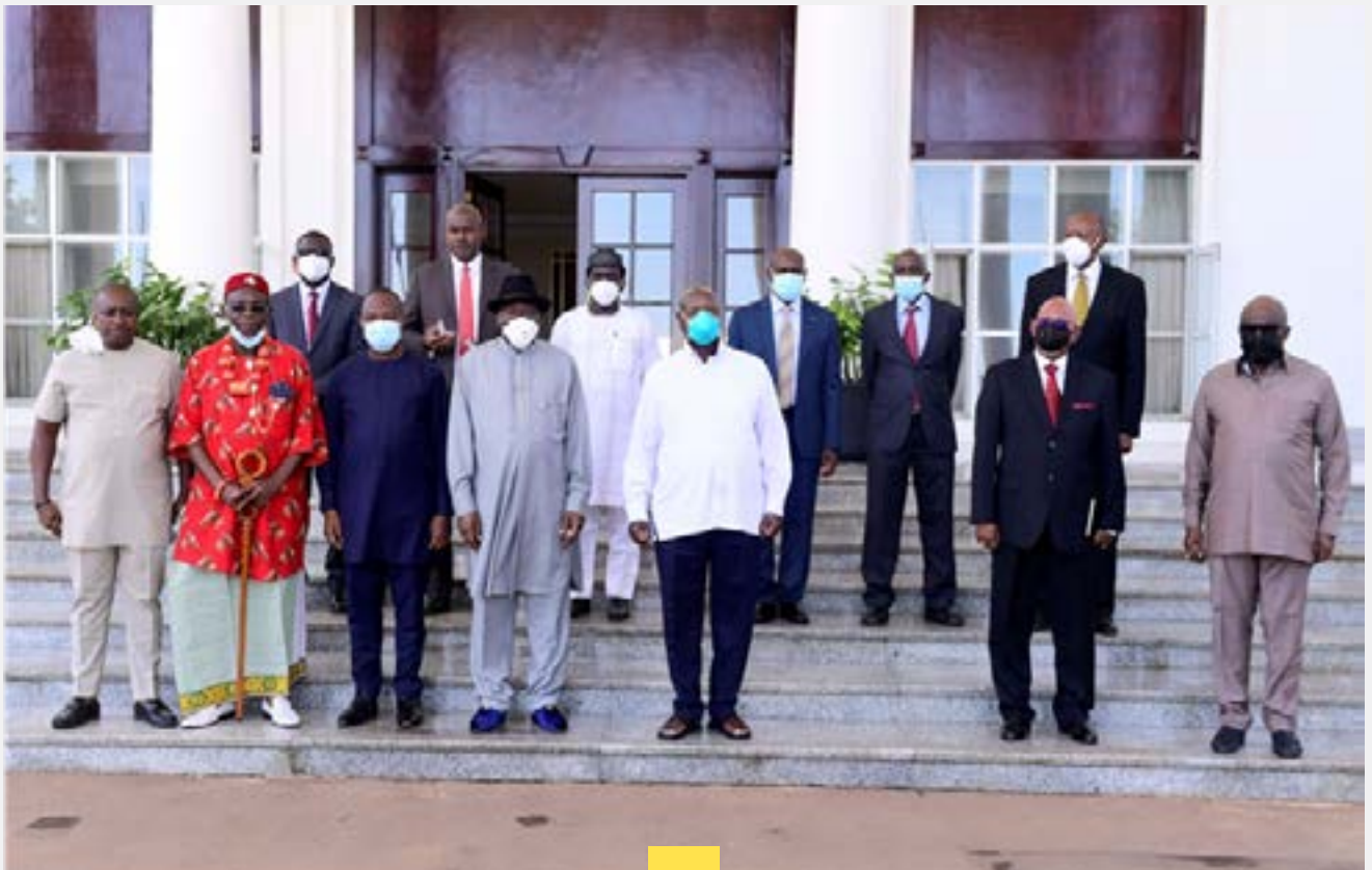
President Museveni poses for a photo with H.E. Goodluck Jonathan and his entourage after a meeting at State House, Entebbe

A distinguished scholar, H.E. Dr Goodluck Jonathan who holds a Ph.D. in Zoology from the University of Port Harcourt, Nigeria, and has previously served as Governor of Bayelsa State, Vice President of the Federal Republic of Nigeria and in 2010 became the 14th President of the Federal Republic of Nigeria.