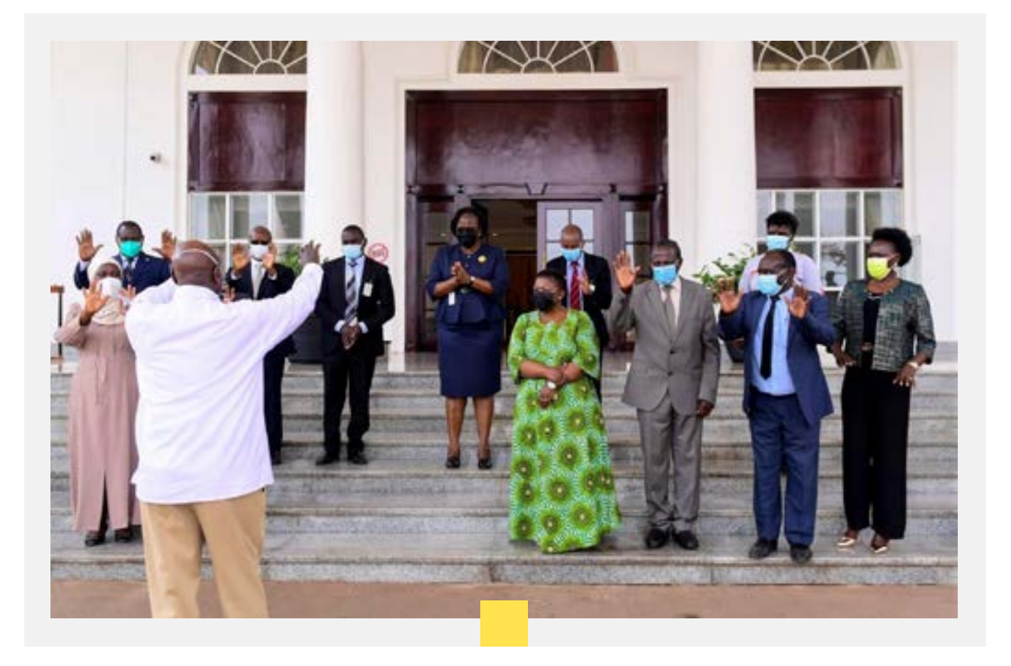
The President waves to Ministers, Heads of Government Agencies and METU proprietors after a meeting at State House, Entebbe

"What I will not accept are contracts that make you import buses. There is no way somebody can tell me that peripheral roads more important than factories. How can a planner equate productive capacity with a road especially manufacture of automobiles," he said, adding that in the 60s, the Kabandole bus services where moving around Kampala and neighbouring areas.