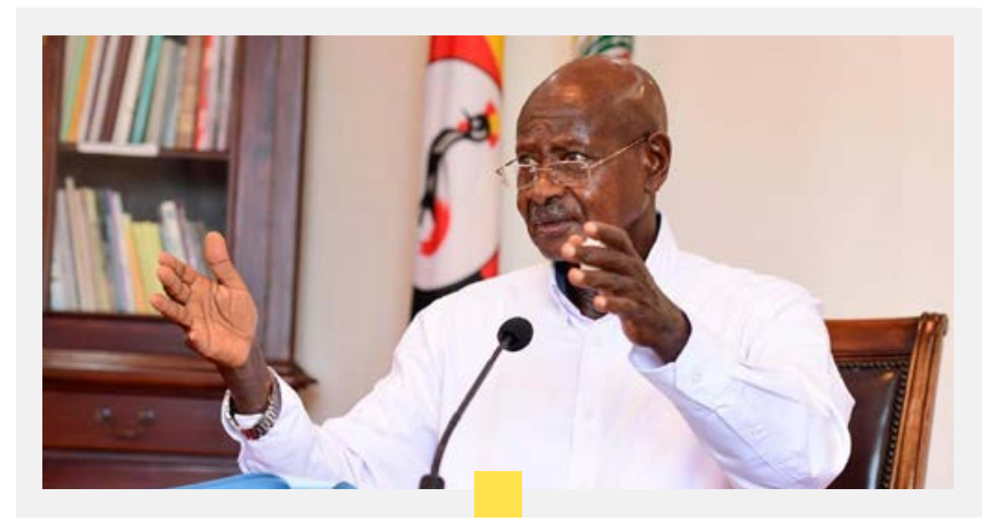
President Museveni addresses the Nation during a previous COVID19 address.