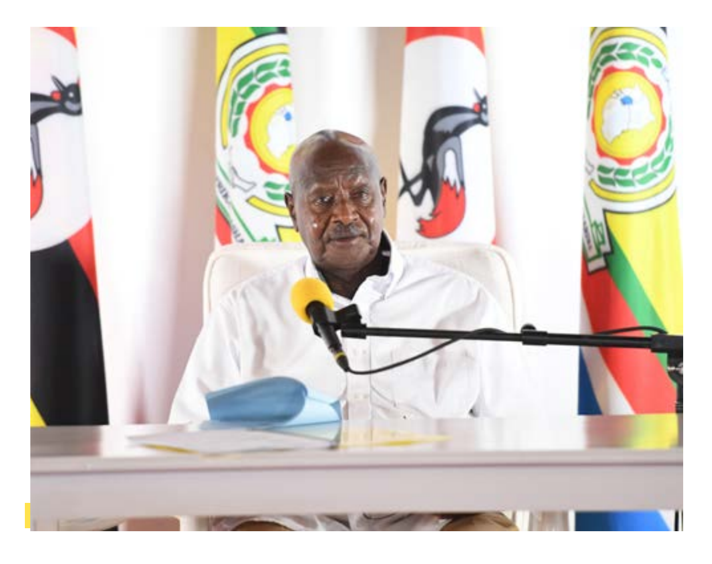
H.E. the President during one of the COVID-19 National Addresses.

In his speech, the President closed most of the non-agricultural activities, private and public transport except cargo trucks among other measures.