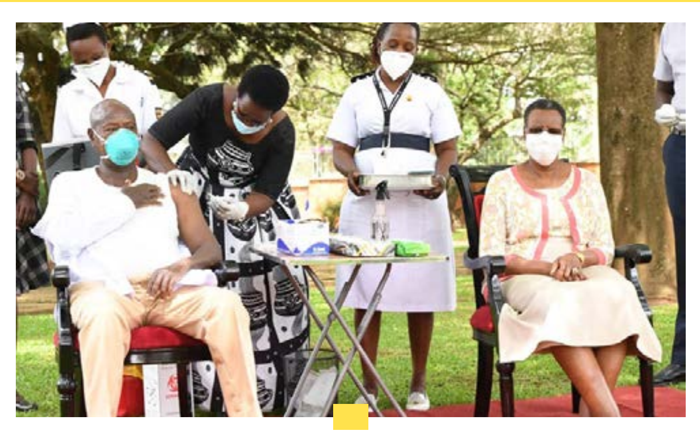
H.E. the President receiving the second COVID jab at State Lodge, Nakasero