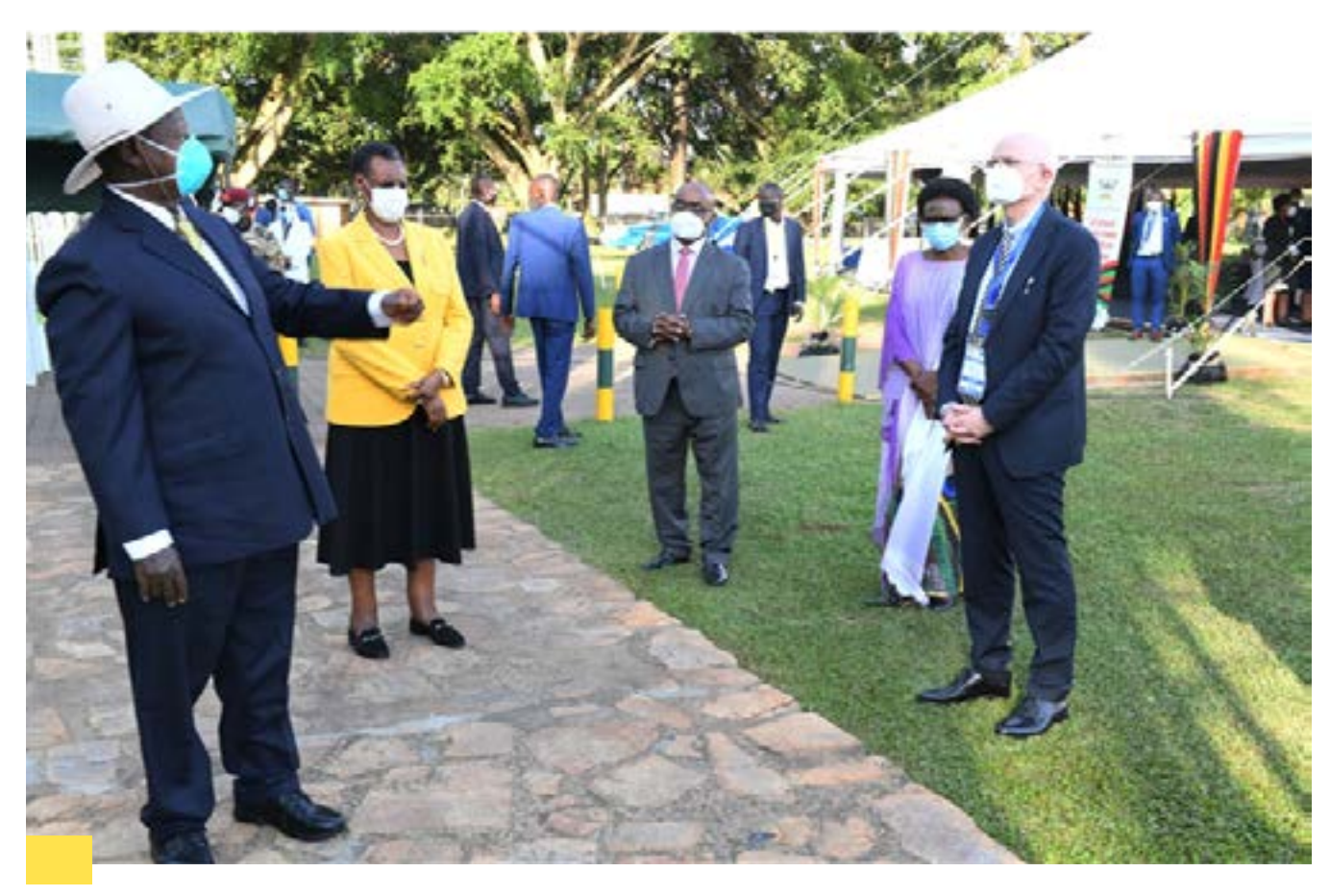
H.E. the President and First Lady are received by dignitaries upon arriving at Munyonyo to address the World Health Summit

tried among some patients and most of them have fully recovered, while the others are still on treatment. We target to reach 124 patients before we are sure that this medicine treats Covid-19 patients. I salute the few outsiders that helped us. I, therefore, appeal to our regional scientists to work together and put up a united front", said the President.