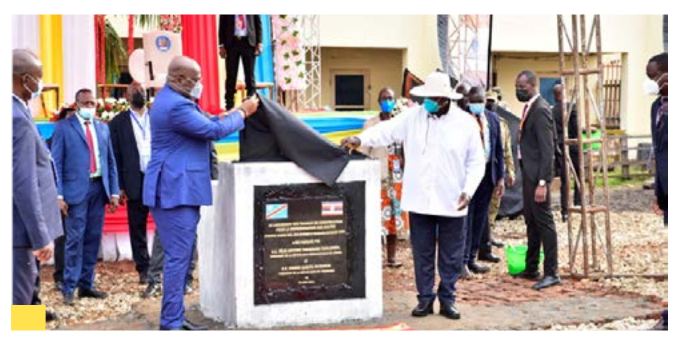
H.E. the President and his DRC counterpart unveiling the foundation stone, marking the start of the Uganda-DRC road project.