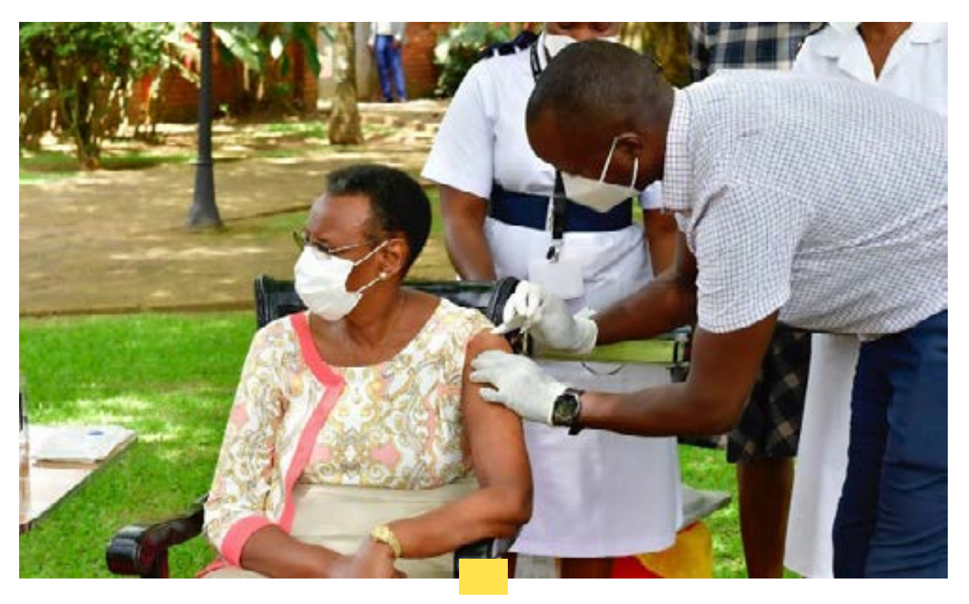
First Lady receiving a second COVID jab at State Lodge, Nakasero