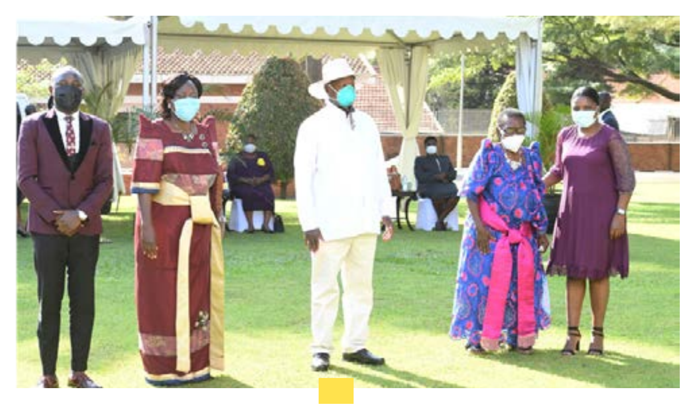
H.E. the President posing with Rt. Hon. Rebecca Kadaga after she took her oath as 1st Deputy Prime Minister and Minister for East African affairs.