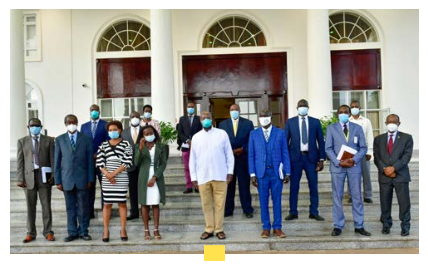
H.E. the President posing with members of UMA after a meeting at State House