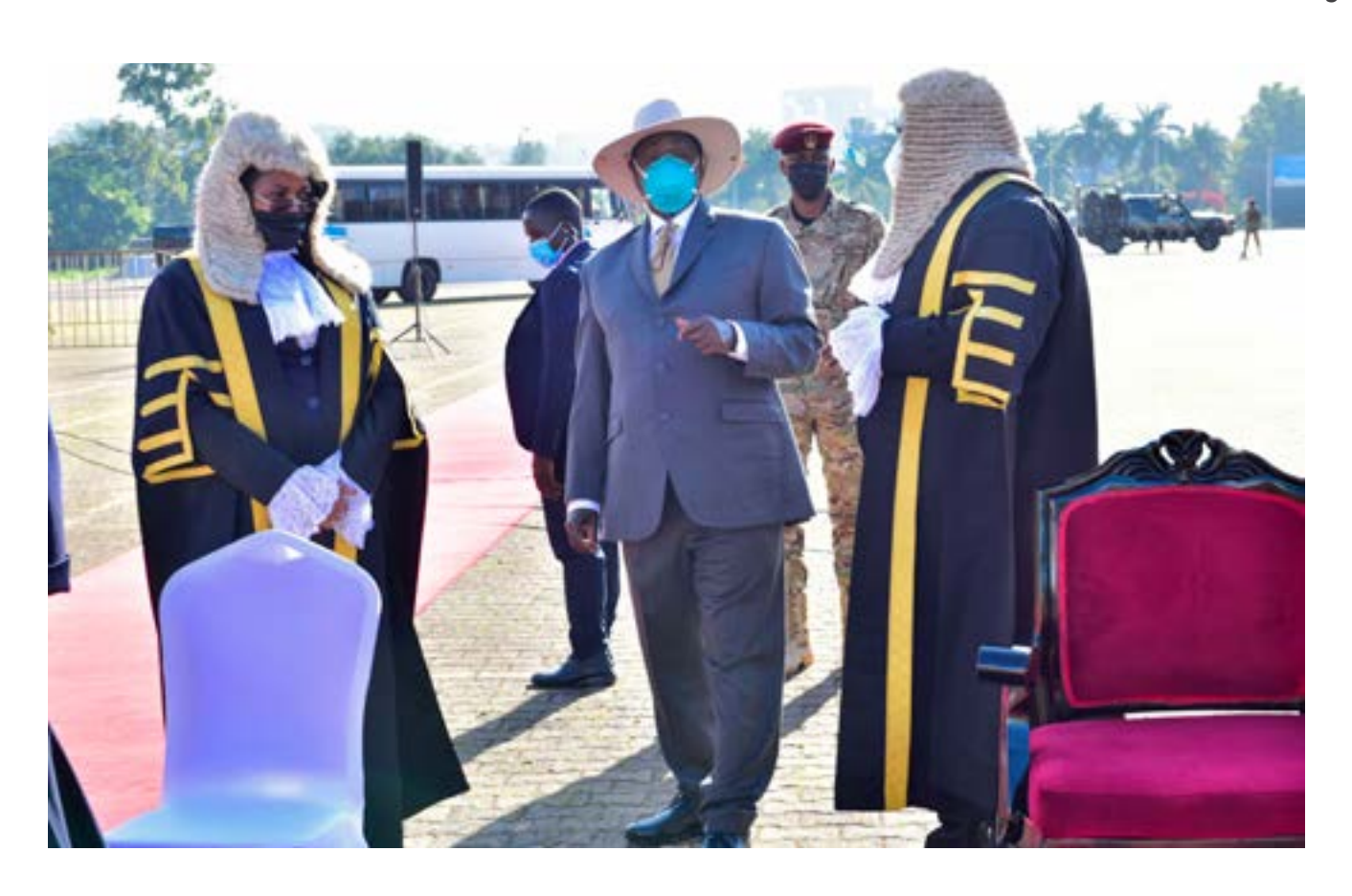
H.E the President chats with the Speaker and Deputy Speaker of Parliament after the budget speech at Kololo Independence Grounds.

The President told the nation that the isolated cases of criminality